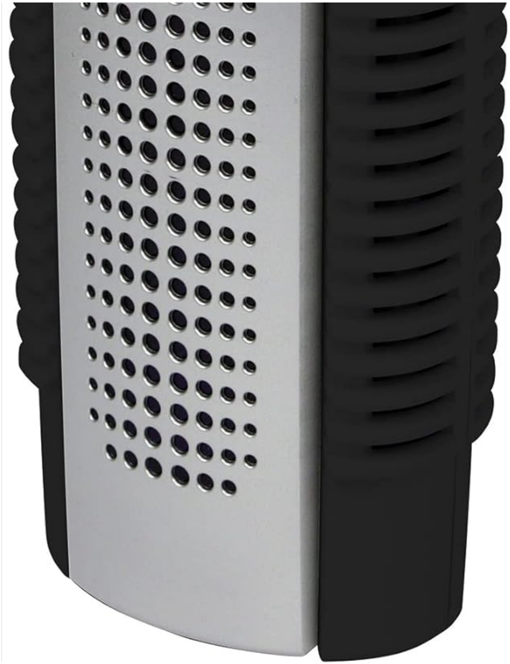
Figure 1: Envion Therapure TPP50 Ionic Pro Mini Plug-In Air Purifier (Black)