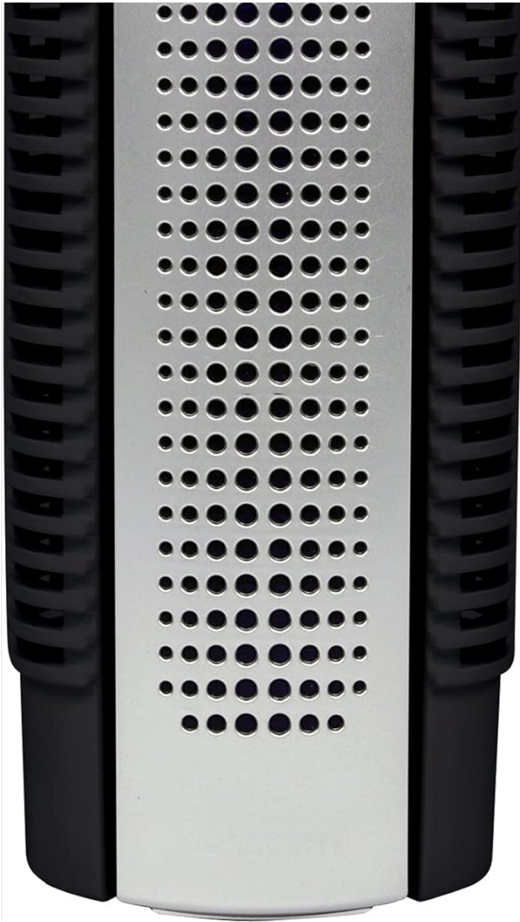
Figure 3: Front view of the air purifier.