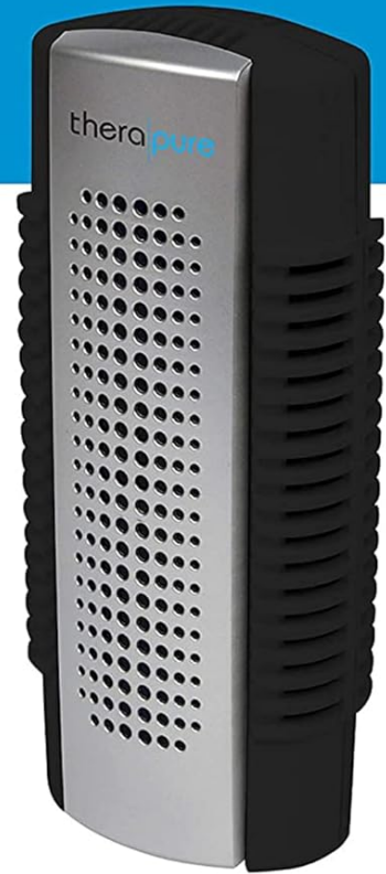
Figure 2: Rear view of the unit and typical placement in a bathroom.