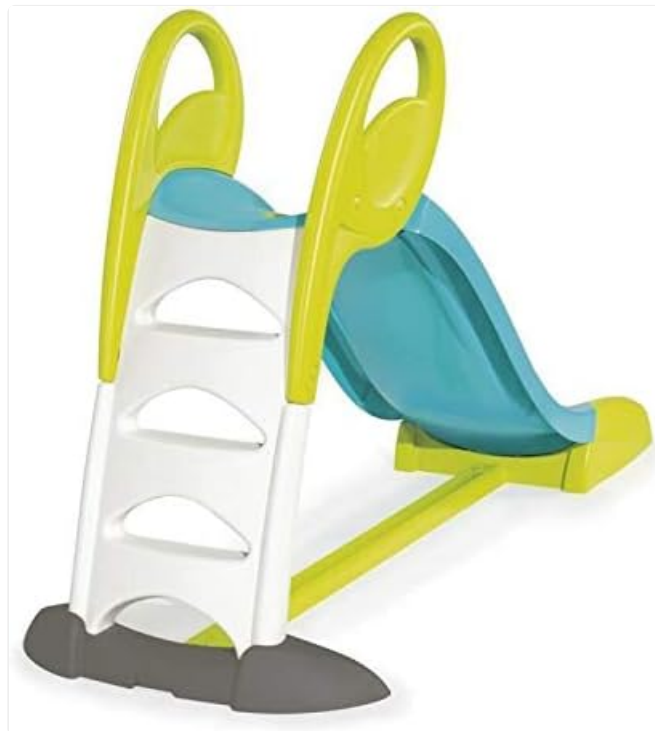
Image 1: Fully assembled Smoby Garden Slide, showing the ladder and slide chute.