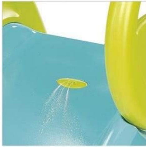
Image 3: Close-up view of the water hose attachment point on the slide chute, showing water spraying.