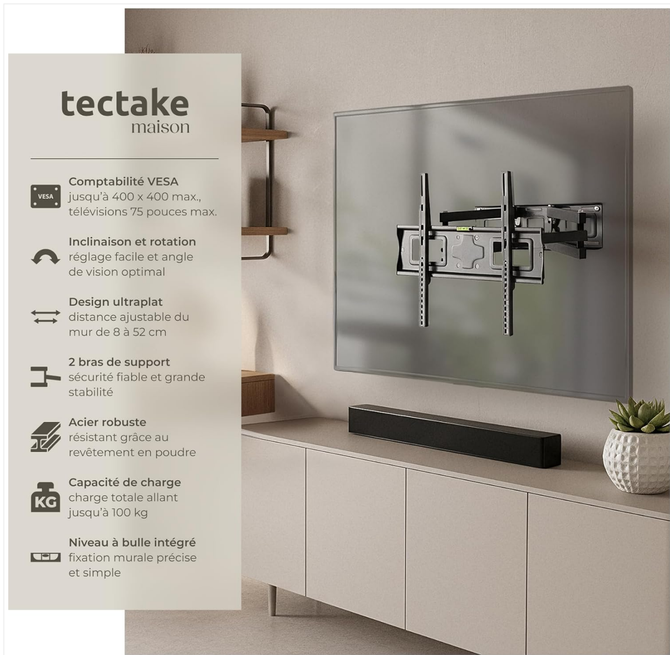
Image 3.1: Overview of the wall mount's key features, including VESA compatibility, tilt and rotation, adjustable wall distance, robust construction, and load capacity.