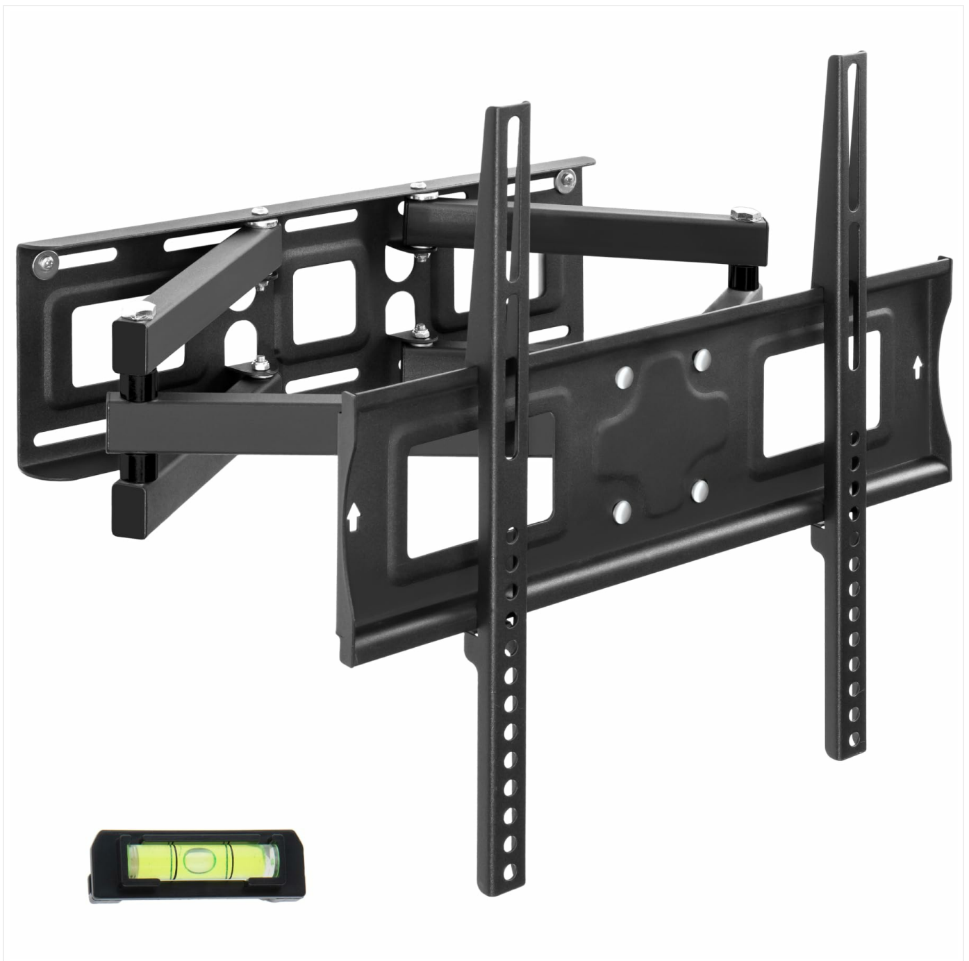
Image 1.1: tectake TV Wall Mount, Model 401288. This image shows the complete wall mount assembly.