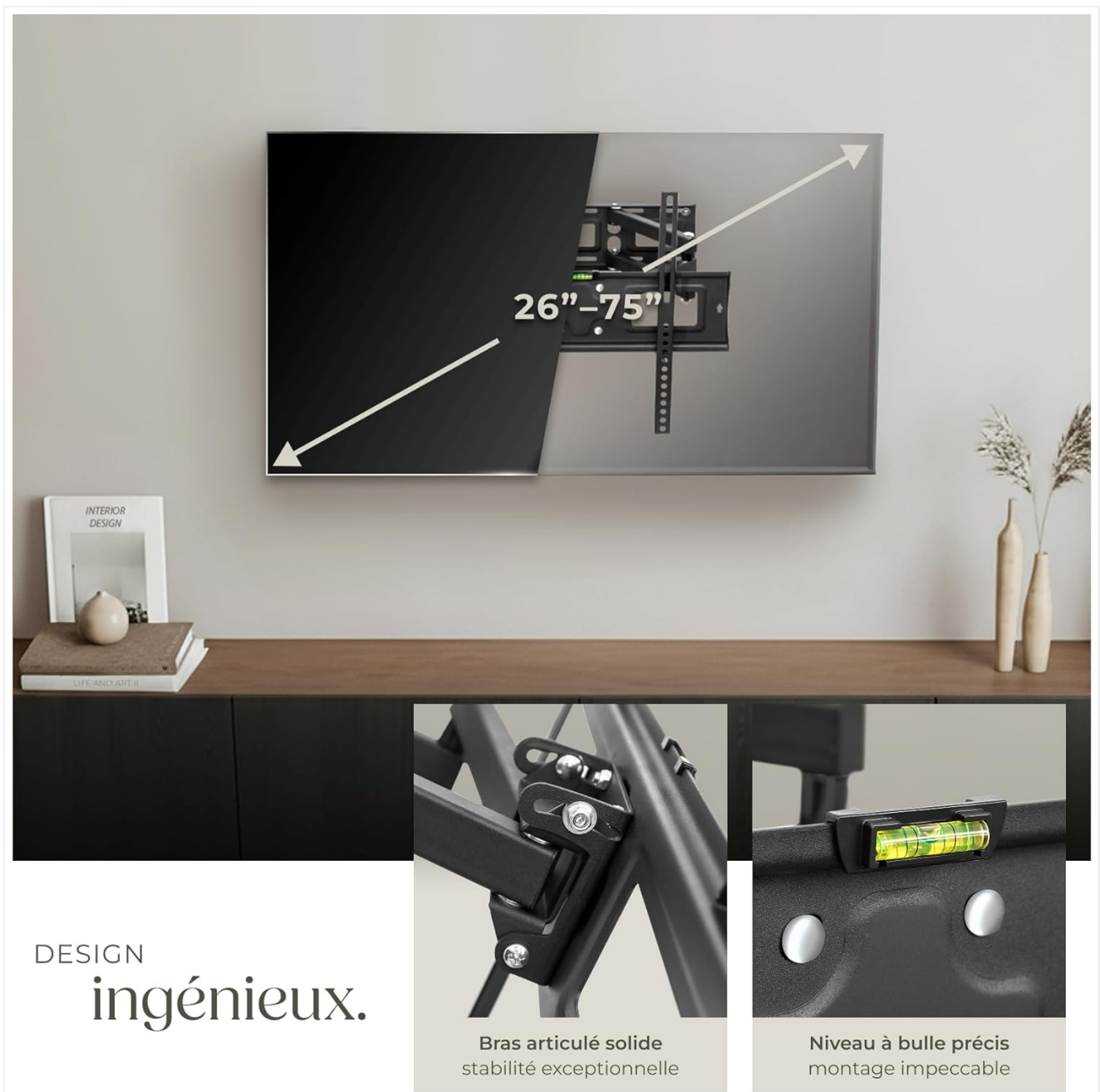
Image 2.2: Diagram illustrating the TV size compatibility (26-75 inches) and the use of the integrated spirit level for accurate wall mounting.