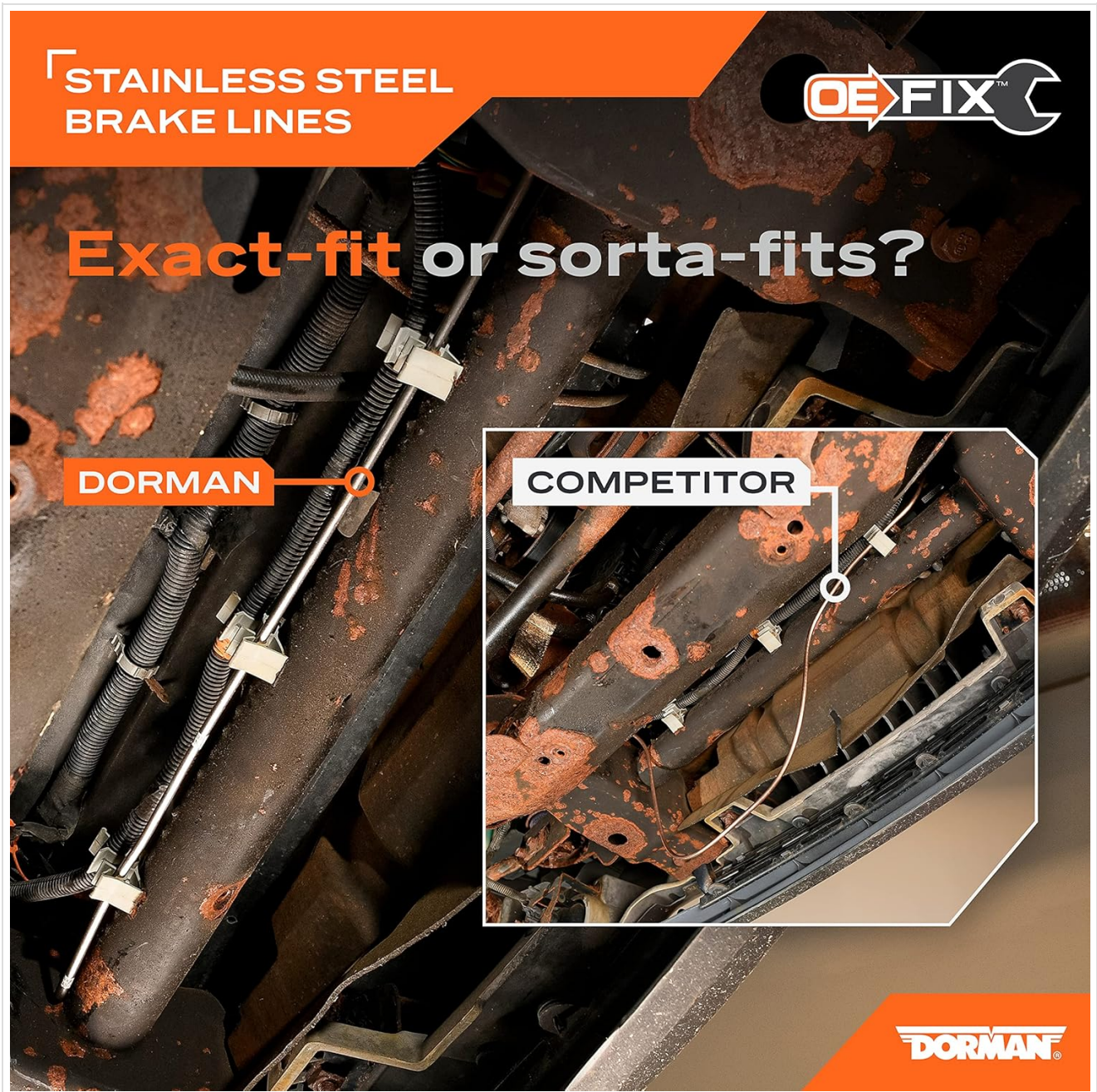
Image 2.1: A visual comparison highlighting the precise fitment of Dorman stainless steel brake lines against a competitor's line on a vehicle chassis.