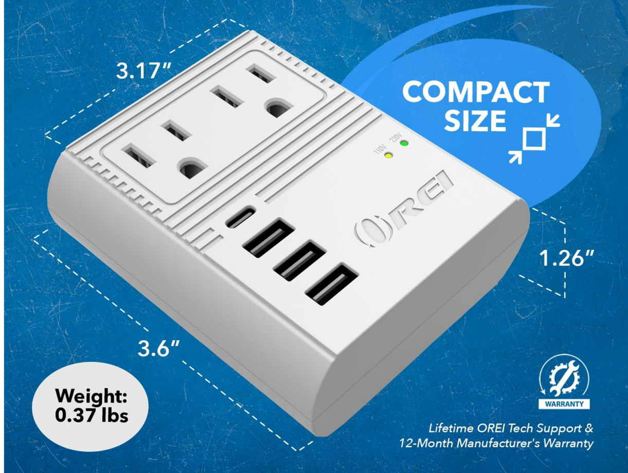
Figure 5: OREI M8 Max Technical Specifications and Dimensions