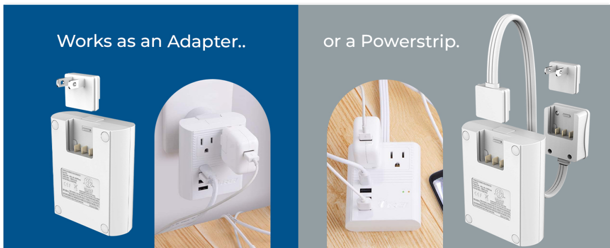
Figure 2: Adapter used as a wall plug or with extension cable

The adapter can be used directly as a wall plug or as a power strip with the included extension cable, offering flexibility in various settings.