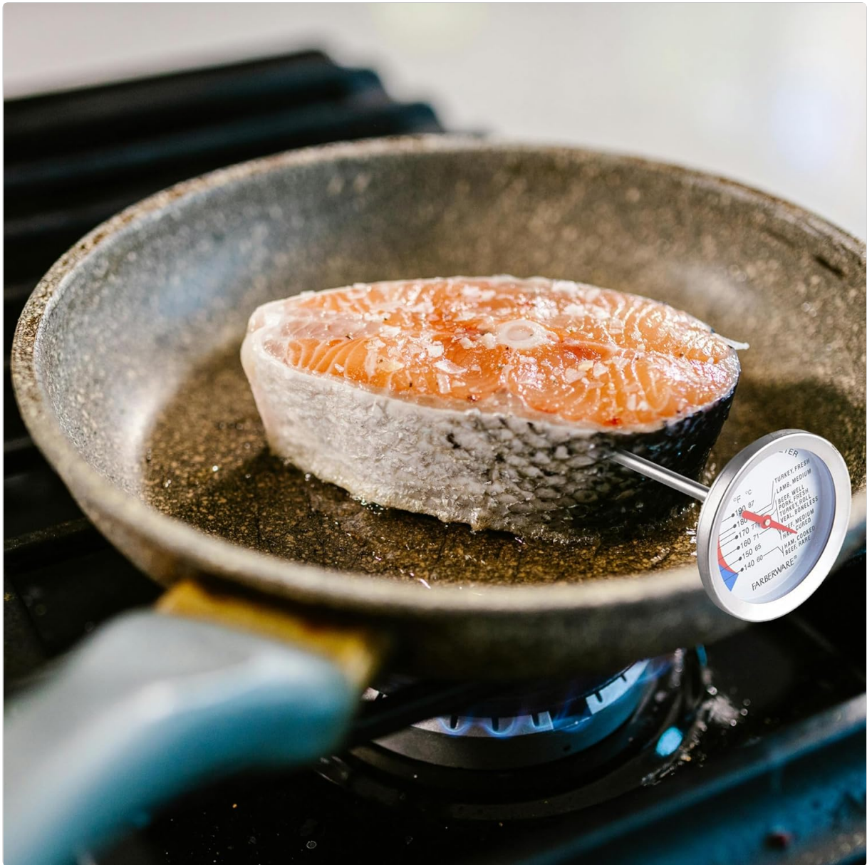
Image: The meat thermometer inserted into a piece of salmon while cooking, demonstrating proper placement for temperature measurement.