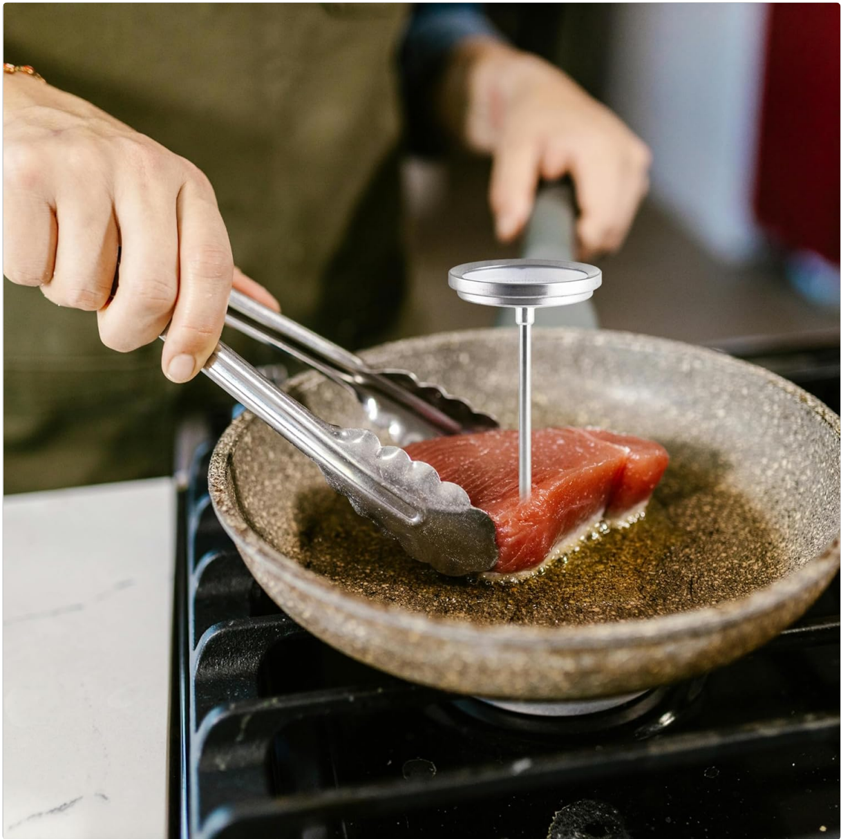
Image: The meat thermometer inserted into a piece of tuna steak in a pan, illustrating how to check internal temperature during cooking.