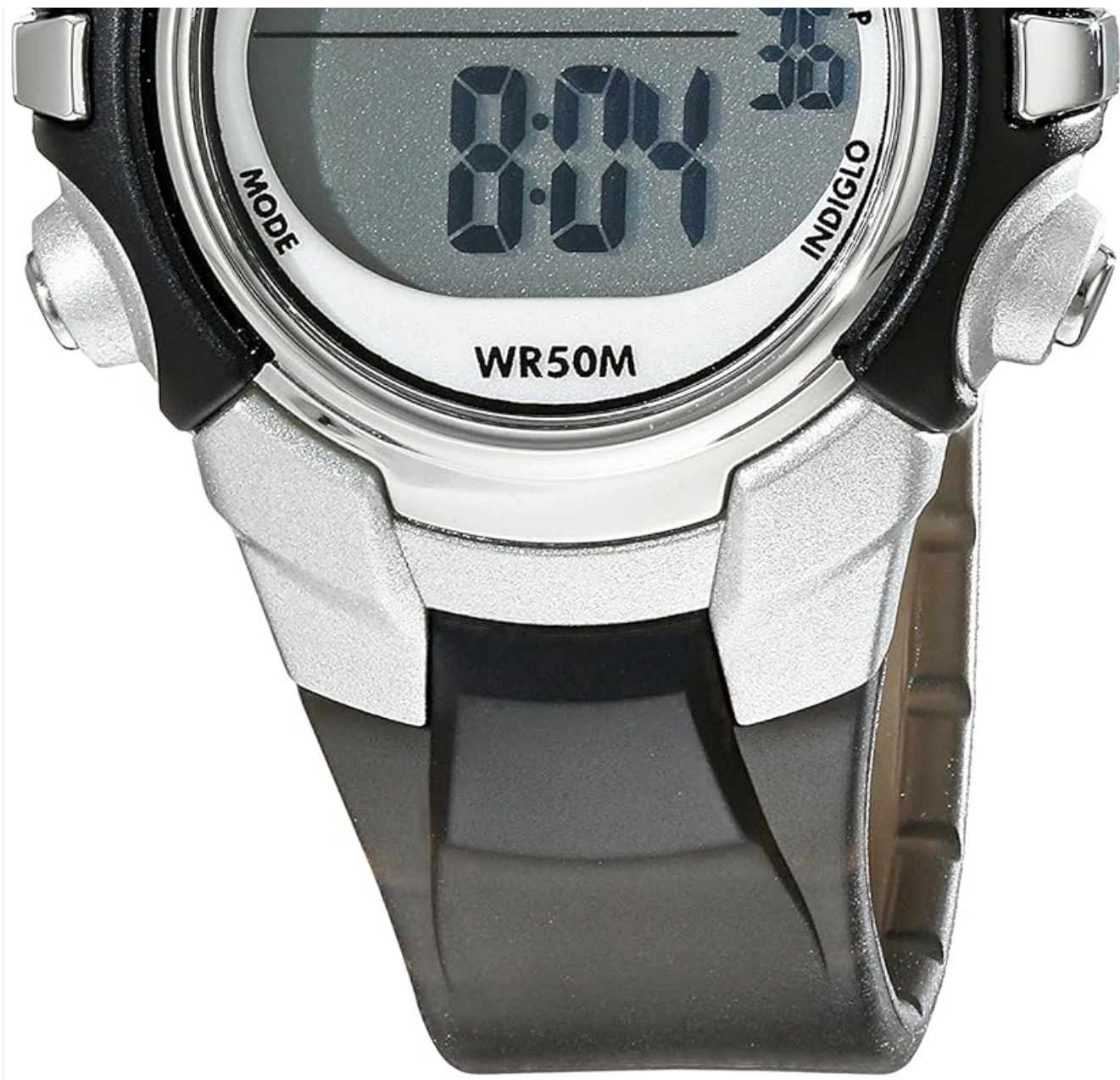
Front view of the Marathon by Timex T5K805 Digital Watch, showing the digital display and control buttons.