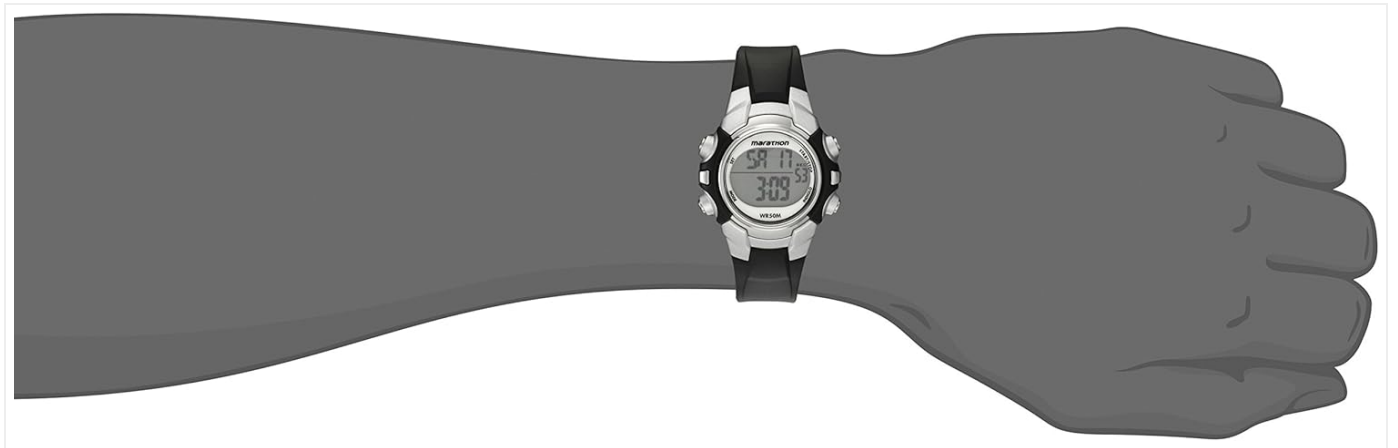
The Marathon by Timex T5K805 Digital Watch displayed on a wrist, illustrating its size and fit.

The watch can be configured to chime every hour. Access this setting through the MODE button and look for an option to enable/disable the hourly chime.