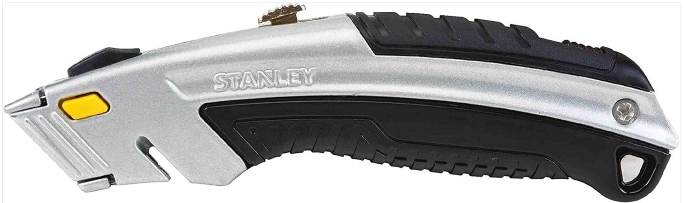
Image: The Stanley Retractable Utility Knife, Model 10-788, shown in its retail packaging. The knife features a silver body with black grip accents and a retractable blade mechanism.

This manual provides essential instructions for the safe and effective use, maintenance, and troubleshooting of your STANLEY Retractable Utility Knife, Model 10-788. Please read this manual thoroughly before operating the tool and retain it for future reference.