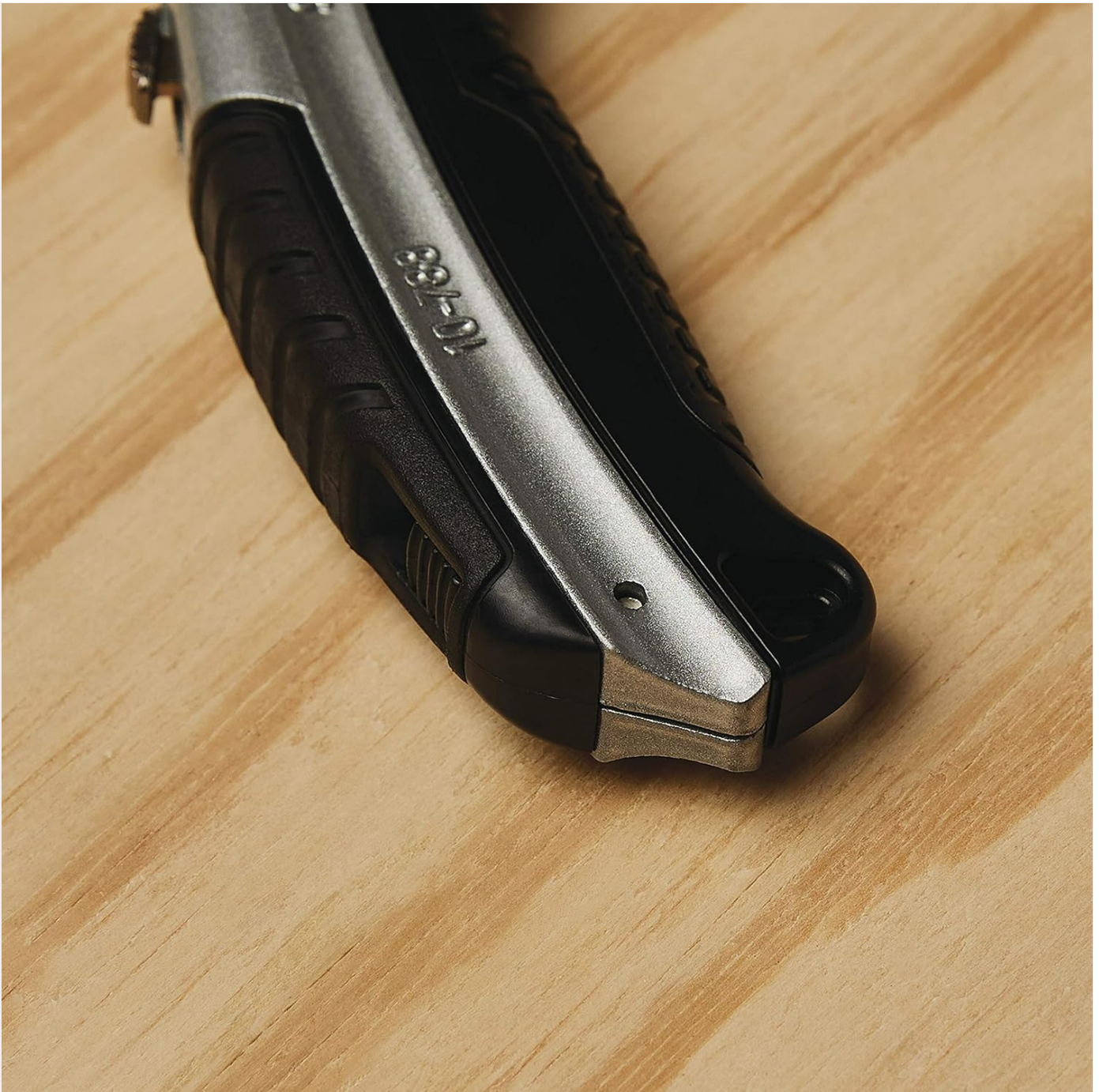
Image: A close-up view of the Stanley Utility Knife, highlighting the blade housing and the mechanism for blade insertion and removal. The silver body and black grip are visible.