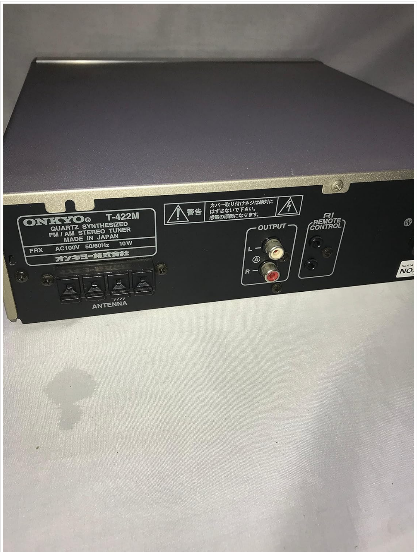
Figure 4.3: Rear Panel Connections. This image shows the rear panel of the ONKYO T-422M(S) Tuner, detailing the antenna input terminals (FM and AM), audio output jacks (L/R), and a remote control port. Important warning labels are also visible.