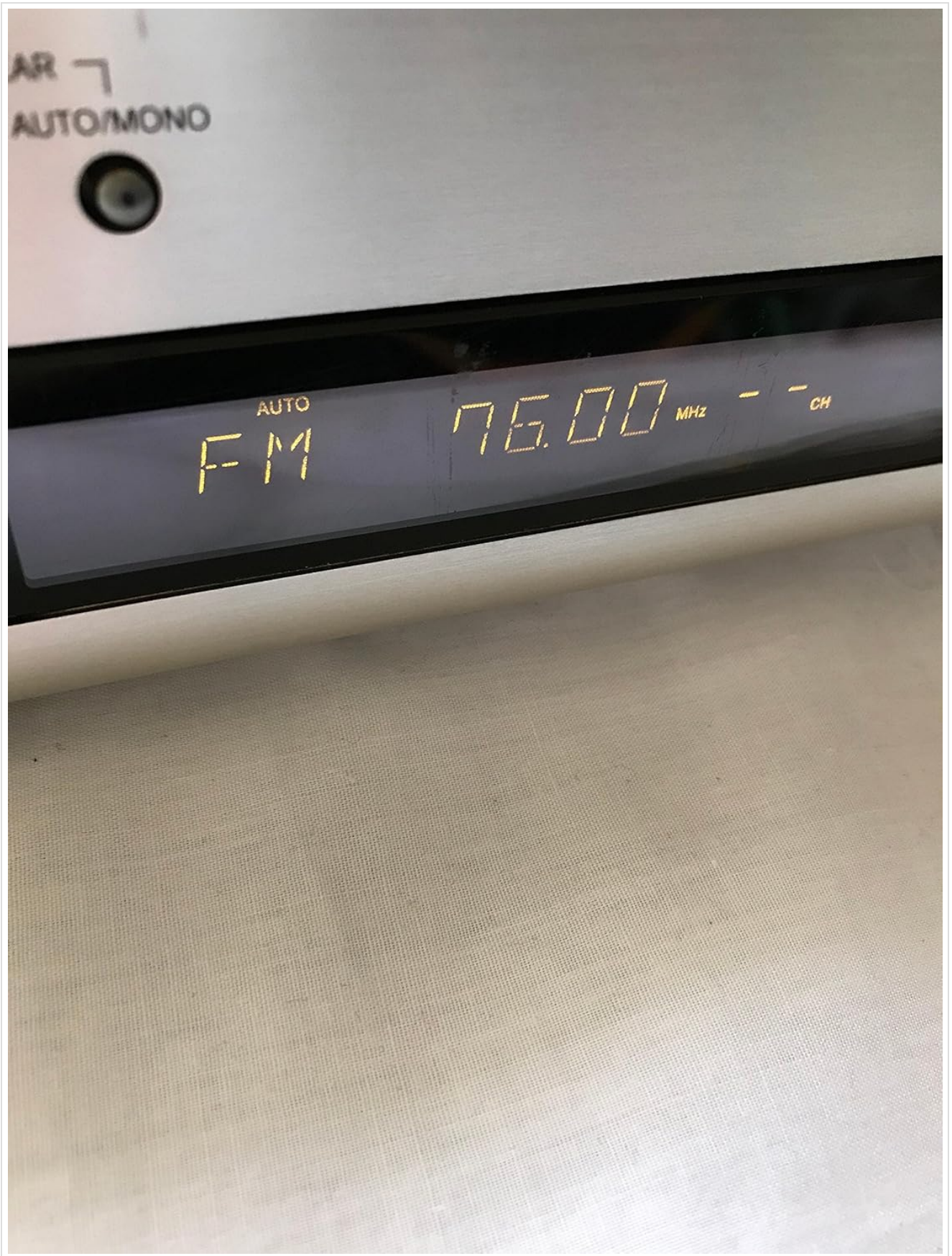
Figure 6.1: FM Frequency Display. This image shows the tuner's display indicating "FM" and a frequency of "76.00 MHz", demonstrating FM band reception.