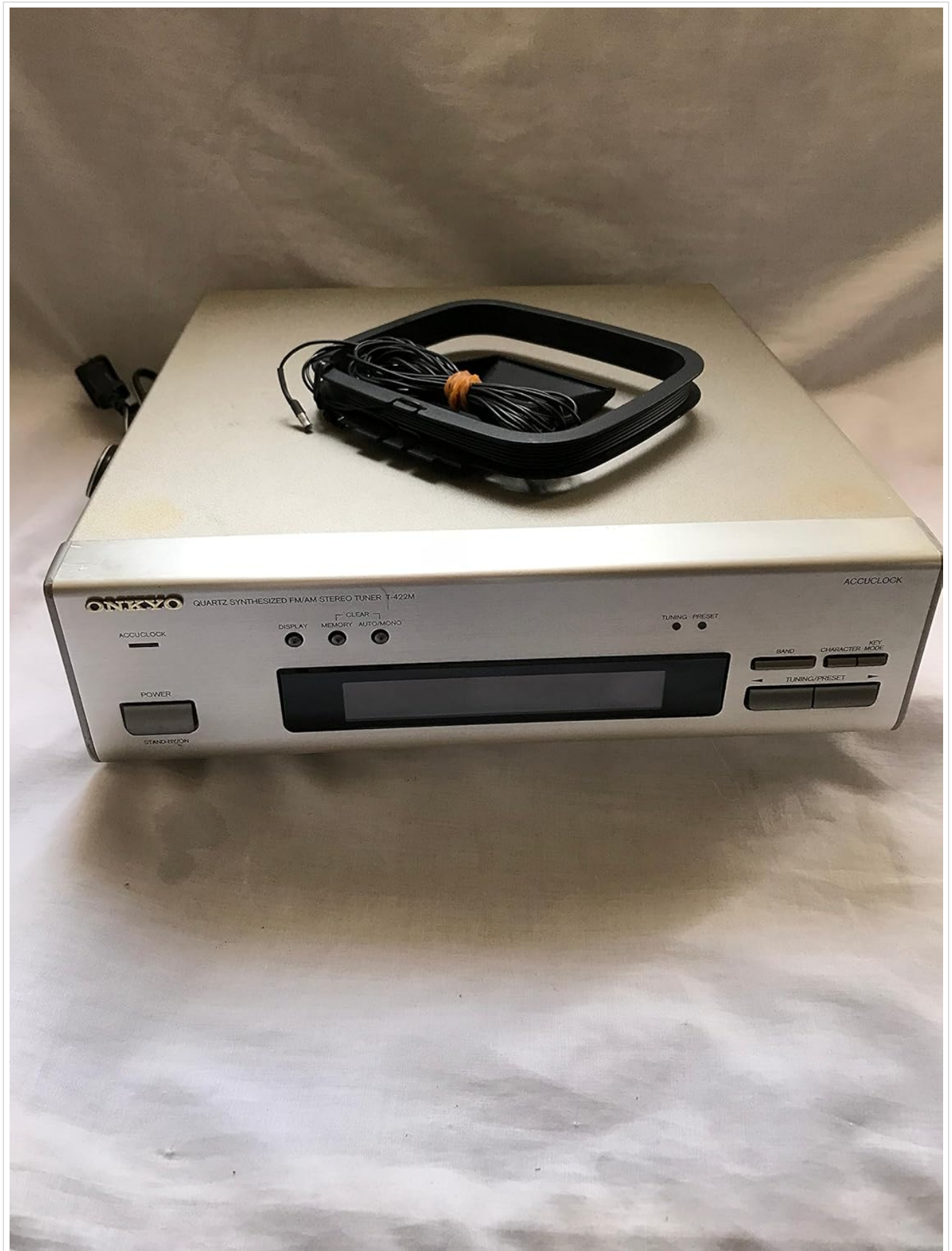
Figure 4.1: Front View of the Tuner. This image displays the front panel of the ONKYO T-422M(S) Tuner, showing the power button, display screen, tuning controls, and an AM loop antenna resting on the top surface of the unit.