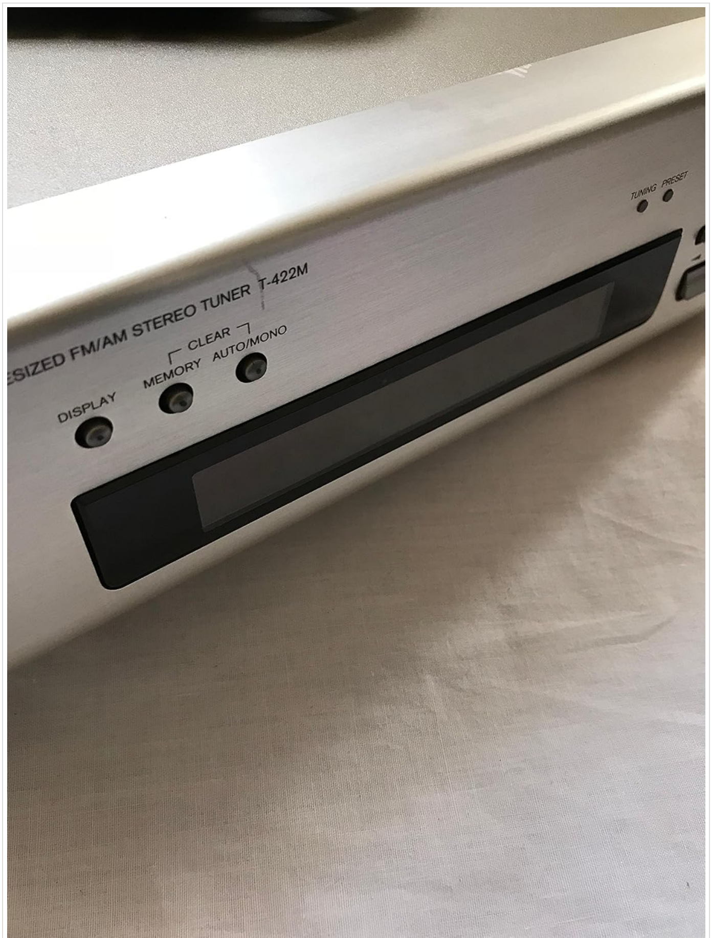
Figure 4.2: Front Panel Controls. A detailed view of the tuner's front panel, highlighting the display area and control buttons such as DISPLAY, CLEAR, MEMORY, and AUTO/MONO. The model name "QUARTZ SYNTHESIZED FM/AM STEREO TUNER T-422M" is clearly visible.