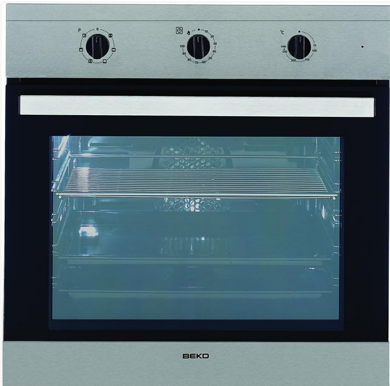
Figure 1: Front view of the Beko OSE 22120 X Multifunction Oven, showing control dials and glass door.