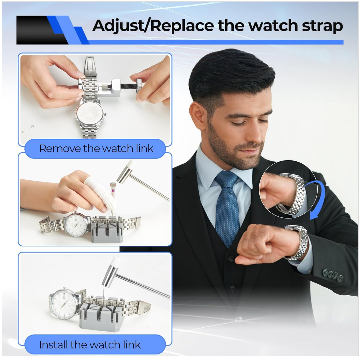
Image: The Watch Band Link Remover tool, demonstrating how to push out a pin from a watch link to adjust the band size.