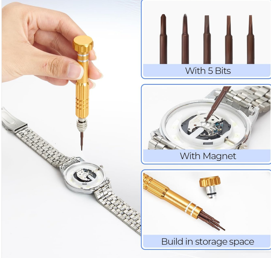
Image: A sequence of images demonstrating how to open a watch case and replace the battery using various tools from the kit.