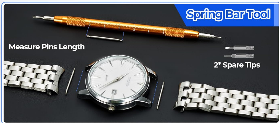
Image: A visual guide showing the process of removing and installing watch links using the provided tools.