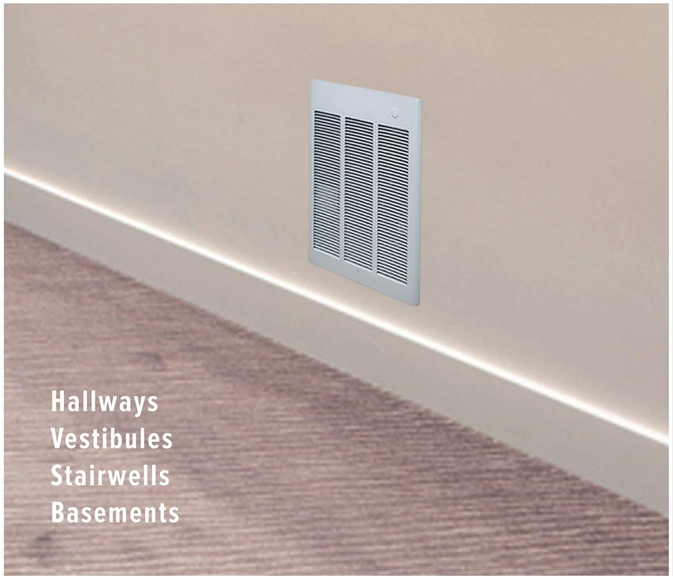
Figure 2: Example installation of the CWH3404F in a hallway, suitable for various indoor spaces.