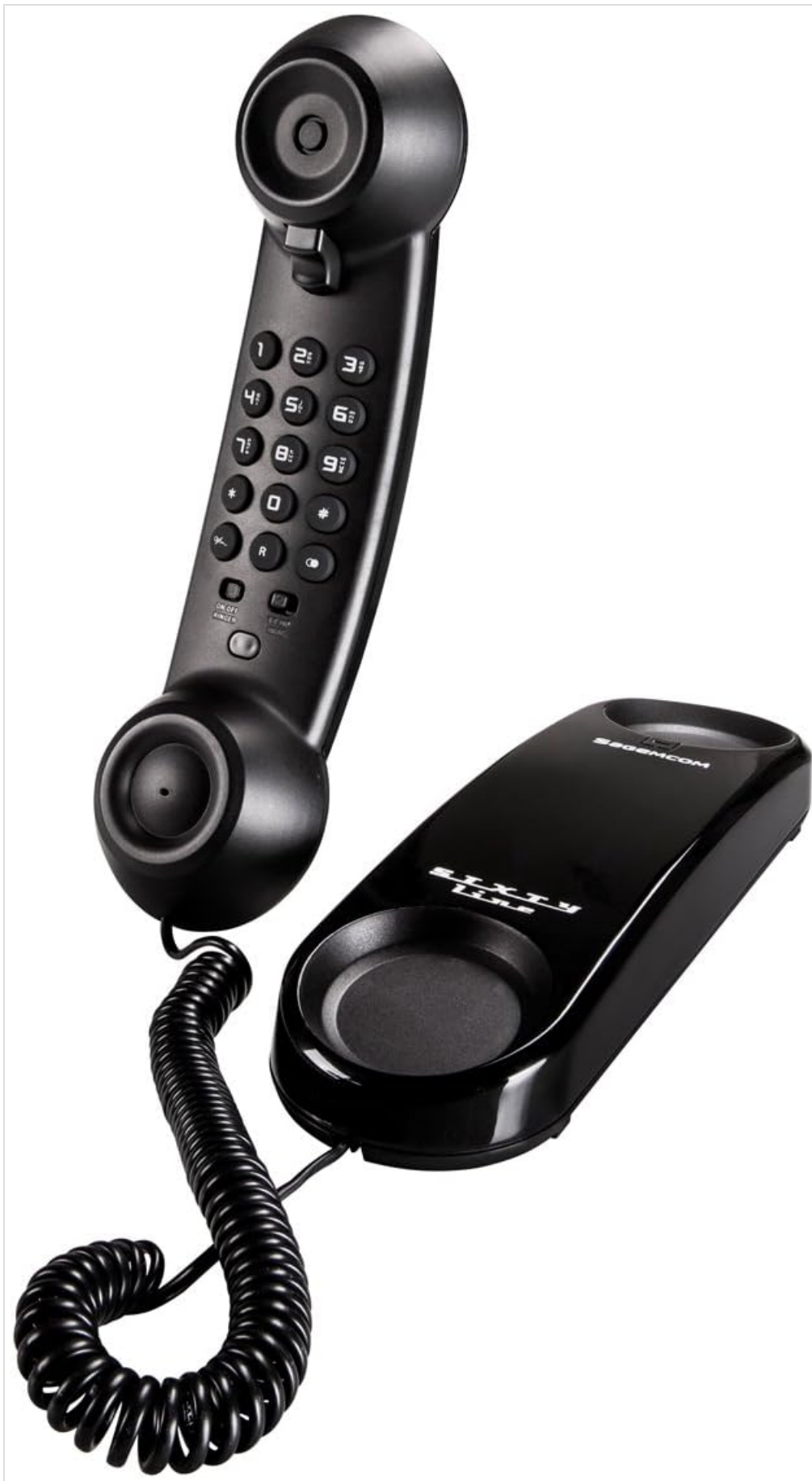
Image: The Sagemcom Sixty corded phone, showing the black handset with a numeric keypad and function buttons, connected by a coiled cord to its sleek black base unit. The base unit features a cradle for the handset and the 'Sixty Line' branding.