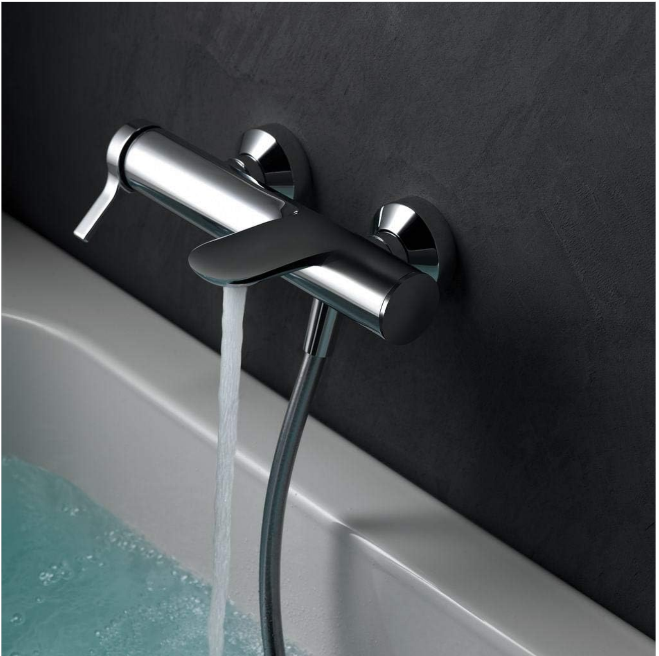
Figure 3: Alternative view of the Ideal Standard Melange A4272AA mixer. This image provides another perspective of the product, showcasing its design and the single lever control.