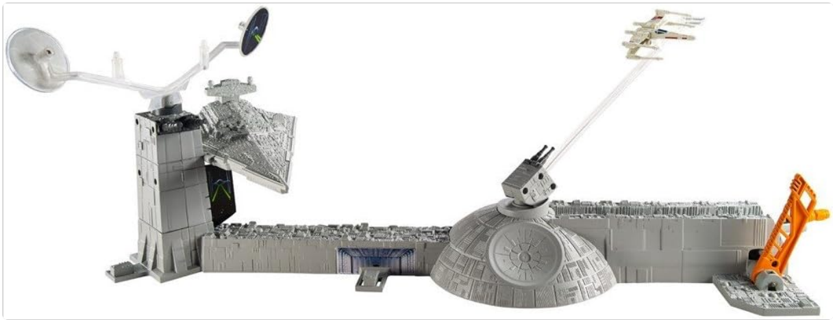
Figure 1: Overview of the fully assembled Galactic Battle Play Set.

This image displays the complete play set, featuring the Imperial Star Destroyer section, the Death Star-themed turret, and the X-Wing Fighter launch mechanism, ready for action.