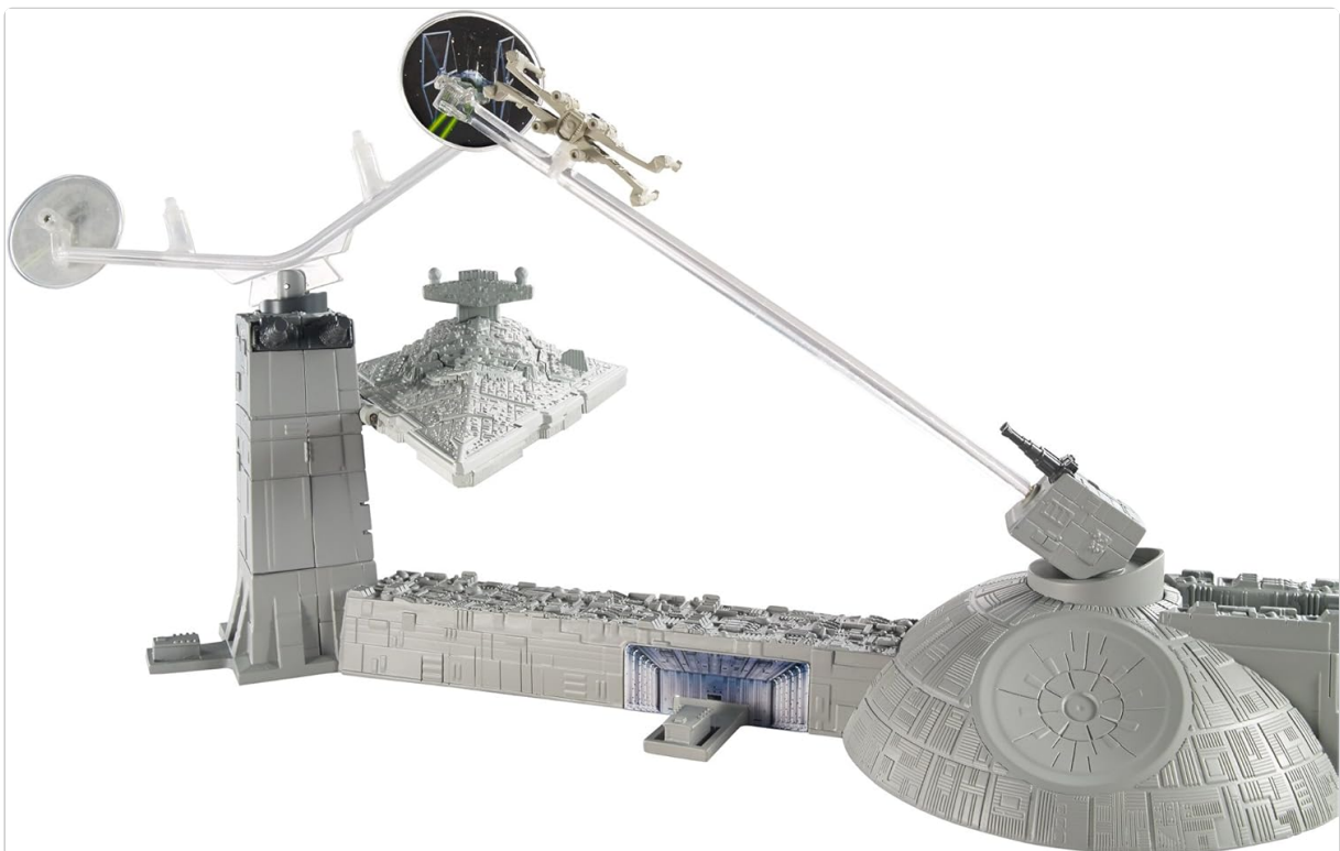
Figure 4: X-Wing Fighter on the launch track, aiming at distant targets.

This image illustrates the Hot Wheels X-Wing Fighter in motion, targeting the vulnerable sections of the Imperial Star Destroyer, which appears to be breaking apart.