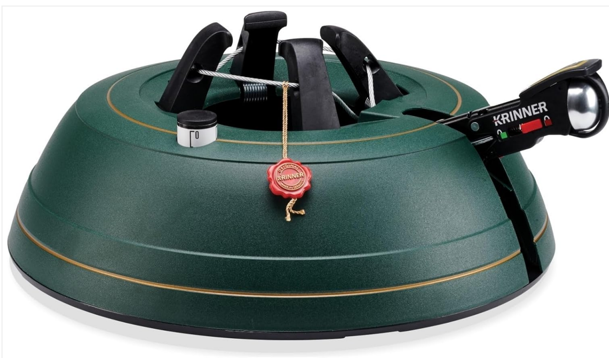
Figure 1: Krinner Christmas Tree Genie M