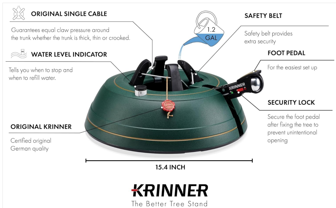
Figure 4: Water reservoir with visible water level indicator.