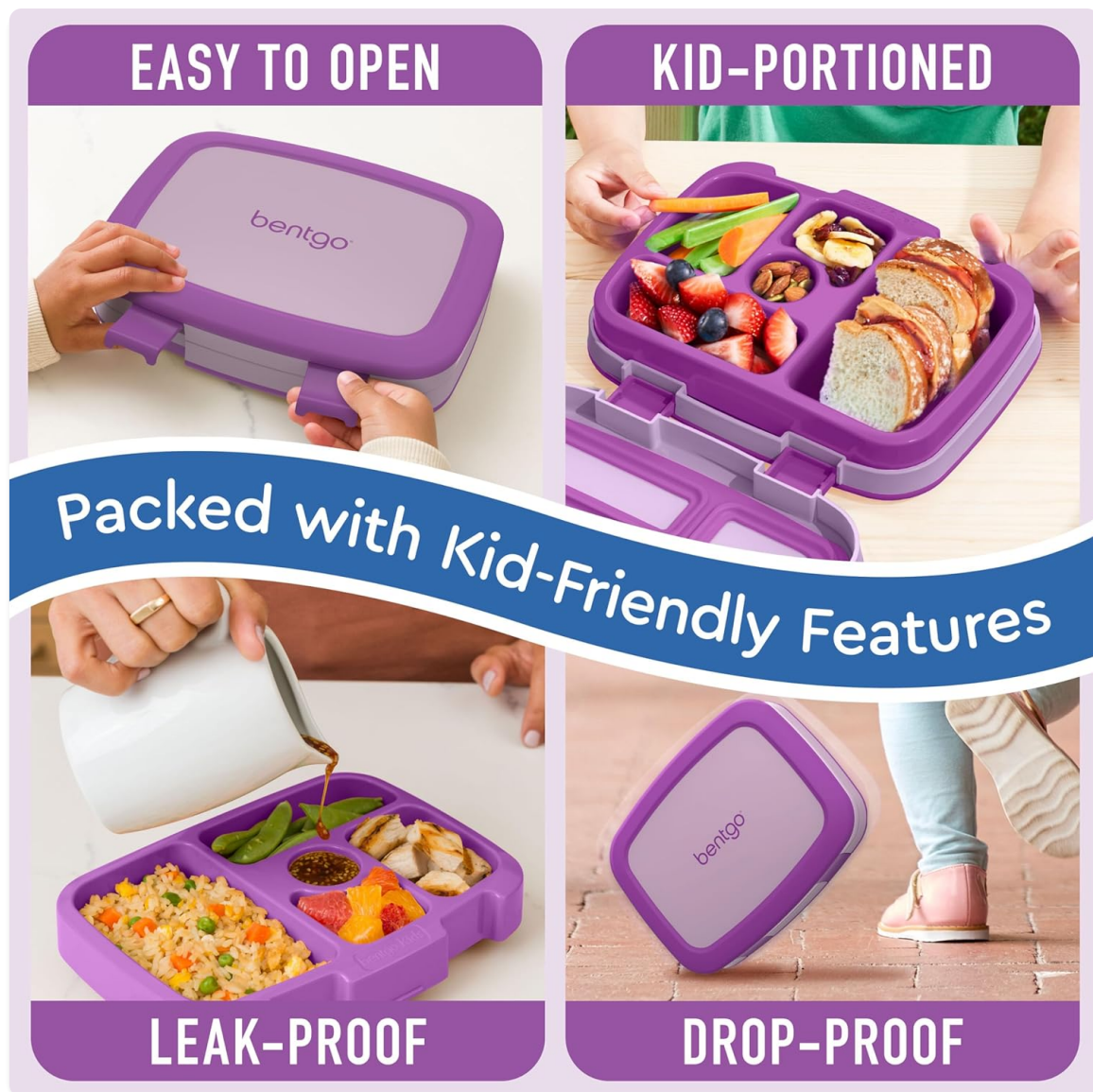
Image: A collage showcasing four key features of the Bentgo Kids Lunch Box: 'Easy to Open' latches, 'Kid-Portioned' compartments with food, 'Leak-Proof' design with liquid, and 'Drop-Proof' construction.