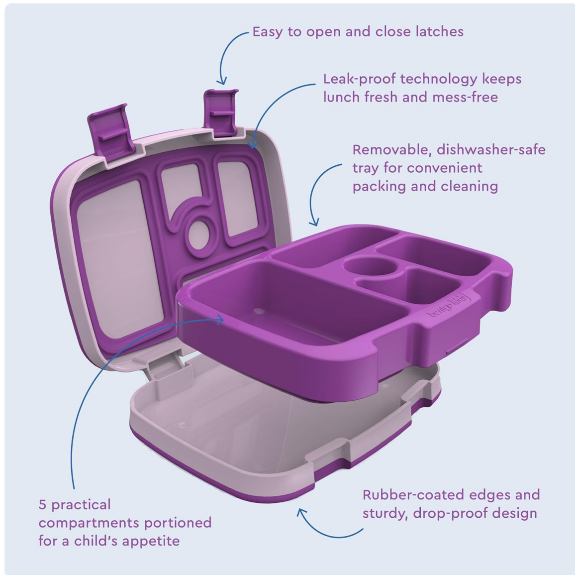
Image: An open Bentgo Kids Lunch Box in purple and white, with arrows pointing to its key features: easy-to-open latches, leak-proof technology, removable dishwasher-safe tray, 5 practical compartments, and rubber-coated edges for drop-proof design.

The Bentgo Kids lunch box has five compartments designed for ideal portion sizes for children aged 3-7. The largest compartment is suitable for a half sandwich or main dish, while smaller compartments are perfect for fruits, vegetables, snacks, and dips. The unique contoured lid with a silicone seal ensures that food in each compartment stays fresh and does not leak into other sections.