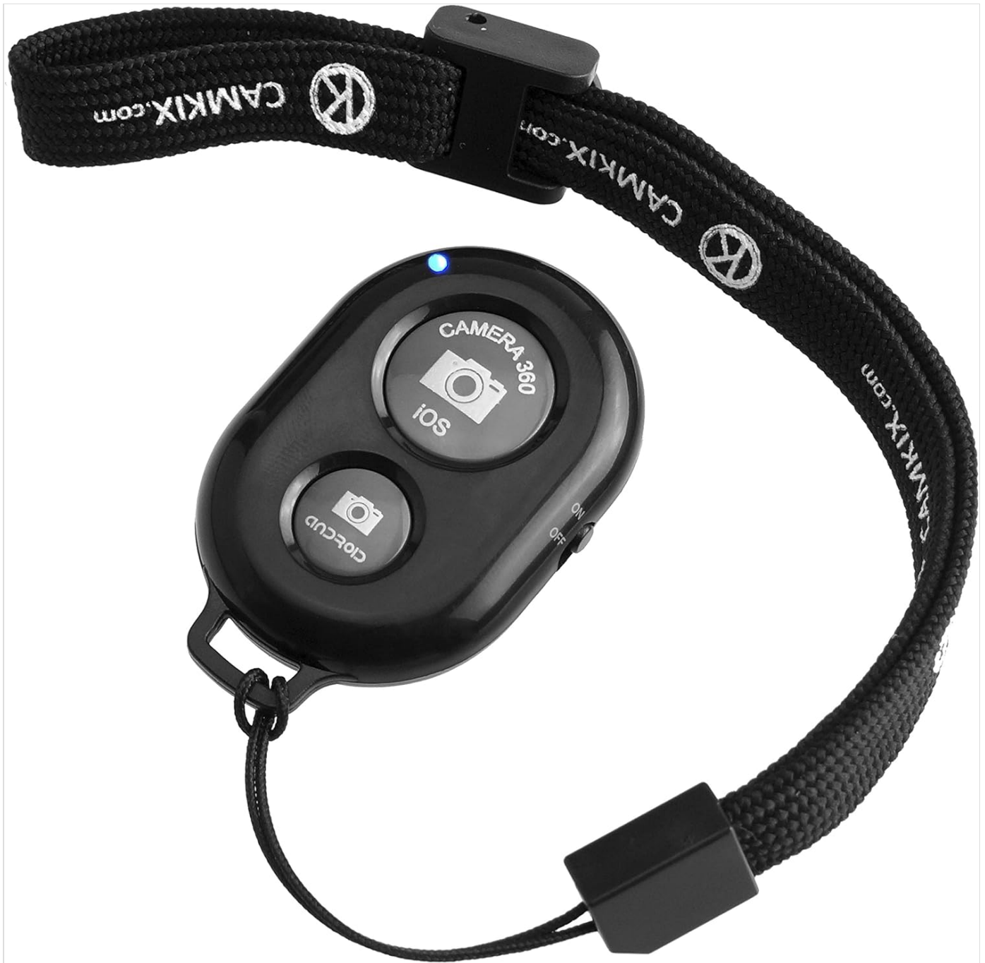
Figure 3.1: CamKix Bluetooth Camera Shutter Remote Control with included wrist strap.

The remote is designed for portability, easily fitting into a pocket or attaching to a keychain for quick access.