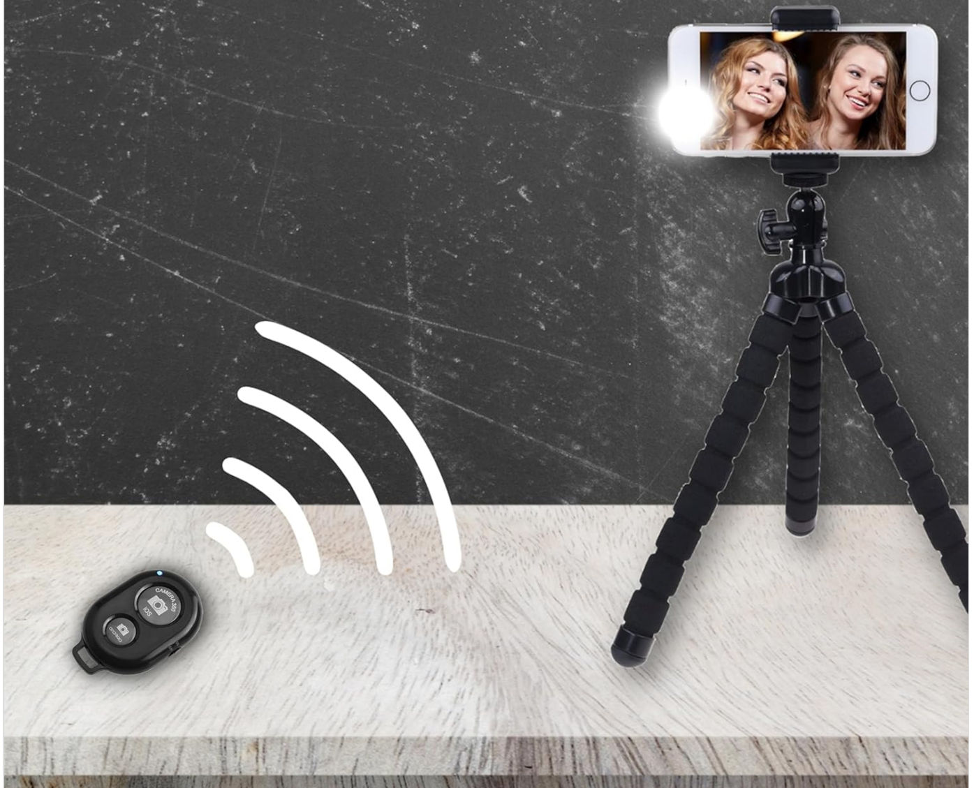
Figure 5.1: The remote operates effectively up to 10 meters distance from the paired device.