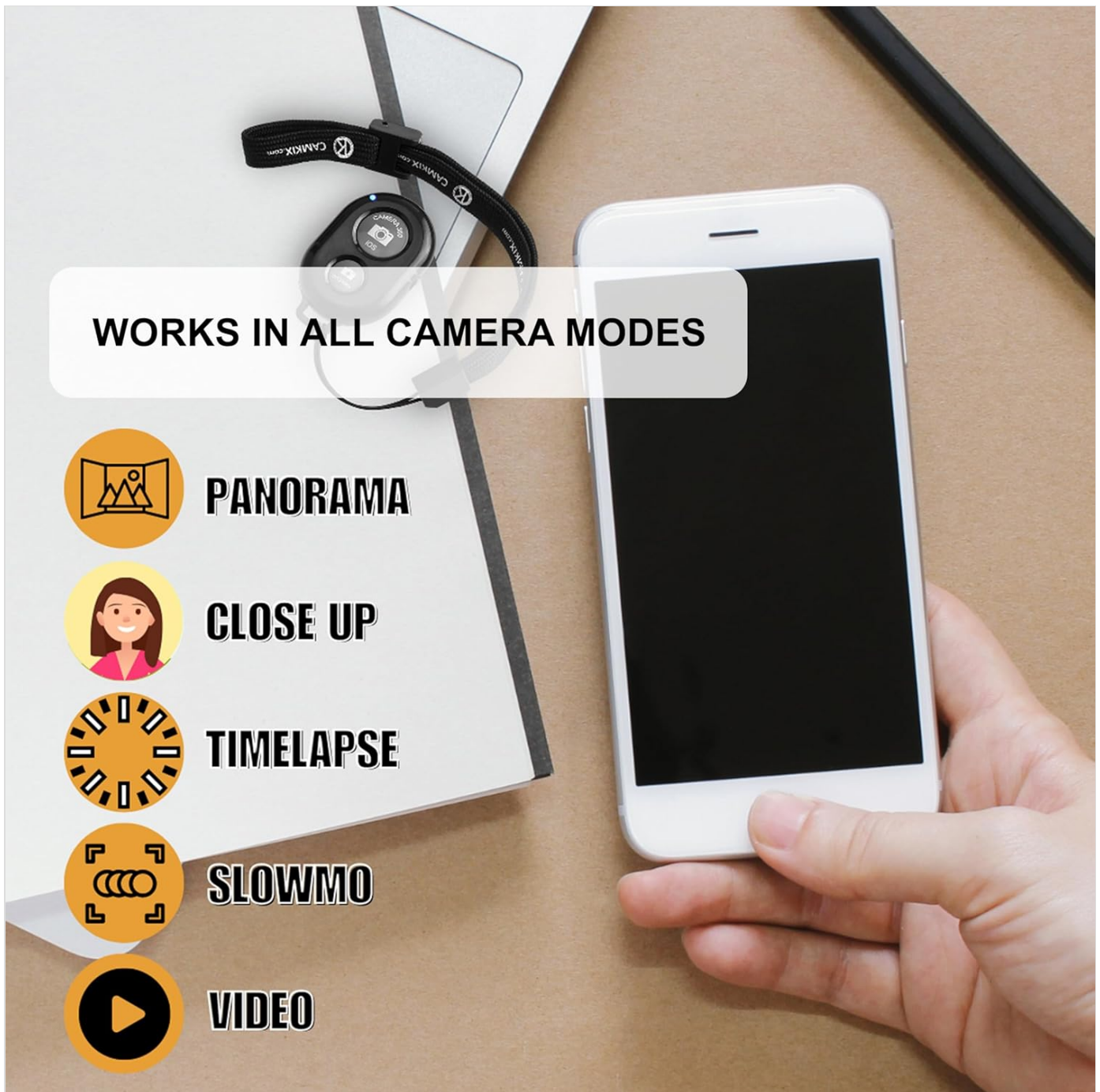
Figure 5.3: The remote supports various camera modes including Panorama, Close Up, Timelapse, Slow Motion, and Video.