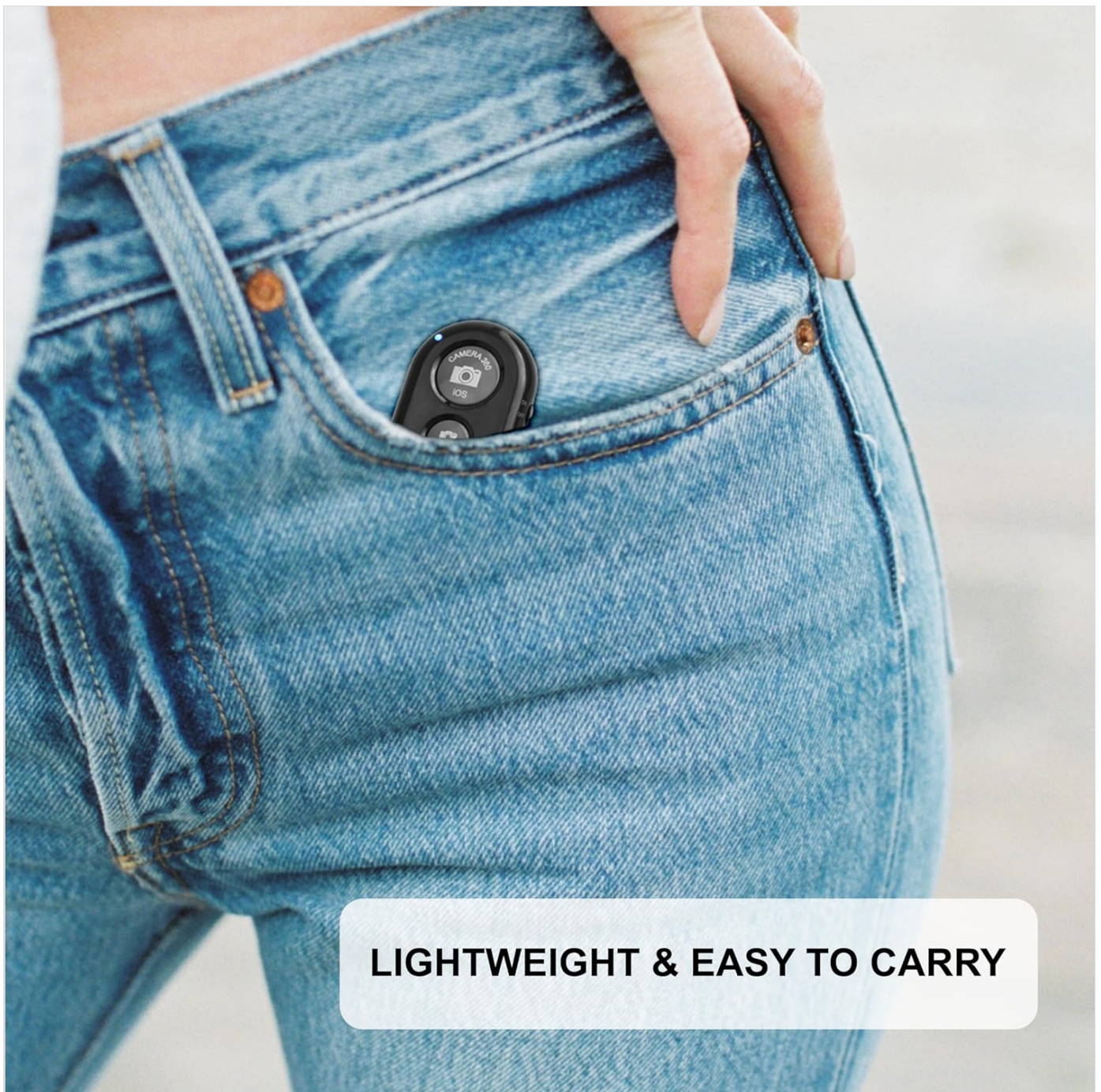
Figure 3.2: The compact design allows for easy portability in a pocket.