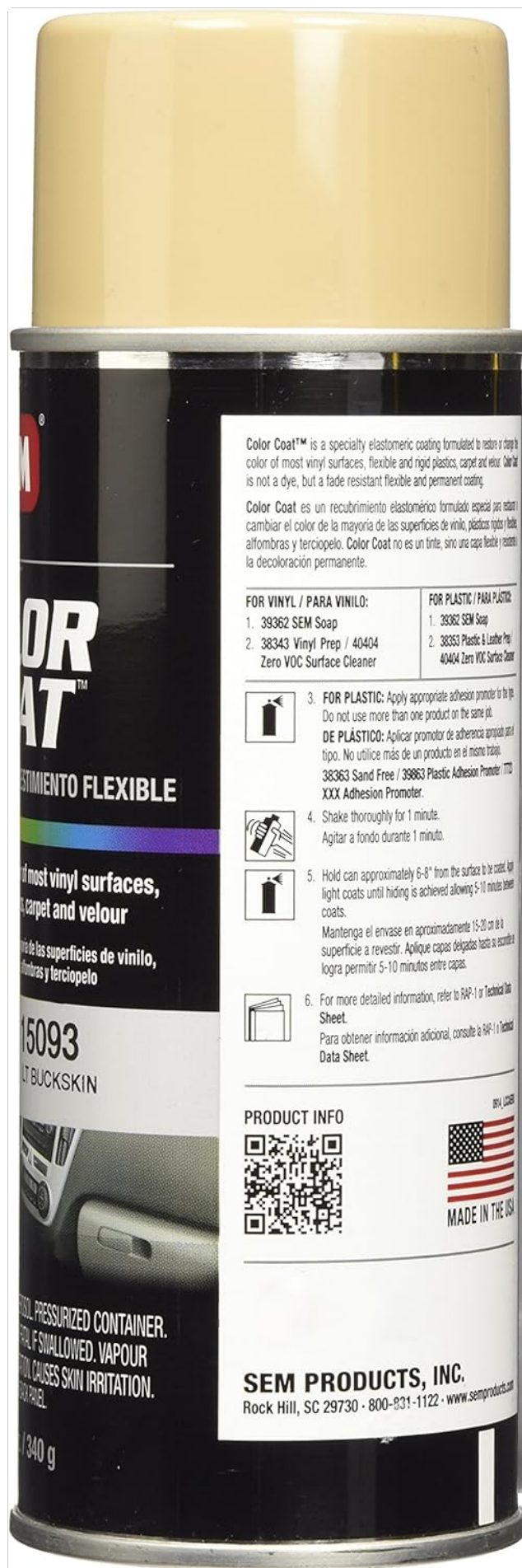
Back of the can detailing preparation steps for vinyl and plastic surfaces.