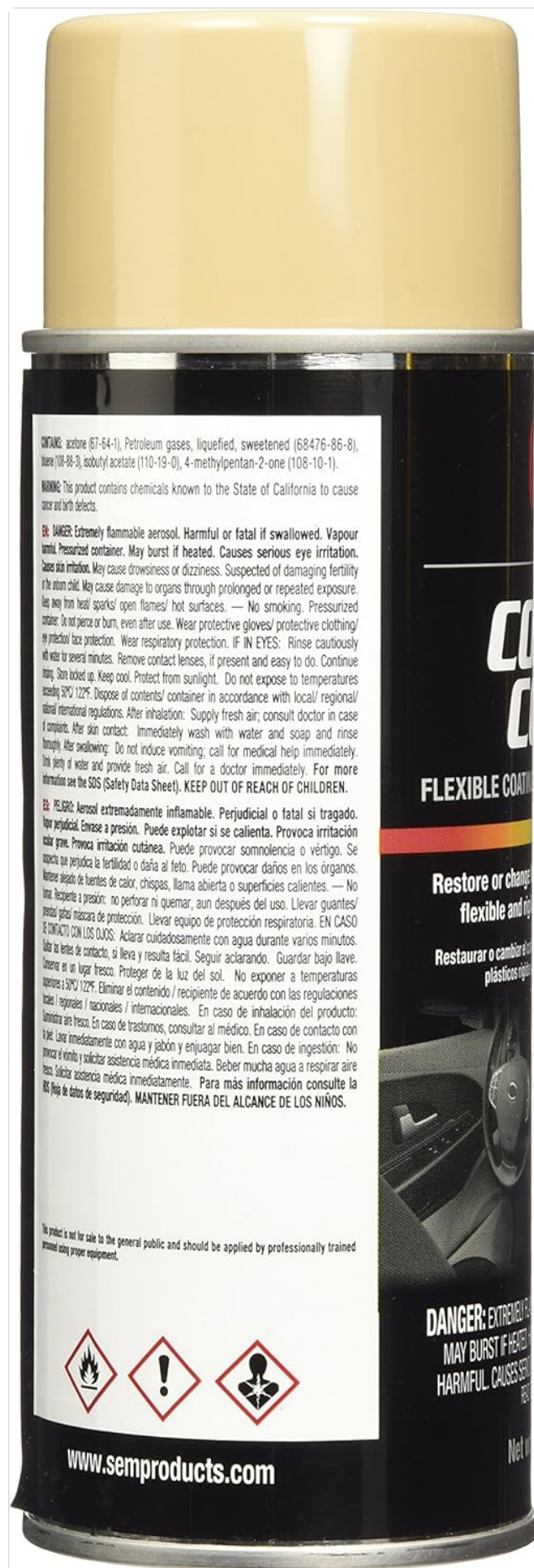
Side of the can displaying comprehensive safety warnings and precautions.