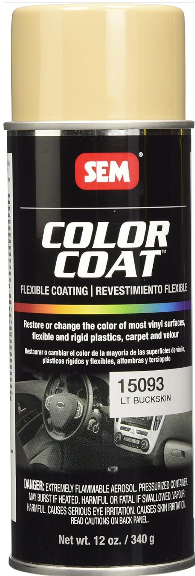
Front view of the SEM Color Coat Light Buckskin aerosol can.