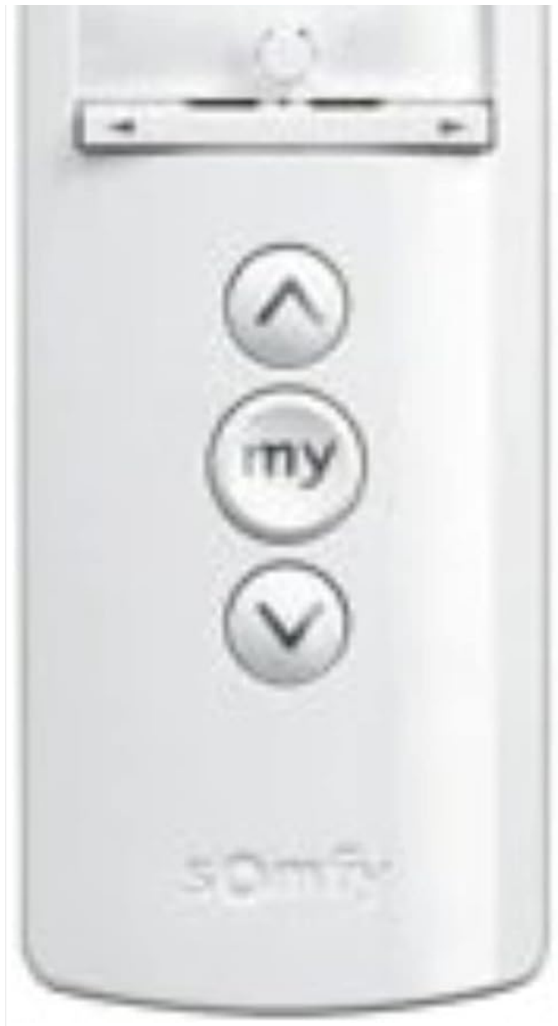
Image 1.1: Front view of the Somfy Telis 1 Chronis RTS Pure Remote, showing the display and control buttons.