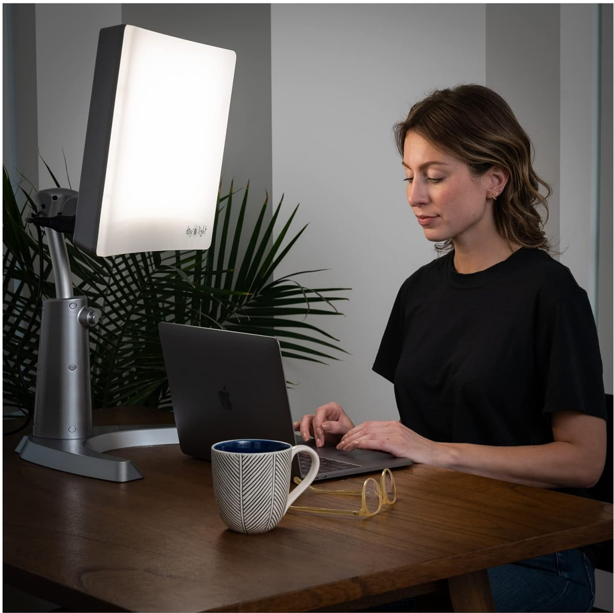
Figure 4: A person using the Carex Day-Light Classic Plus lamp at a desk while working on a laptop, demonstrating typical usage and positioning.