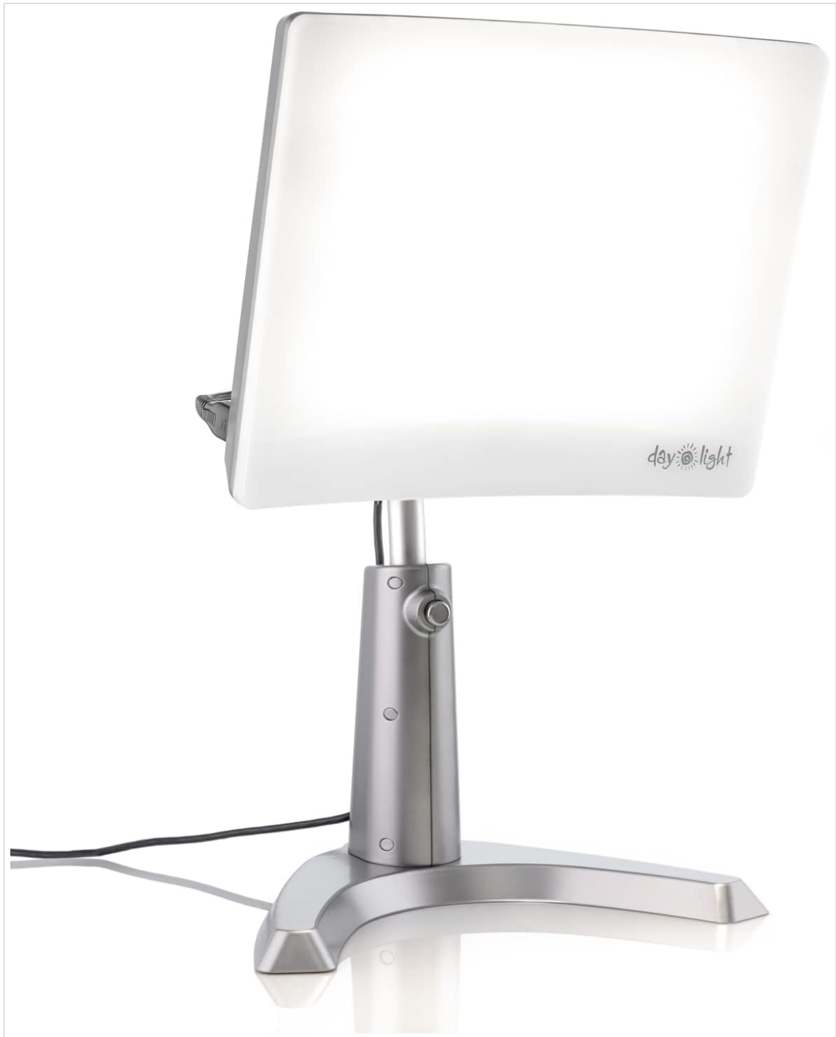
Figure 2: Front view of the Carex Day-Light Classic Plus Sunlight Therapy Lamp, ready for use.