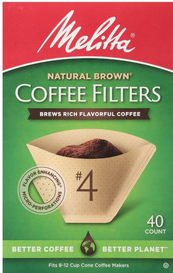
Image: Front view of the Melitta #4 Natural Brown Coffee Filters box, showing the filter and branding.