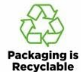
Image: Graphic highlighting Melitta's commitment to sustainability, featuring FSC and BPI certifications, and indicating 100% recycled paperboard packaging.