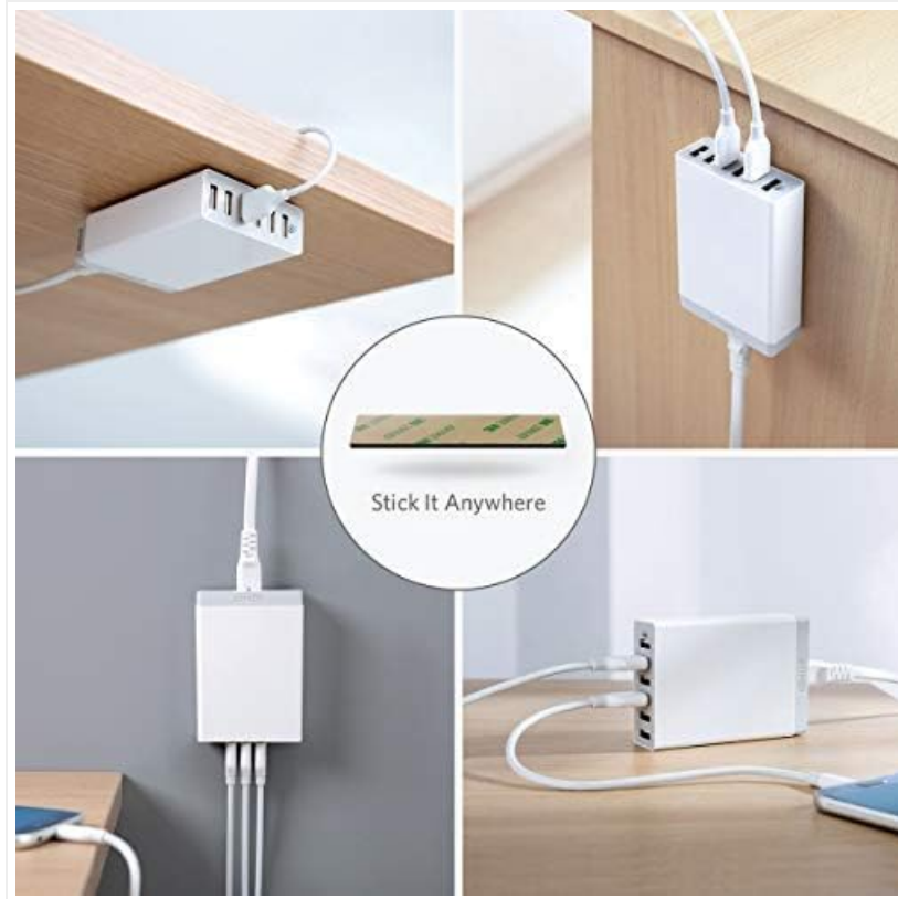
Image: The Anker PowerPort 6 shown mounted in different positions (under a desk, on a wall, on a desk surface) with an inset showing an adhesive strip, illustrating flexible placement options.