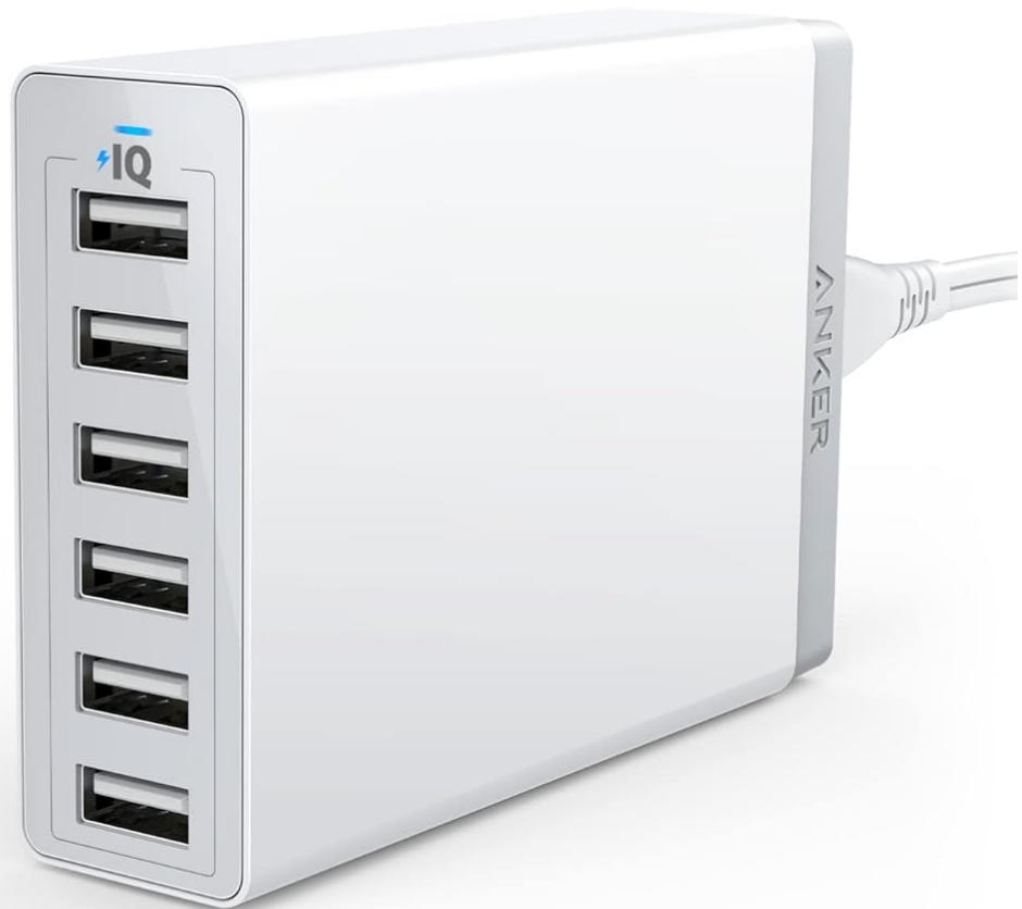
Image: Front view of the Anker PowerPort 6 charging hub, showing six USB ports and the Anker logo.