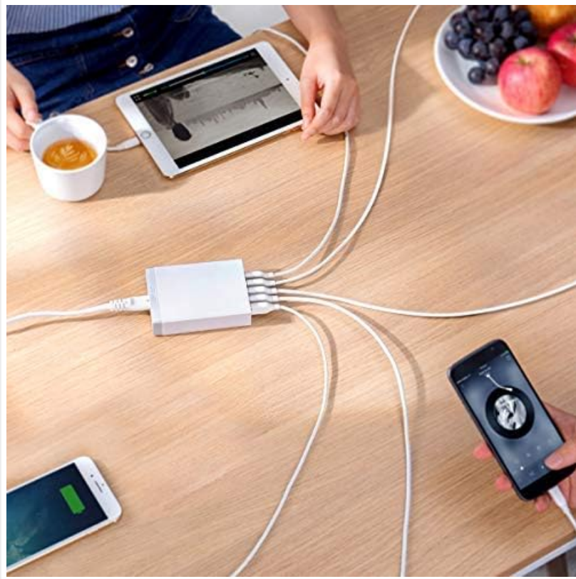
Image: The Anker PowerPort 6 positioned on a wooden table, actively charging several electronic devices including smartphones and a tablet, demonstrating its multi-device capability.