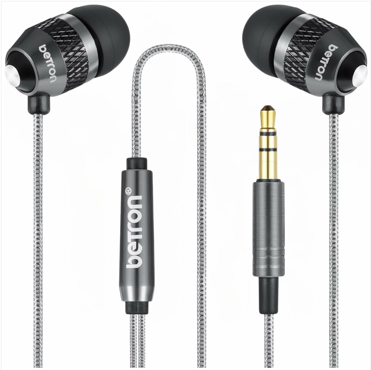
Figure 1: Betron B25 In-Ear Wired Headphones.