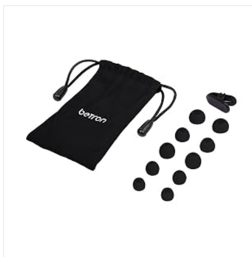
Figure 6: A complete view of all accessories provided with the Betron B25 earphones.