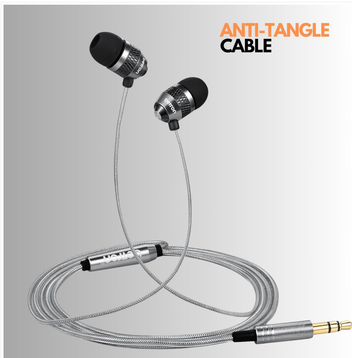
Figure 11: The anti-tangle cable design of the Betron B25 earphones.

and avoid excessive pulling or snagging.