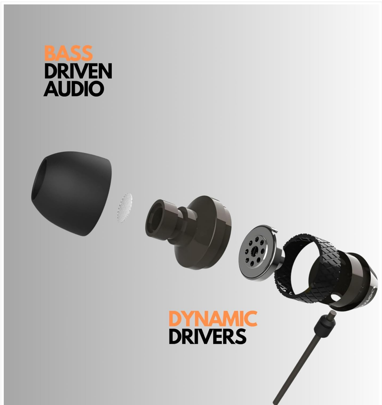
Figure 4: The lightweight aluminum body of the Betron B25 earphones.