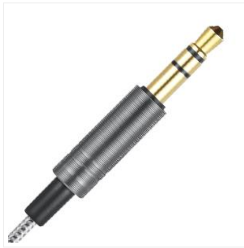
Figure 8: Close-up of the gold-plated 3.5mm headphone jack for optimal connection.