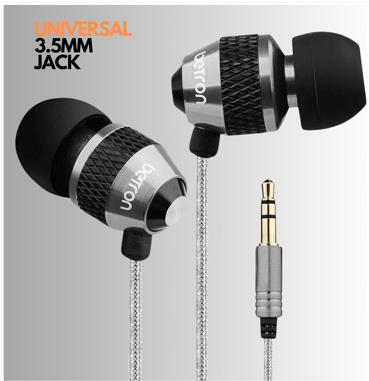
Figure 7: The universal 3.5mm audio jack for connecting the earphones to various devices.