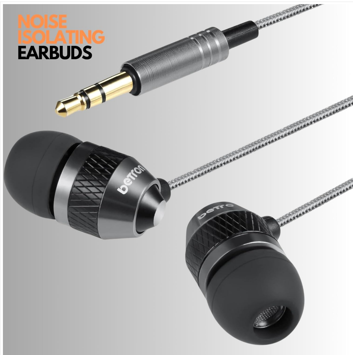
Figure 2: Close-up of Betron B25 earbuds highlighting noise isolation design.