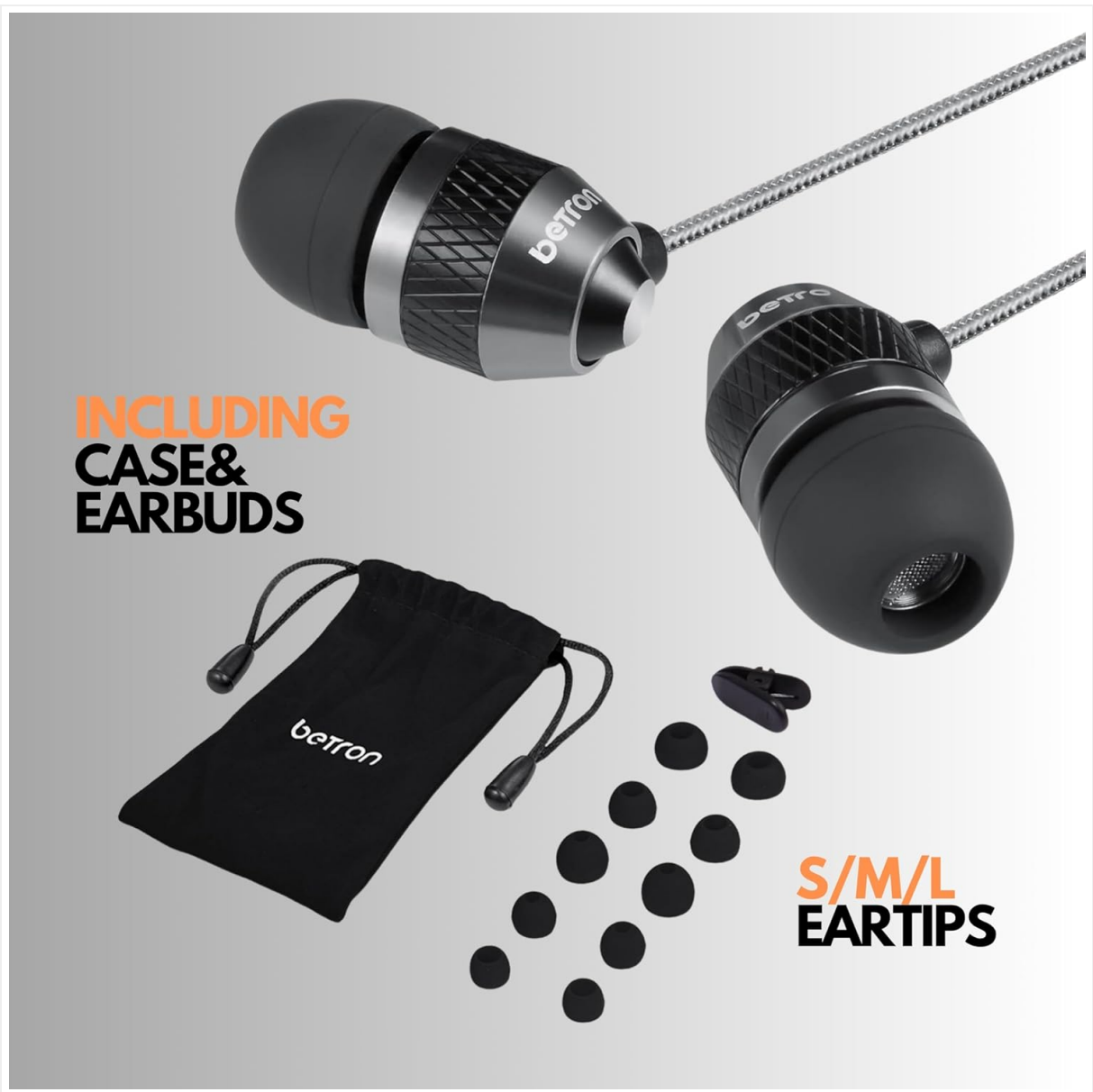
Figure 5: The Betron B25 earphones, protective carry case, and various earbud tips included in the package.