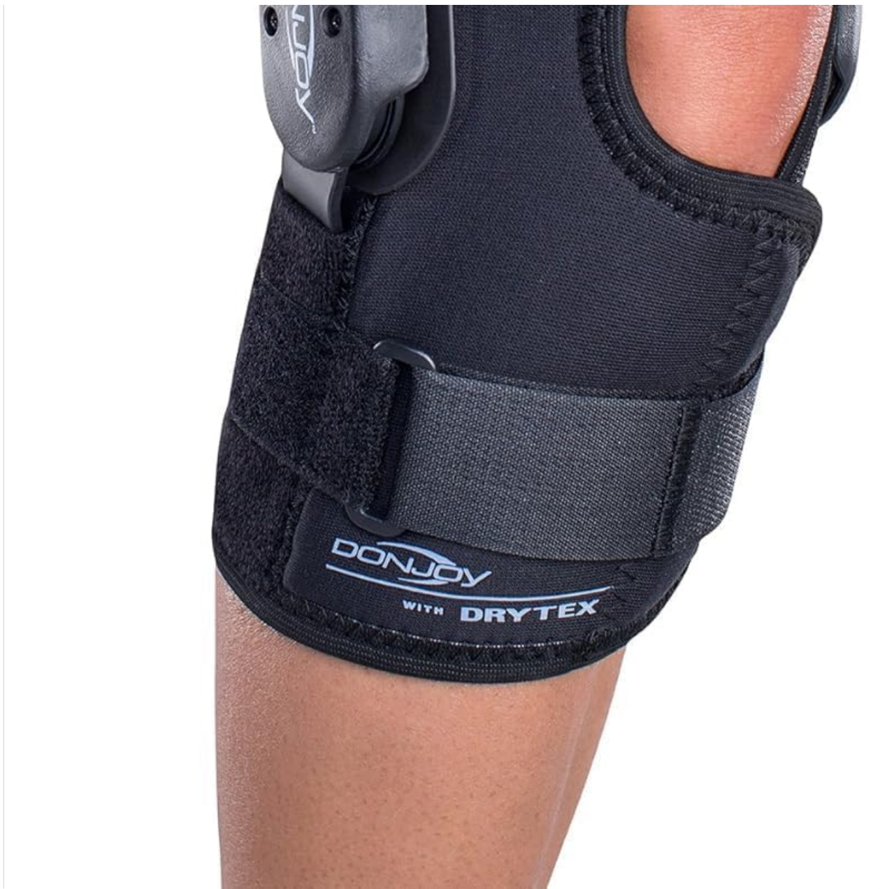
Figure 1: Front view of the DonJoy Drytex Hinged Air Knee Brace.