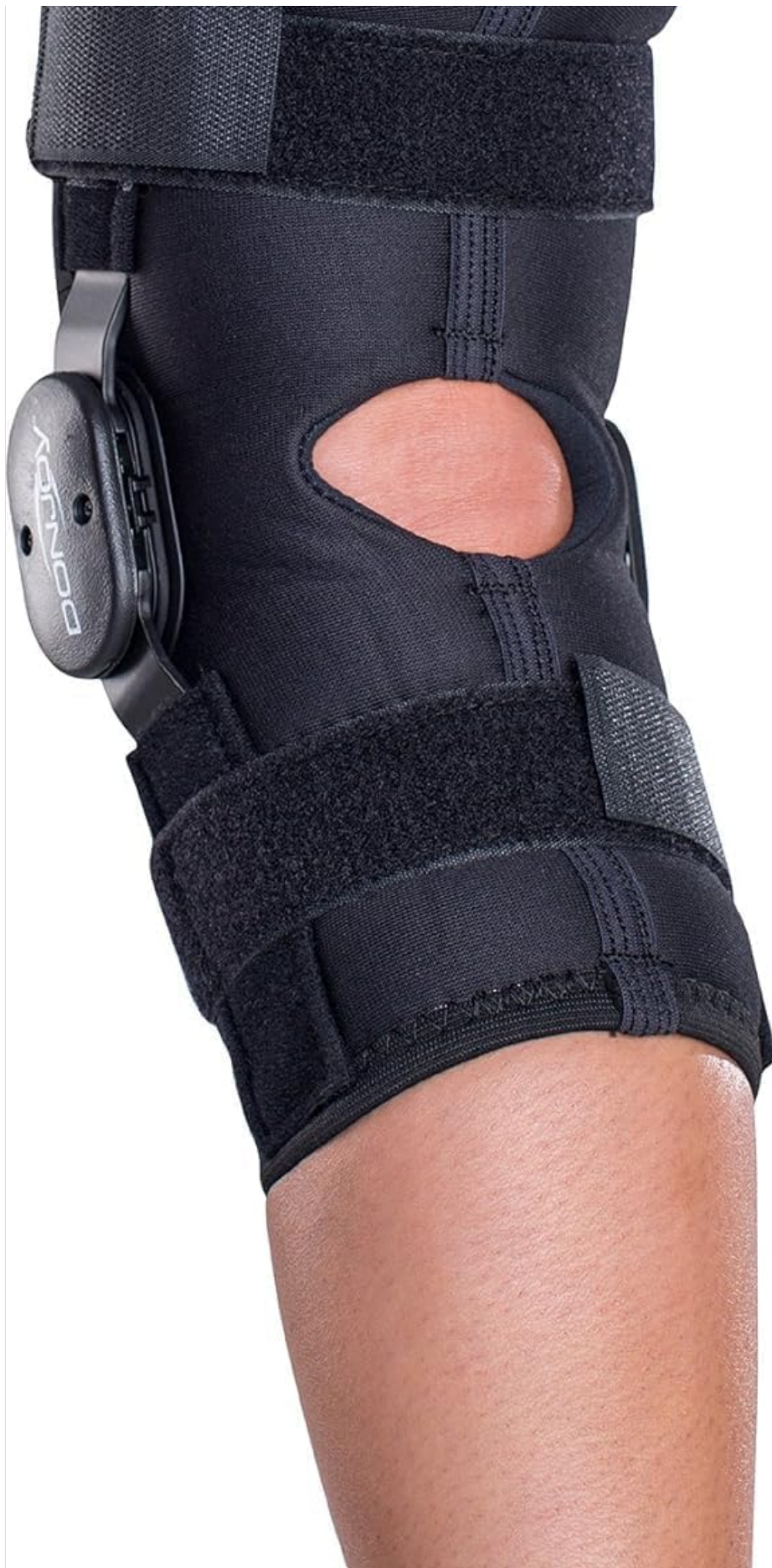
Figure 3: Side view of the DonJoy Drytex Hinged Air Knee Brace, highlighting the bilateral hinges and strap system.