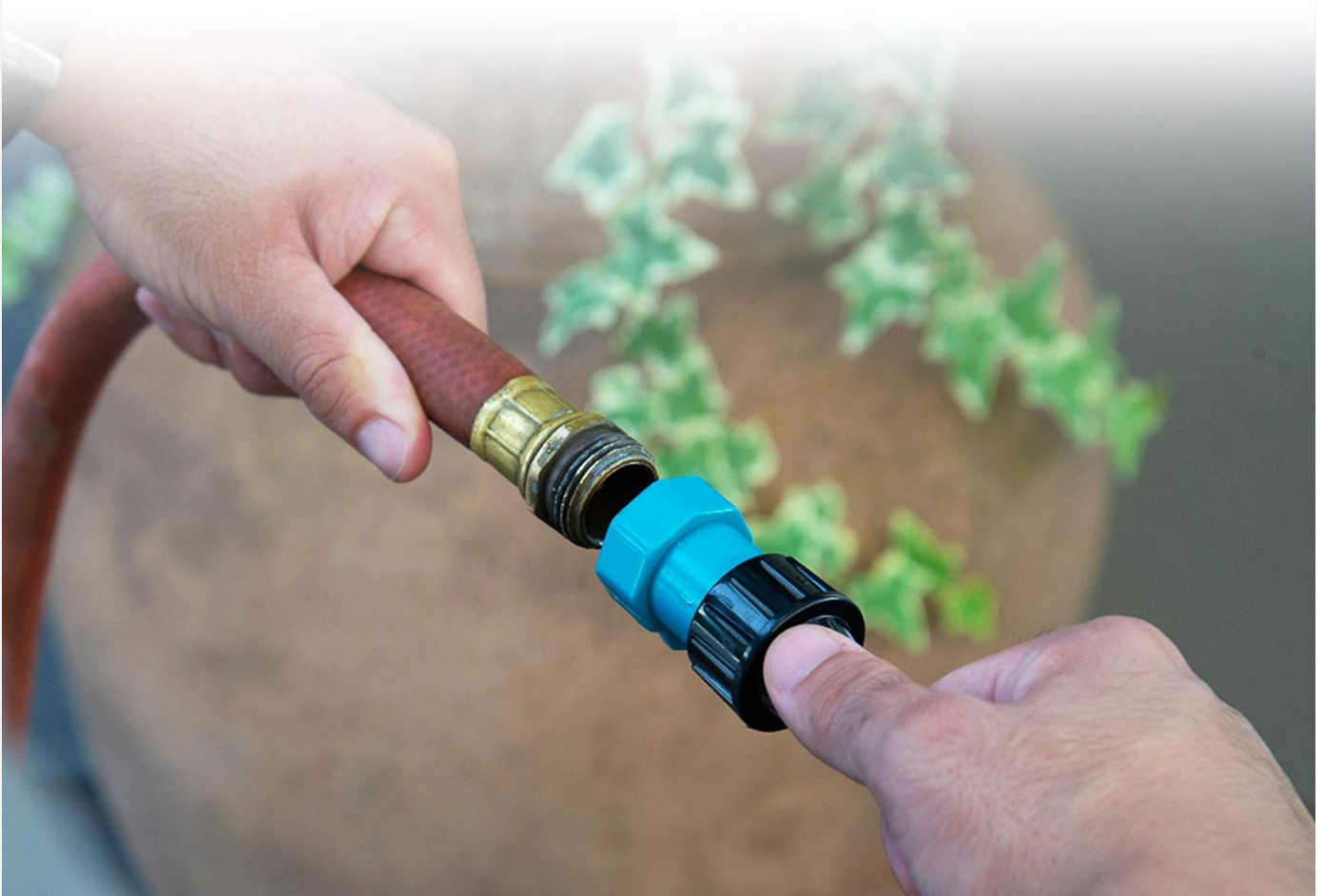
Figure 3: Connecting the fan to a standard garden hose.