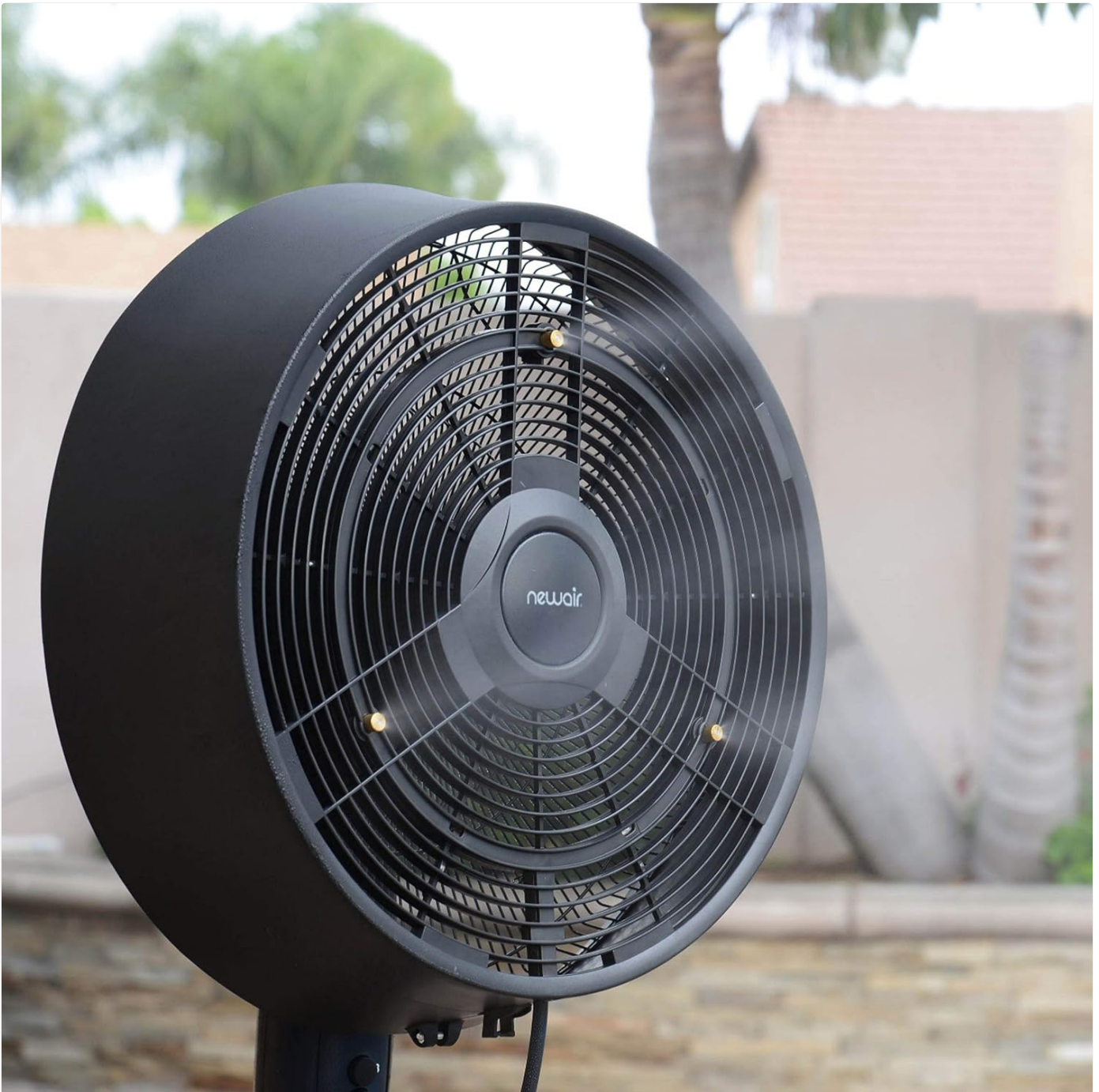
Figure 6: The fan in operation, demonstrating the misting function.