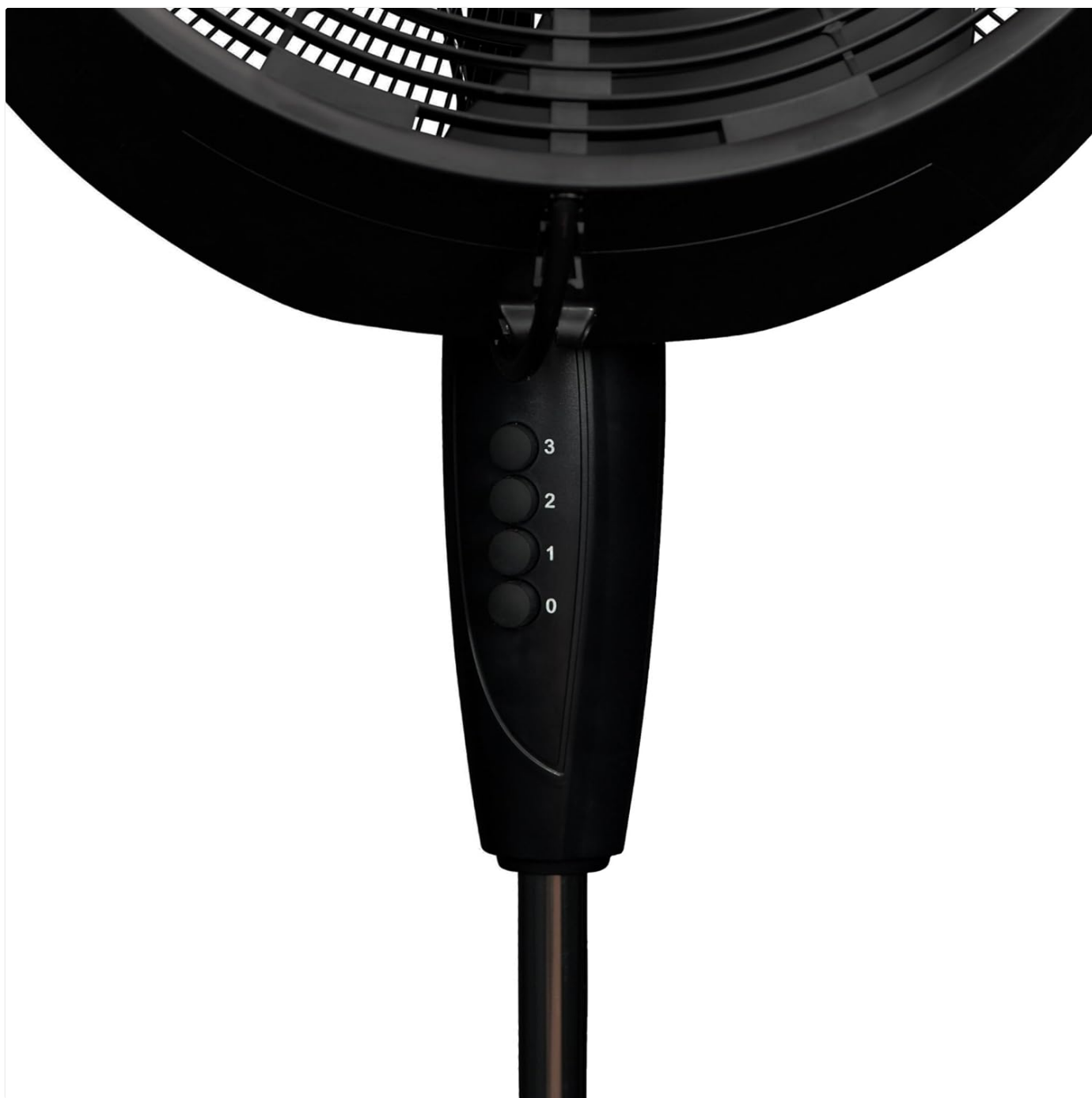
Figure 4: Control panel with fan speed settings.

Your NewAir AF-520B fan offers both fan-only and misting functions.