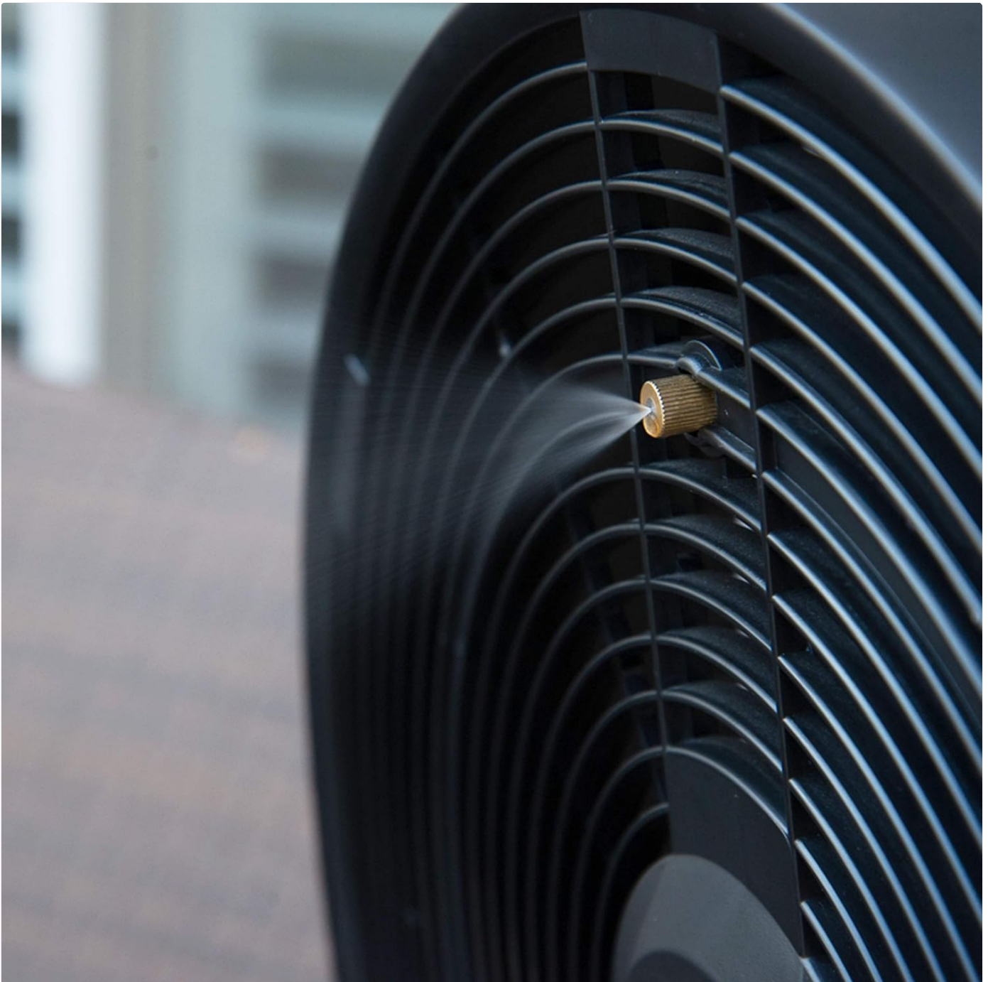
Figure 7: Detail of a misting nozzle.