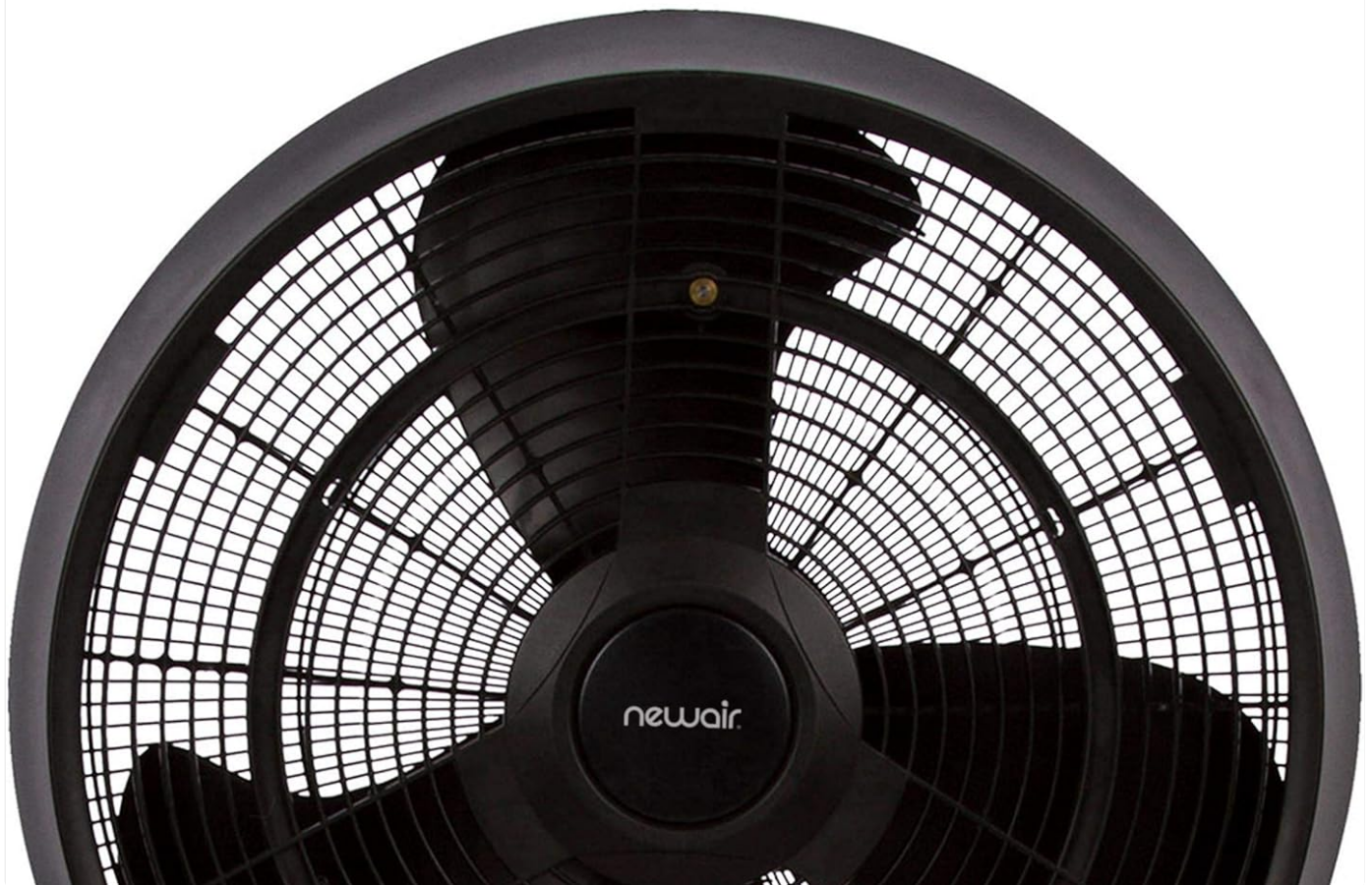
Figure 5: Key features of the NewAir AF-520B fan.