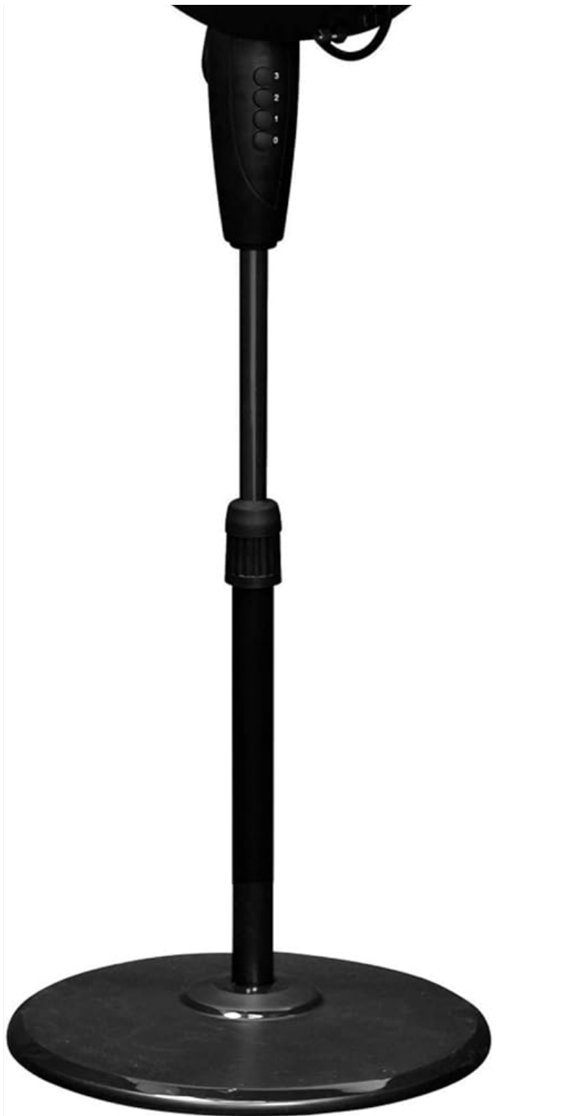
Figure 1: NewAir AF-520B Outdoor Misting Oscillating Pedestal Fan.