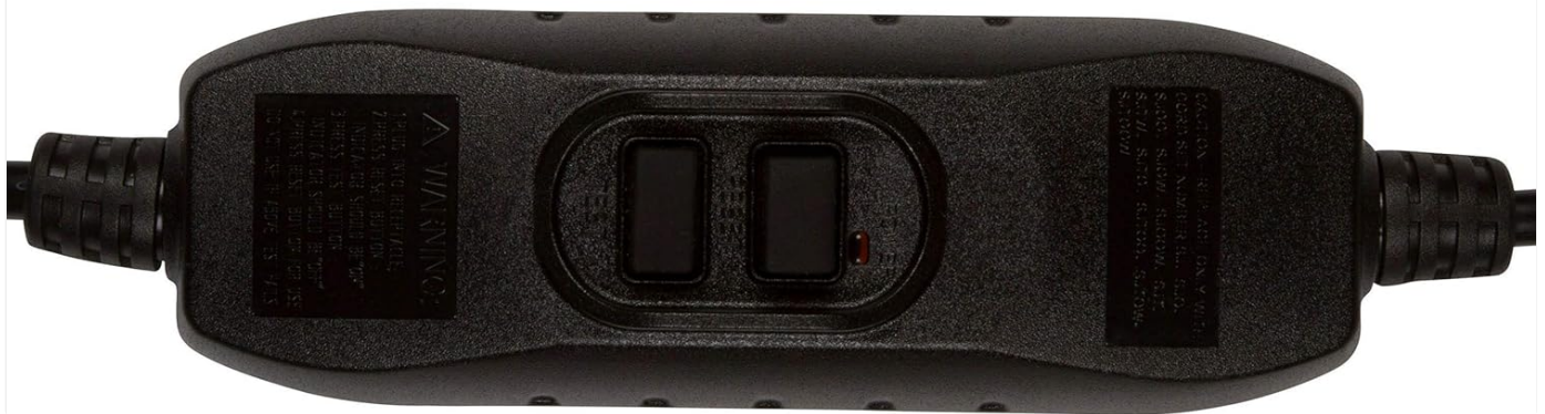
Figure 2: The fan's built-in GFCI plug for safety.

A built-in GFCI plug adds an extra level of safety to protect you from accidents.