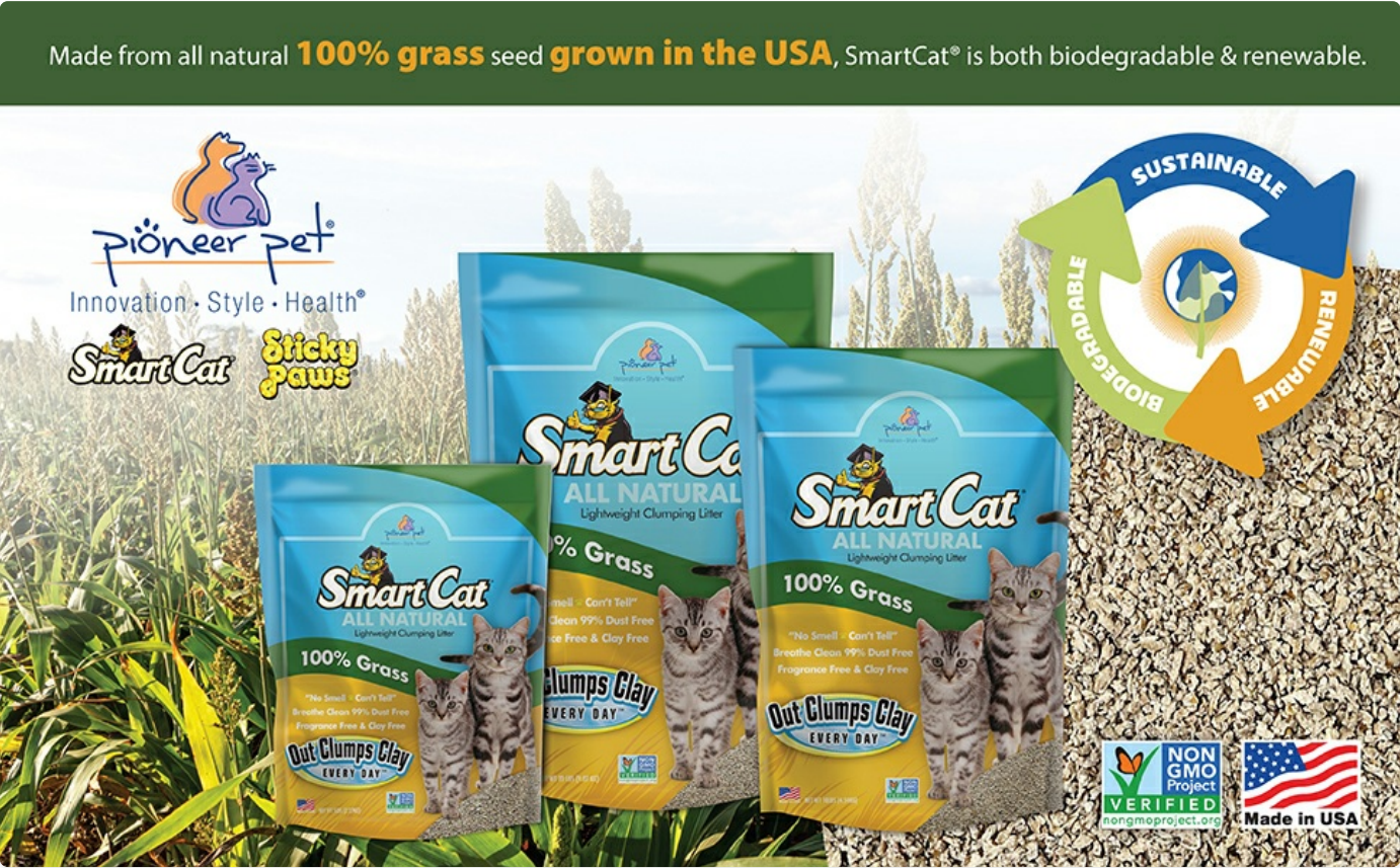
Image: A visual representation of the "Made From Grass" claim, showing a field of grass, SmartCat litter, and icons for biodegradable, renewable, and sustainable.