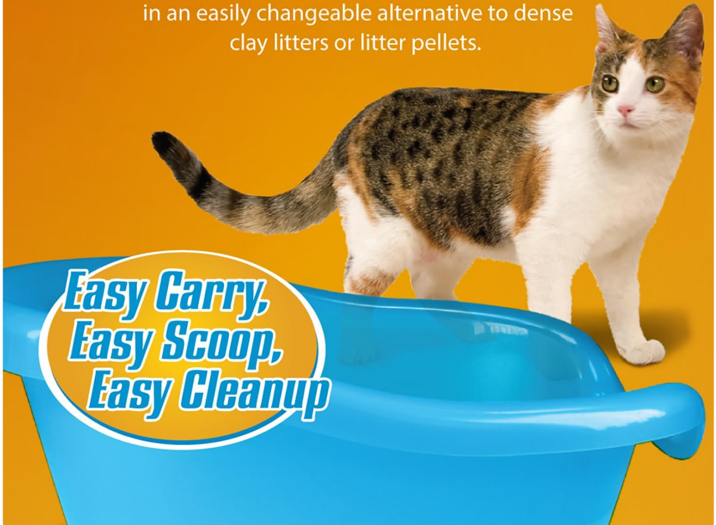
Image: A cat standing next to a blue litter box, with text highlighting "Lightweight Clumping" and "Easy Carry, Easy Scoop, Easy Cleanup."

Excellent clumping capability (that does not stick to the pan) ensures that your pet's waste stays out of both sight & smell, in an easily changeable alternative to dense clay litters or litter pellets.