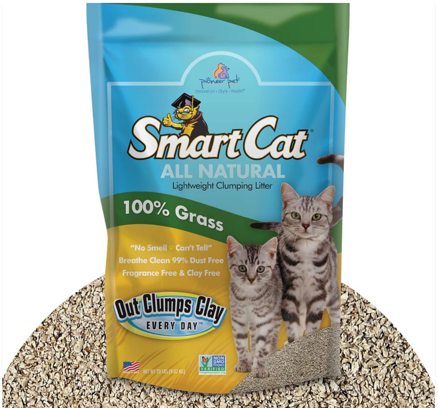
Image: Front view of the SmartCat All Natural Clumping Cat Litter 20-Pound bag, showing the product name, "100% Grass" label, and two cats.