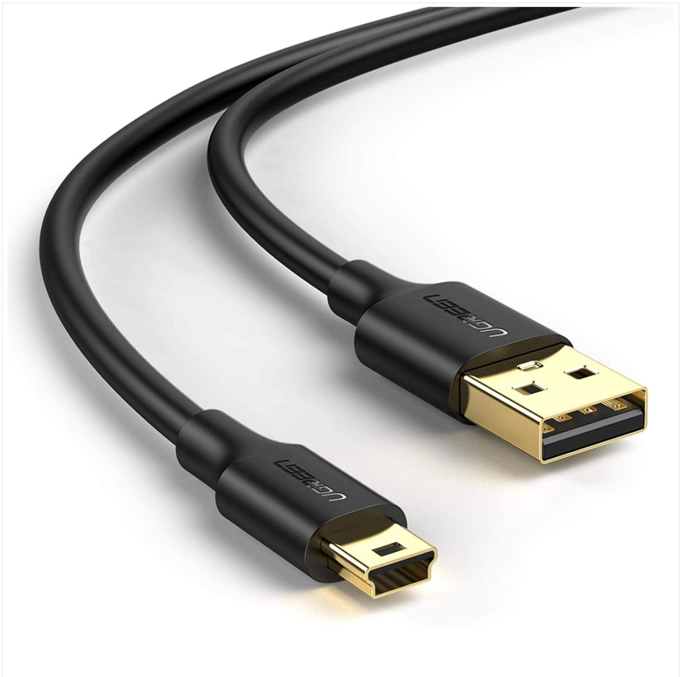
Figure 1.1: The UGREEN Mini USB Cable, featuring a standard USB-A connector on one end and a Mini USB-B connector on the other.