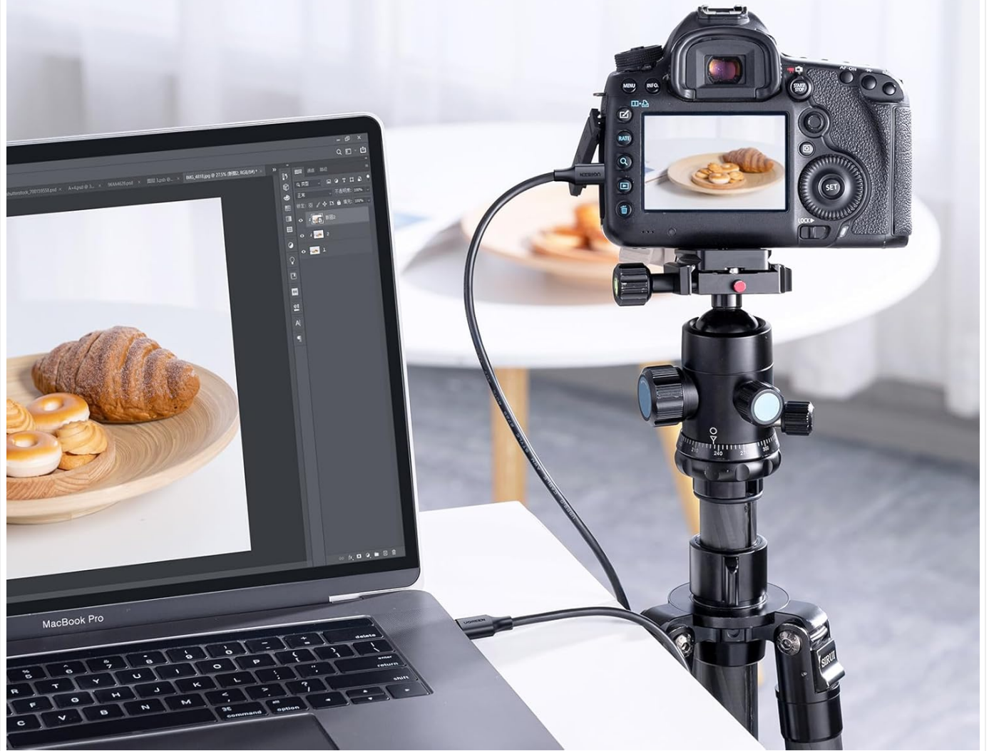
Figure 5.1: A digital camera connected to a laptop via the UGREEN Mini USB Cable, demonstrating efficient photo transfer.