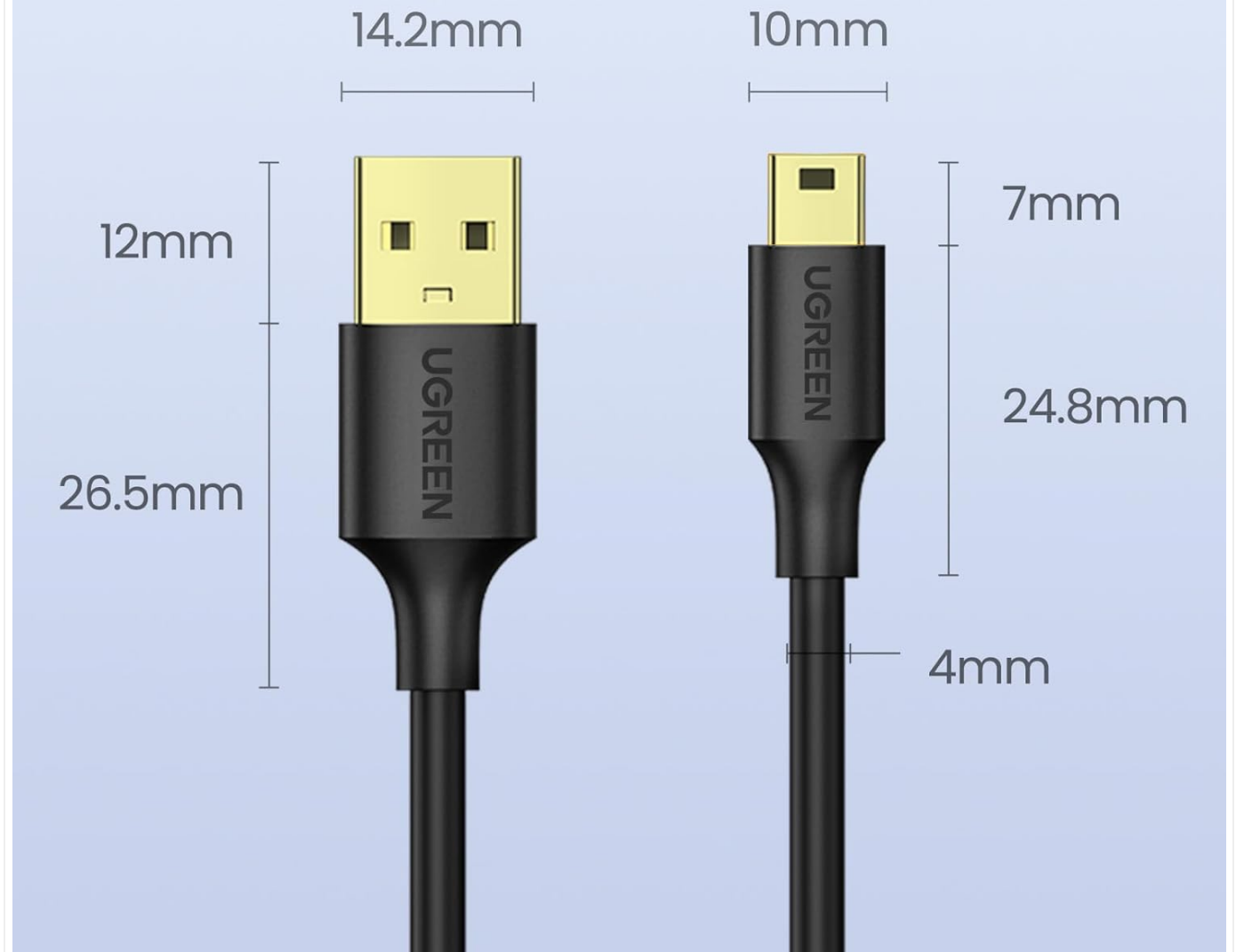
Figure 8.1: A diagram illustrating the dimensions of both the USB-A and Mini USB-B connectors of the UGREEN cable.