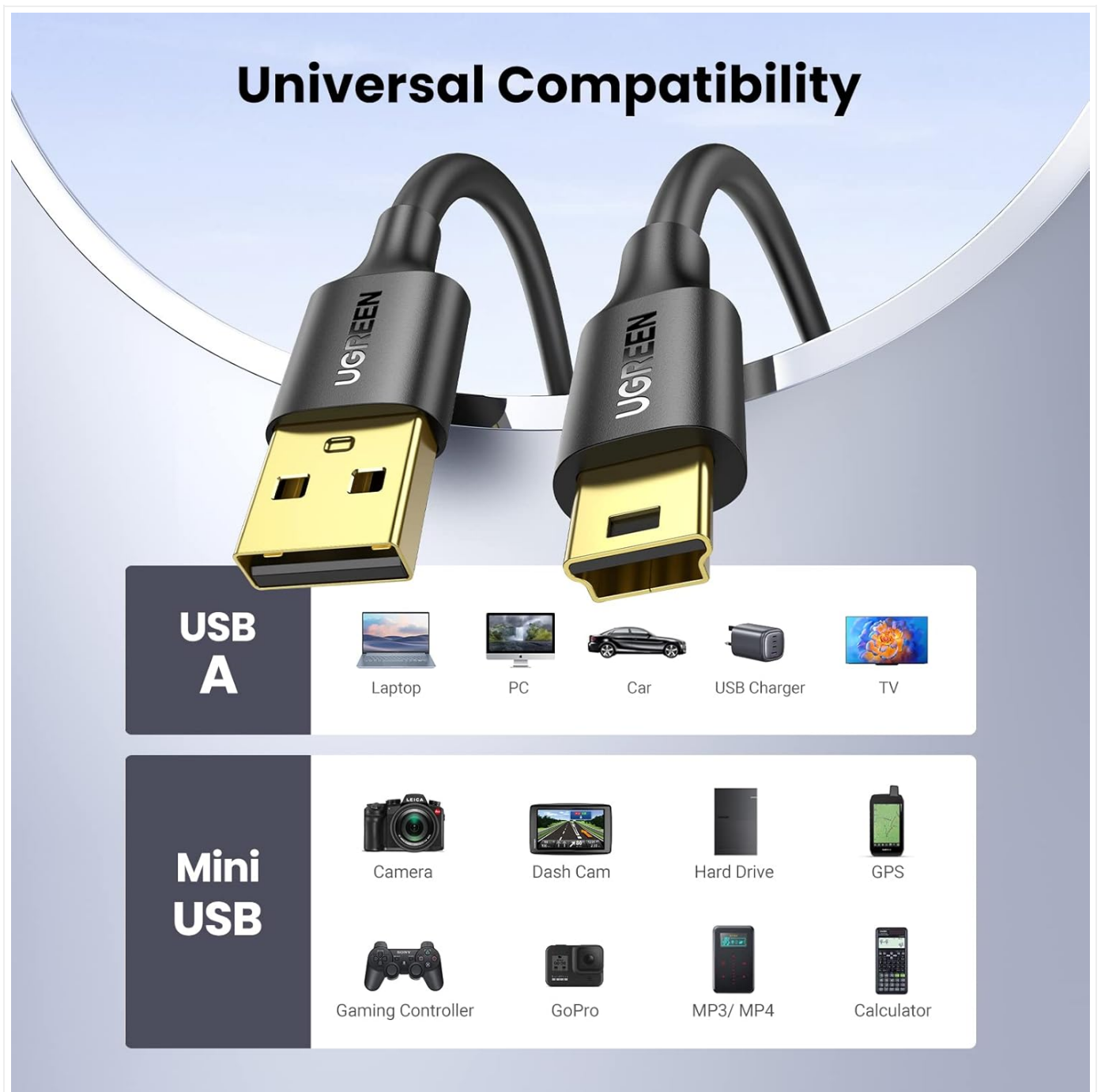
Figure 3.1: A visual representation of the universal compatibility of the UGREEN Mini USB Cable, showing various devices that can connect via USB-A (laptops, PCs, car chargers, TVs) and Mini USB (cameras, dash cams, hard drives, GPS, gaming controllers, GoPro, MP3/MP4 players, calculators).