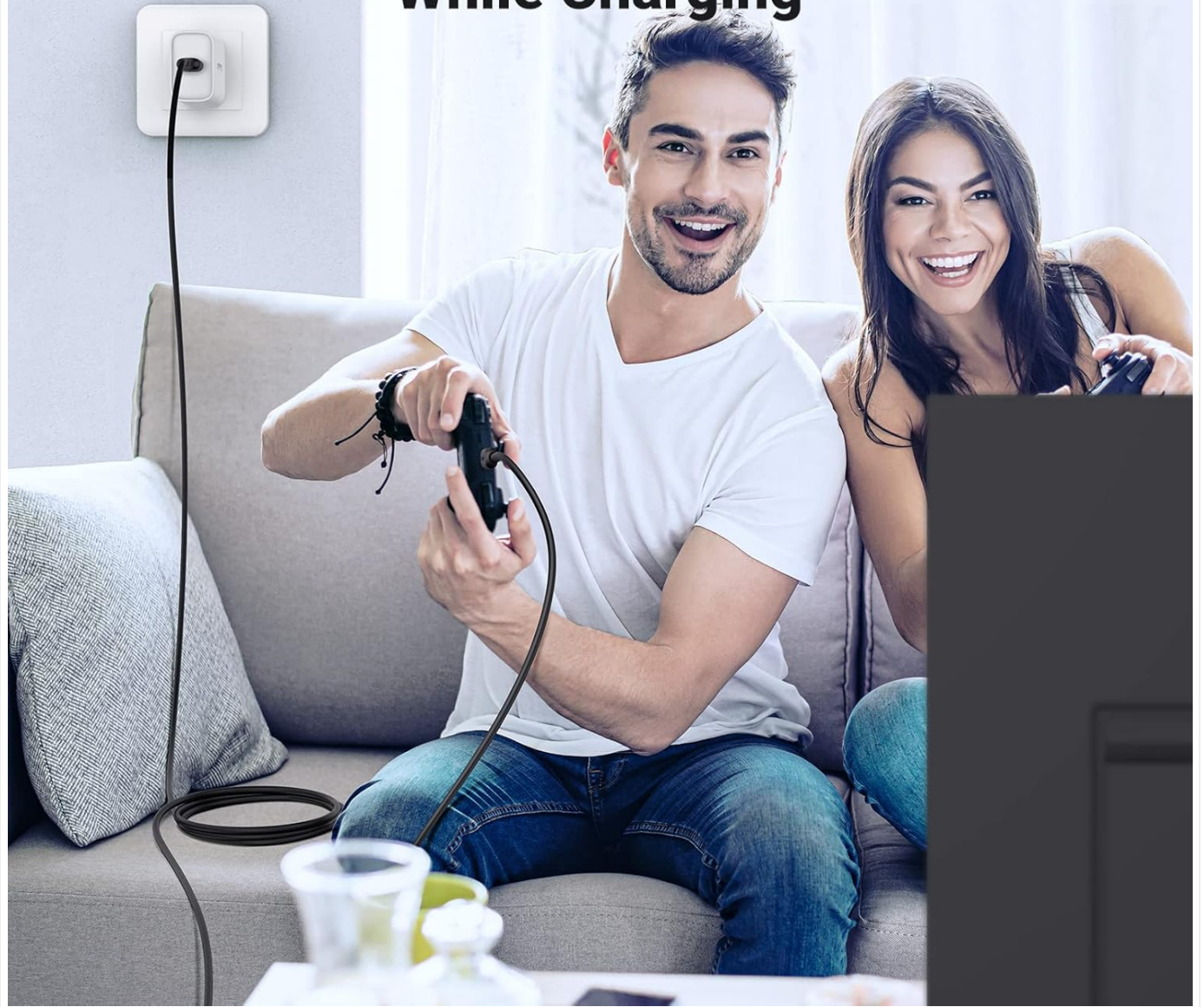
Figure 5.3: Two individuals enjoying a video game, with one of their controllers connected to a power source via the UGREEN Mini USB Cable for charging during gameplay.