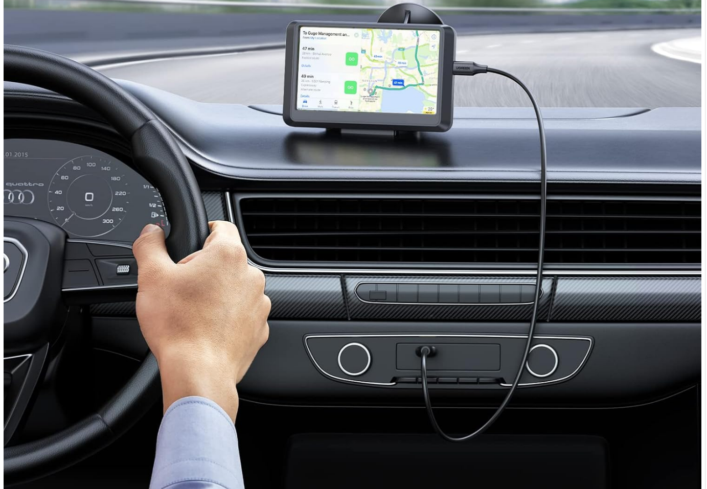
Figure 5.2: A GPS device mounted in a car dashboard, being charged via the UGREEN Mini USB Cable, ensuring continuous power during navigation.