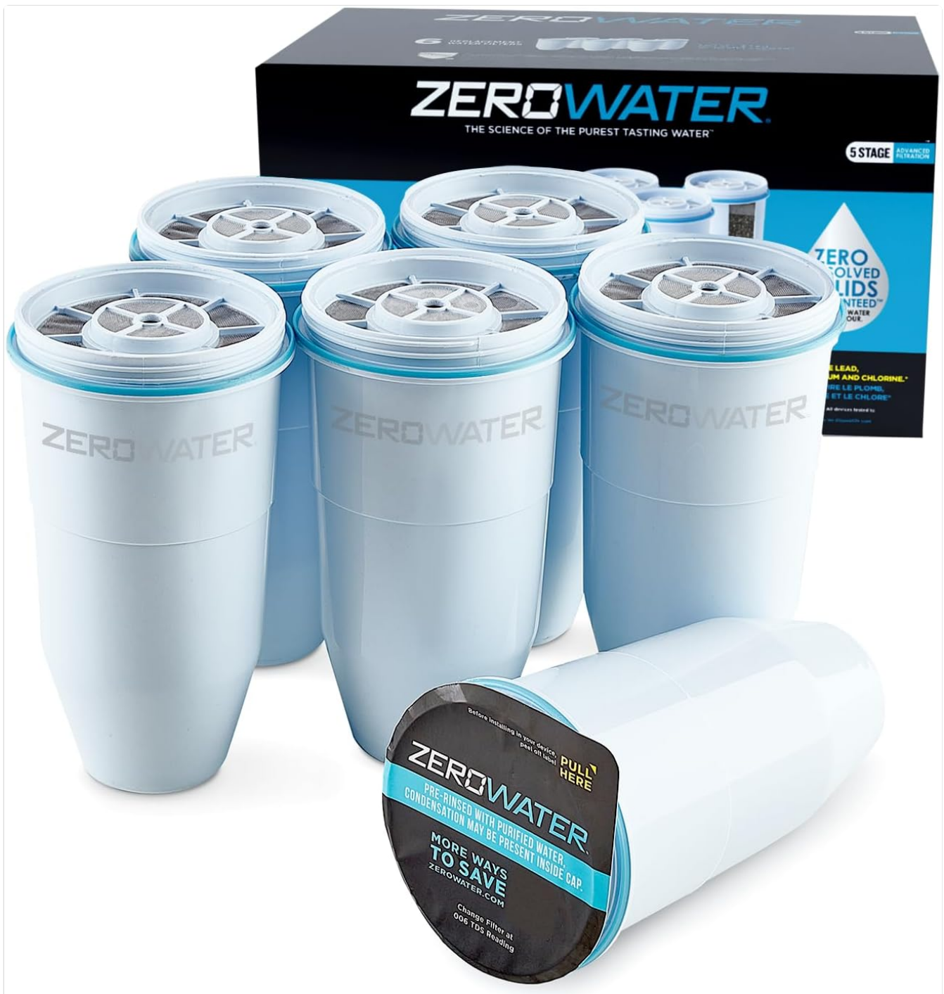
Image: ZeroWater 5-Stage Water Filter 6-Pack, showing the filters and packaging. This pack contains six replacement filters.