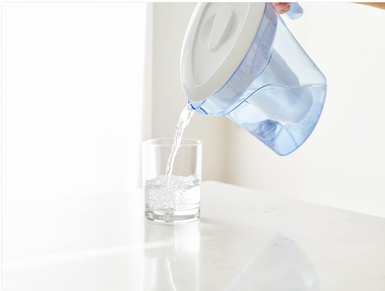
Image: Clear, filtered water being poured from a ZeroWater pitcher into a glass, ready for drinking.