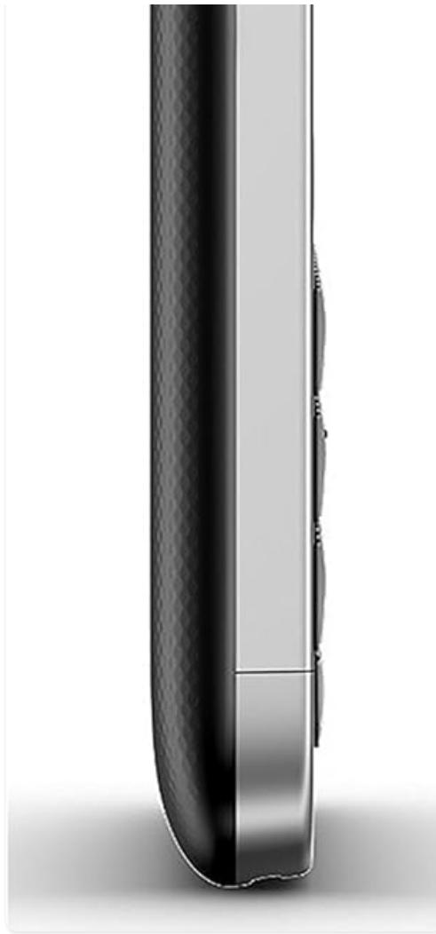
Figure 3: Side profile of the BlackBerry Classic, indicating the location of the SIM and SD card trays.