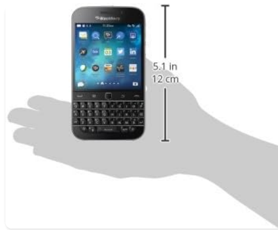
Figure 2: The BlackBerry Classic in hand, illustrating its dimensions and form factor.