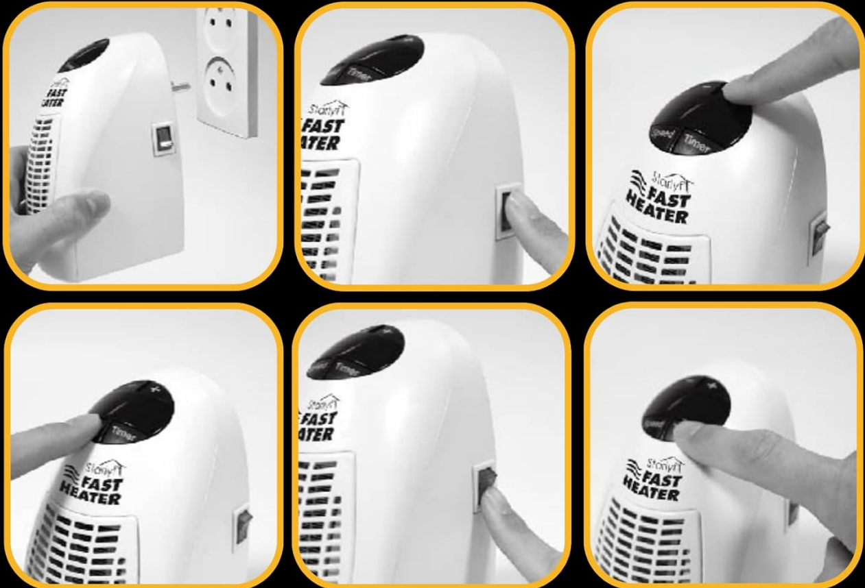
Figure 2: Setup and Initial Use Steps