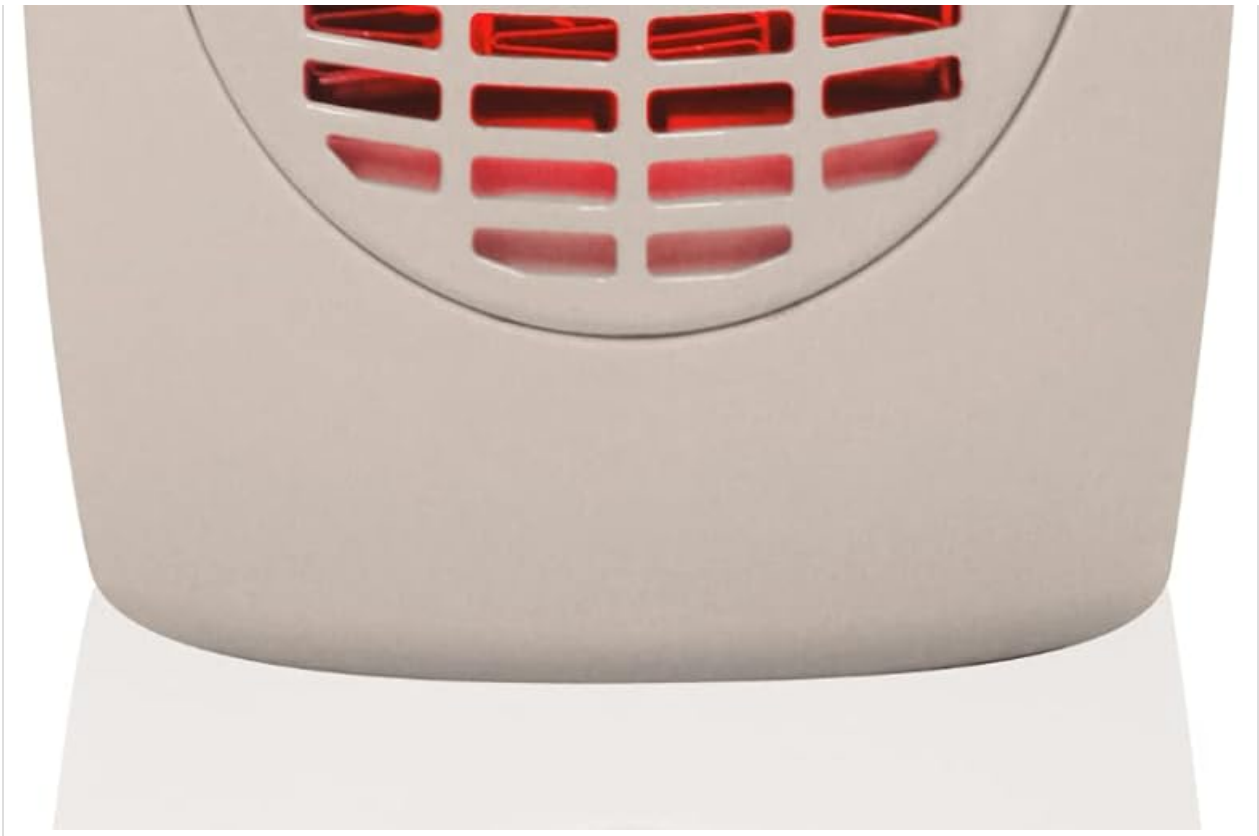
Figure 3: Front View of the Heater