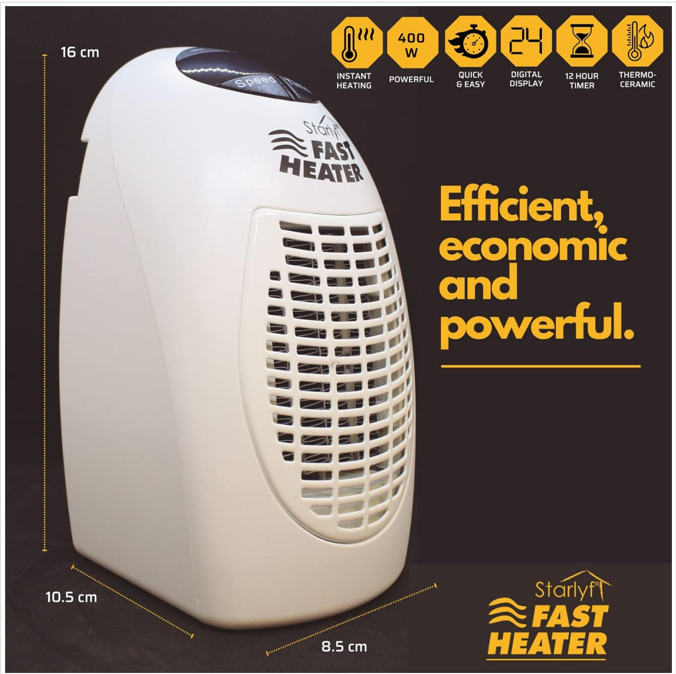
Figure 4: Product Dimensions and Key Specifications