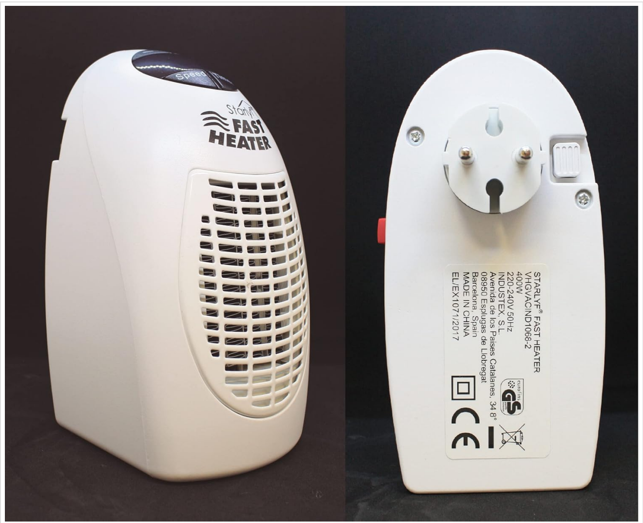
Figure 5: Rear View with Plug and Product Label