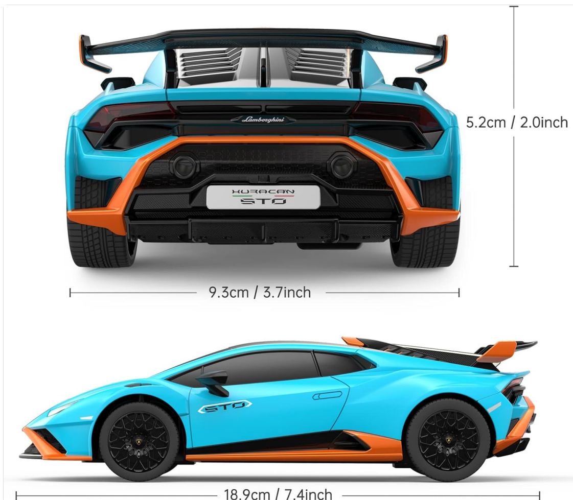
Image: Technical drawing illustrating the dimensions of the RASTAR R/C Lamborghini Huracan STO: 18.9 cm (7.4 inches) in length, 9.3 cm (3.7 inches) in width, and 5.2 cm (2.0 inches) in height.