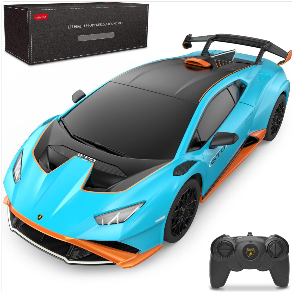
Image: The RASTAR R/C 1:24 Lamborghini Huracan STO car in blue and orange, accompanied by its remote controller and product packaging.