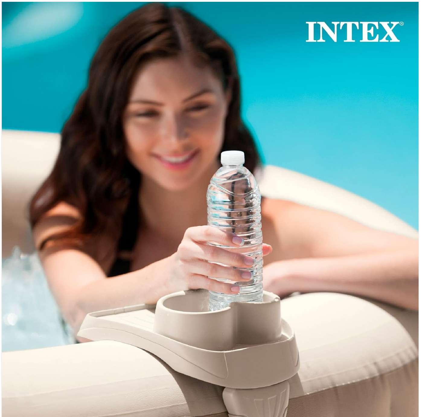
Figure 5: A user placing a water bottle into one of the cup holder slots.