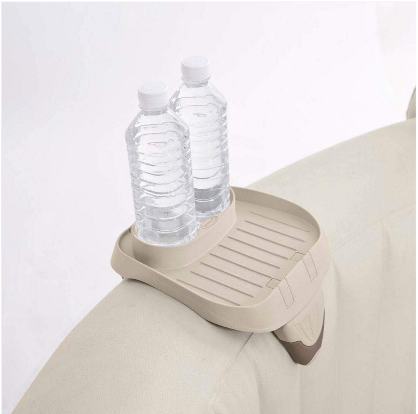
Figure 4: The cup holder securely attached to the spa wall, ready for use.