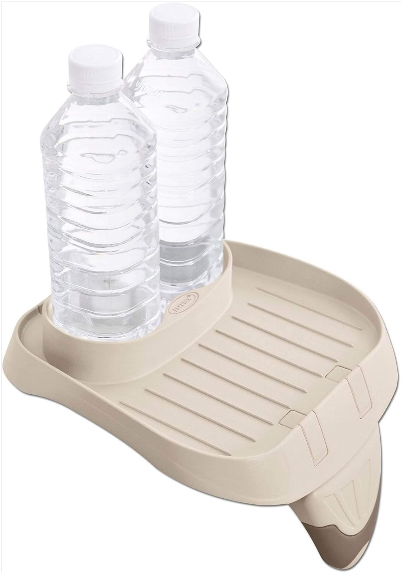
Figure 6: The cup holder accommodating two standard water bottles.