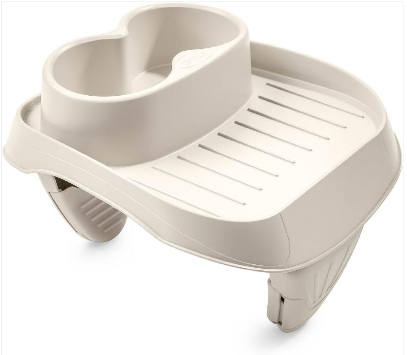
Figure 1: Front view of the Intex PureSpa Attachable Cup Holder.