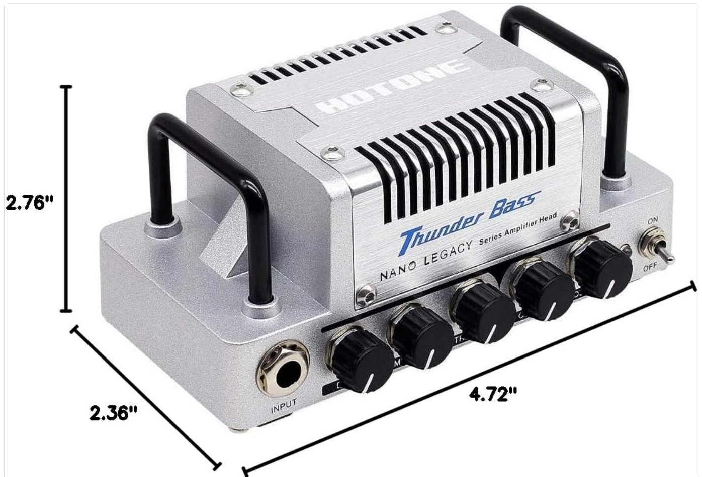
Figure 3: Product Dimensions.