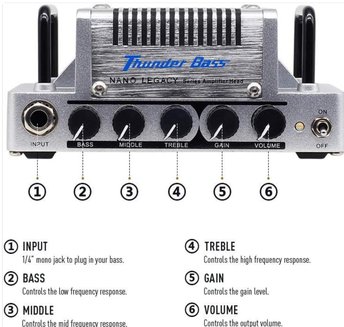
Figure 1: Front Panel Controls and Input. (1) INPUT: 1/4" mono jack for bass guitar.