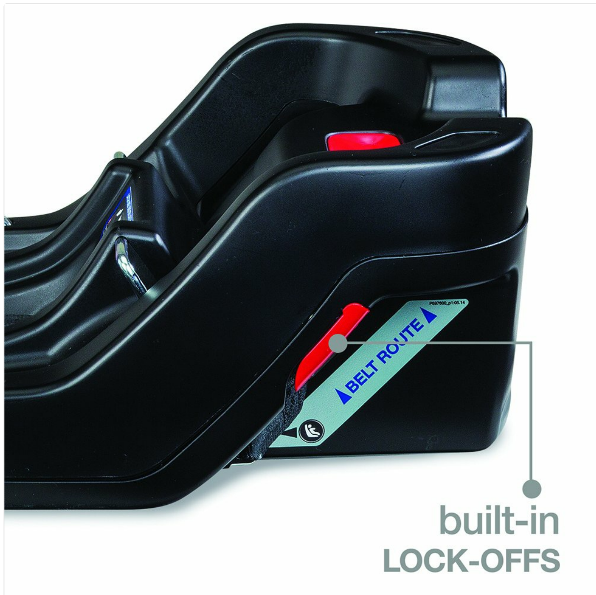
Figure 4: Detail of the built-in lock-offs on the Britax Infant Car Seat Base, used for securing the vehicle's seat belt.