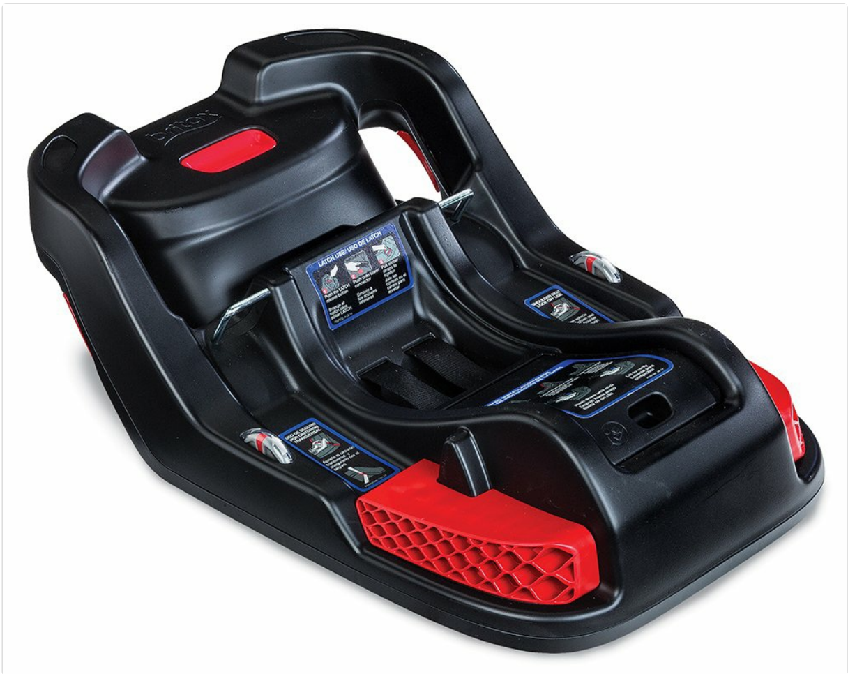
Figure 1: Front view of the Britax Infant Car Seat Base, showing the overall design and red accents.