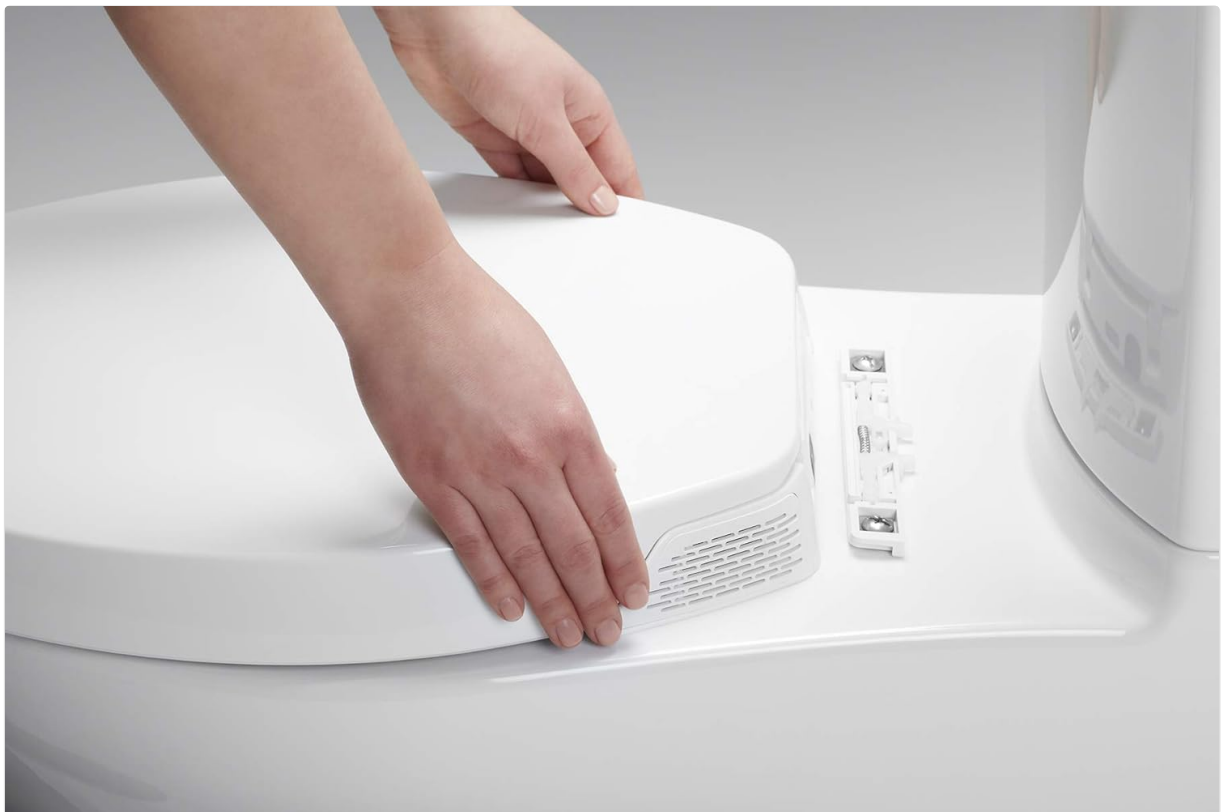
Image: This image shows hands carefully lowering the toilet seat onto the installed hinge posts on the toilet bowl, demonstrating a step in the installation process.