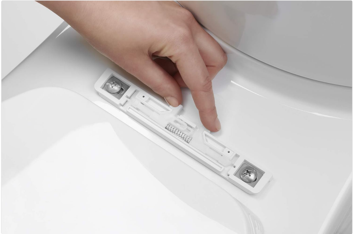
Image: A close-up view of the Quick-Release hinge mechanism, showing the mounting screws and the design that allows for easy removal and reattachment of the seat.