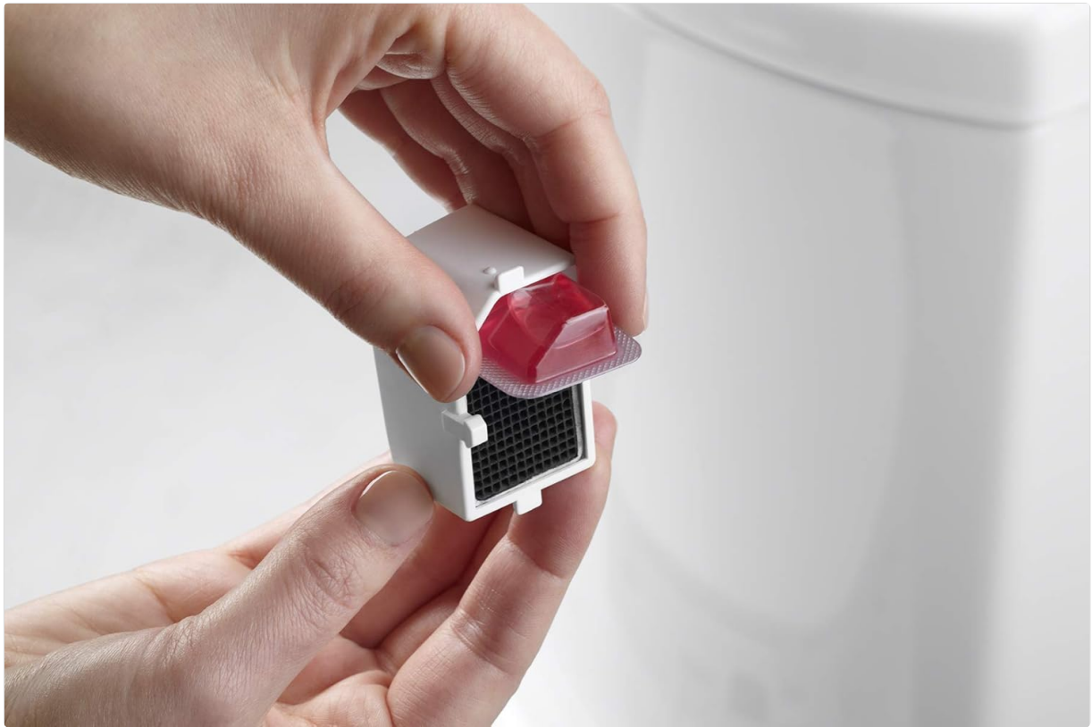
Image: A hand carefully placing a small, red scent pack into a dedicated slot within the toilet seat's freshener compartment.