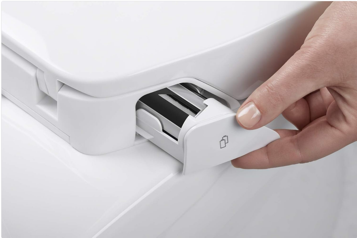
Image: A hand demonstrating the Quick-Release function by lifting a lever on the toilet seat hinge, which allows the seat to be easily detached for cleaning.