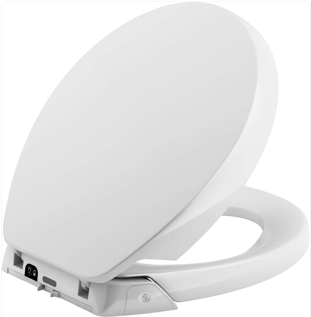
Image: A side profile of the KOHLER Purefresh Round Toilet Seat, illustrating the main seat and the smaller, integrated toddler seat in an upright position, tucked into the lid.