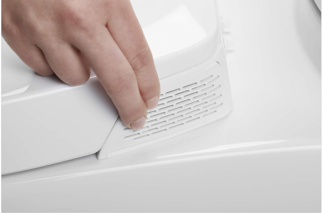
Image: A hand pressing a small button on the side of the toilet seat, which opens the vent for the odor neutralization system, allowing access to the carbon filter.