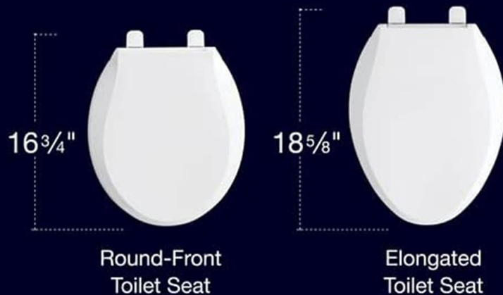
Image: This diagram illustrates the difference in length between round-front (approximately 16¾ inches) and elongated (approximately 18⅝ inches) toilet seats, aiding in proper selection.

In general, a round-front seat will fit round bowl toilets, and an elongated toilet seat will fit elongated toilets. However, you should measure the current seat from the hinge bolt to the front of the seat to ensure your chosen seat will fit your toilet.