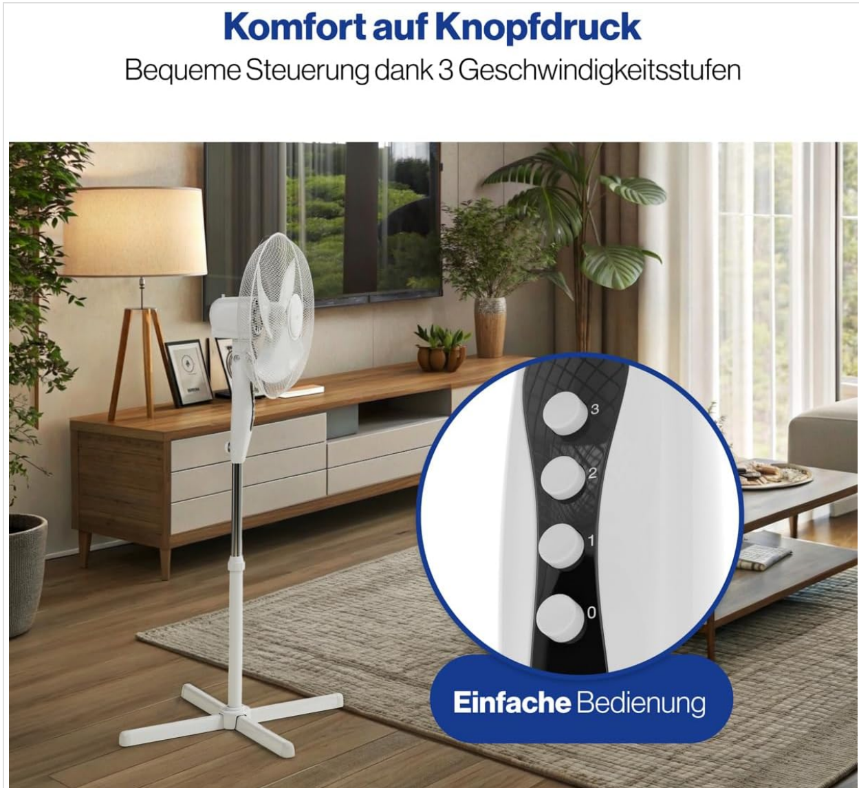
Figure 4: Close-up of the fan's control panel with buttons for speed settings (0, 1, 2, 3) and oscillation.