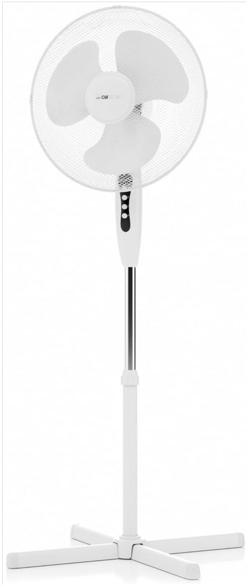
Figure 2: Close-up views of the fan's control panel with speed settings, practical carrying handle, durable motor, and stable cross base.