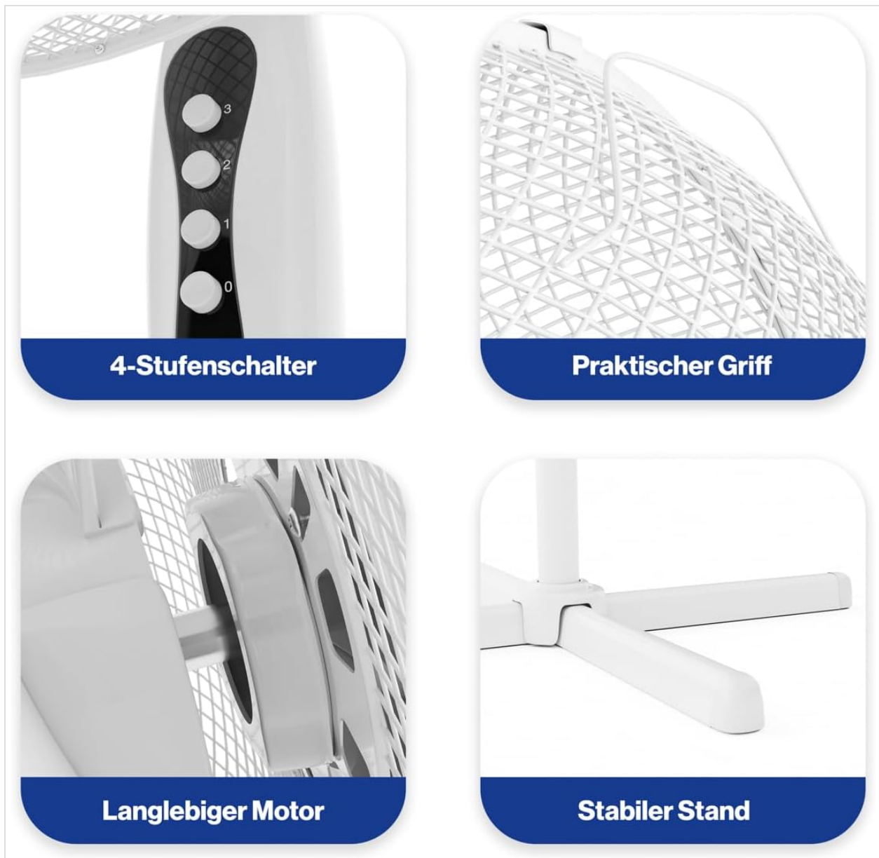
Figure 3: Visual representation of the fan's adjustable height up to 125 cm and 40 cm diameter, along with its 4-step switch (0/1/2/3), 45W power, and oscillation function.