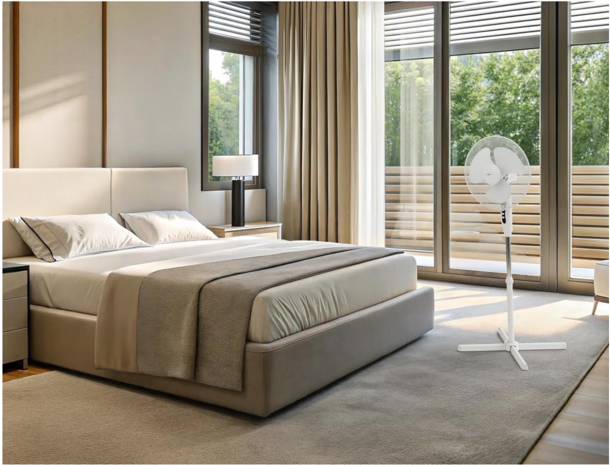
Figure 7: The Clatronic VL 3603 S fan operating quietly in a bedroom, highlighting its suitability for undisturbed sleep.

Unterstützt den Schlaf durch leise Betriebsgeräusche