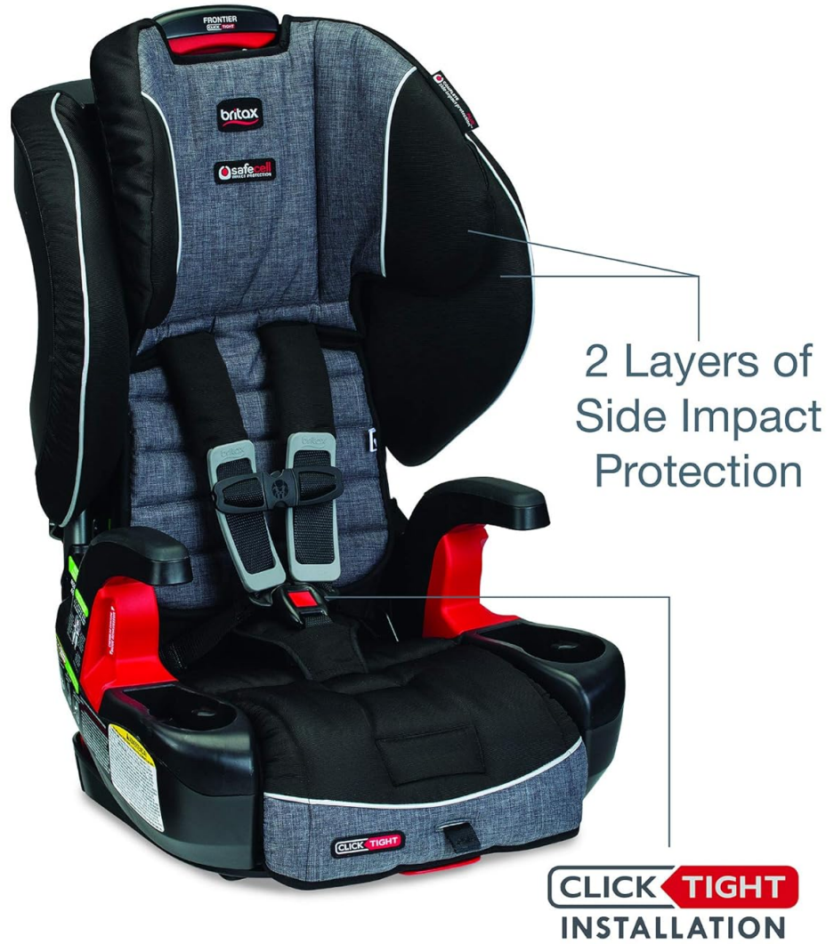
Image 2: Side view of the car seat, illustrating the two layers of side impact protection.