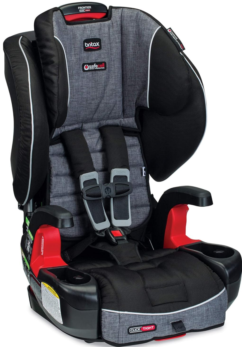
Image 1: The Britax Frontier ClickTight Harness-2-Booster Car Seat, showcasing its design and features.