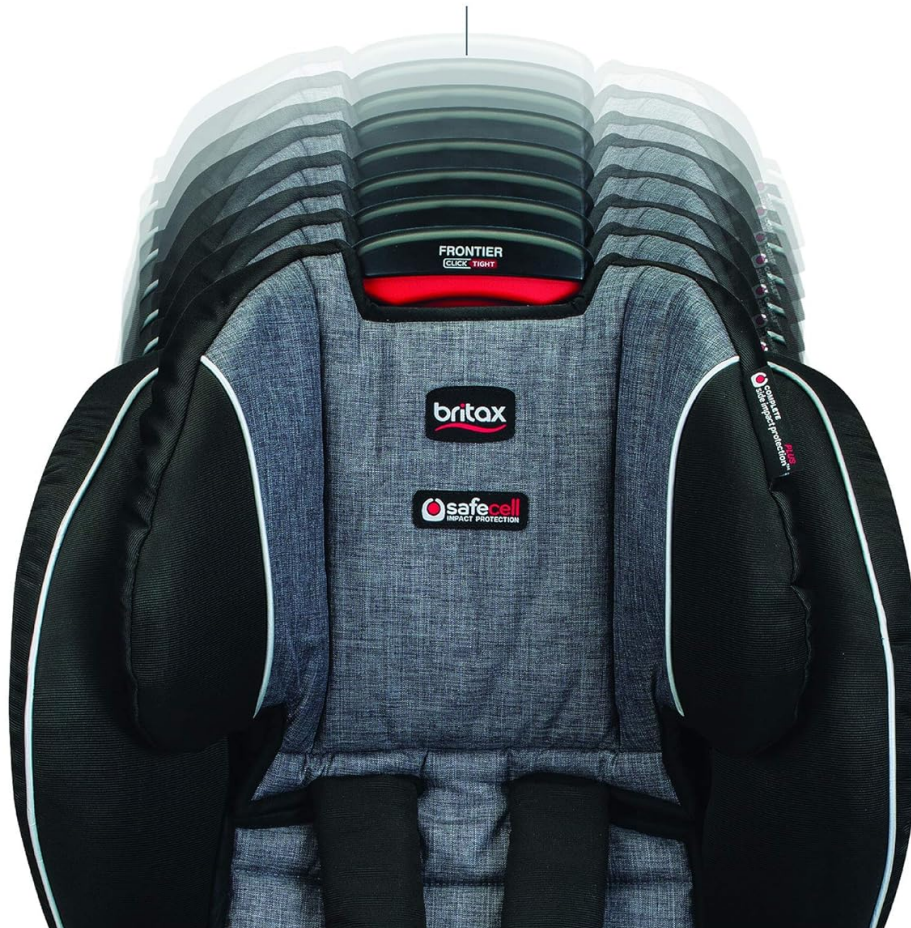
Image 6: Detail of the 5-point harness system, which can be easily tucked away when transitioning to booster mode.