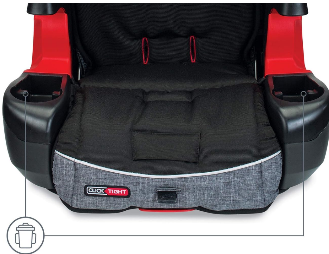
2 Integrated Cup Holders