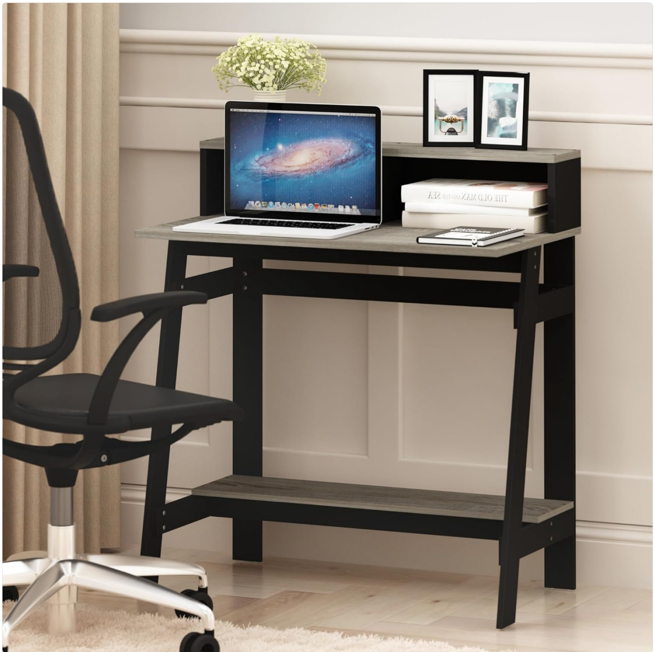
Image: The desk in a home office setting, featuring a laptop and mouse, demonstrating its compact size and functionality.