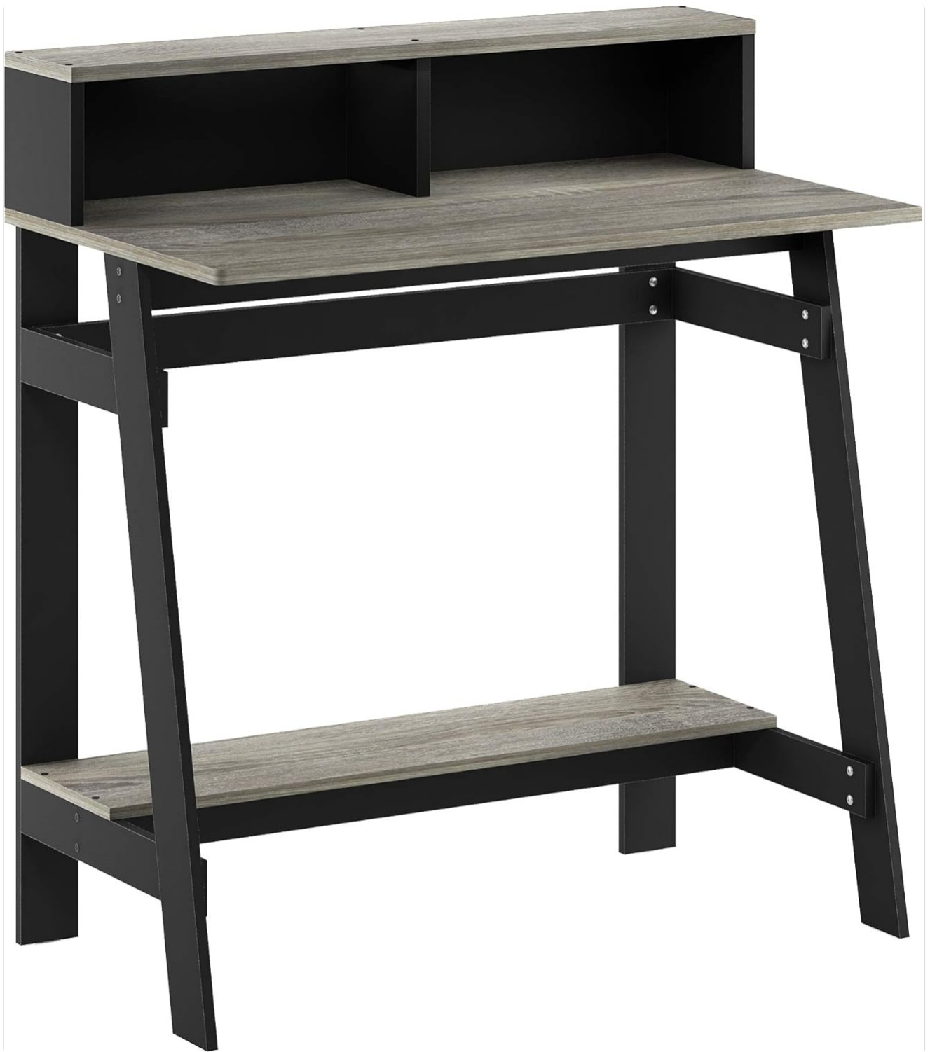
Image: The fully assembled Furinno Simplistic A Frame Computer Desk, showcasing its black frame and French oak grey surfaces.