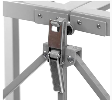
Image: Step-by-step visual guide illustrating the simple unfolding and locking process of the shelving unit.