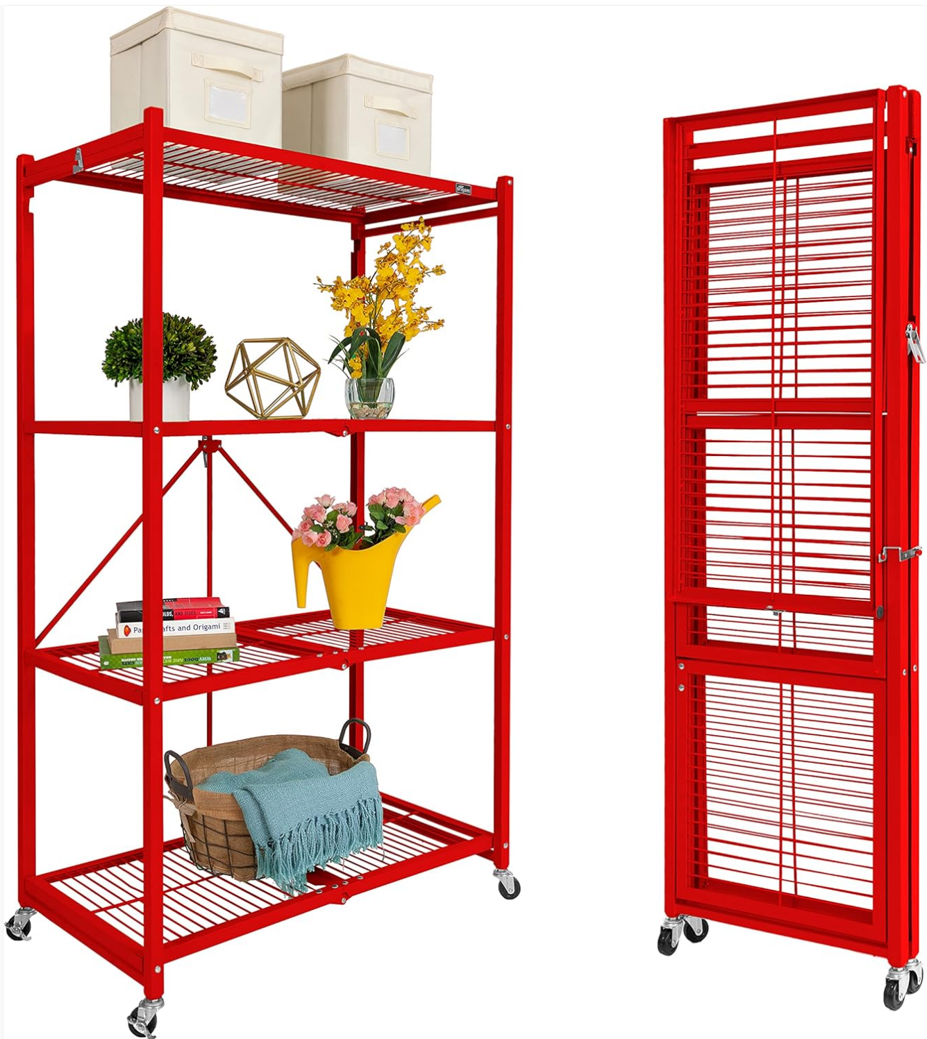
Image: The Origami R5 4-Tier Foldable Shelving Unit, showcasing its assembled form with items stored on its shelves, highlighting its practical use.