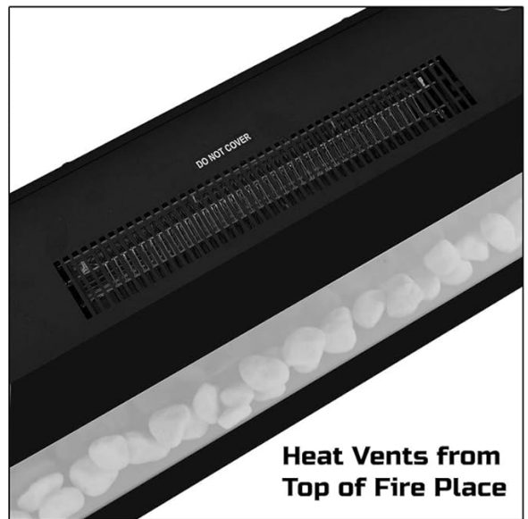
Figure 1: Fireplace dimensions (20"H x 54"W x 4.75"D) and location of control panel, cord, and top heat vents. Note that heat vents are located at the top of the unit.