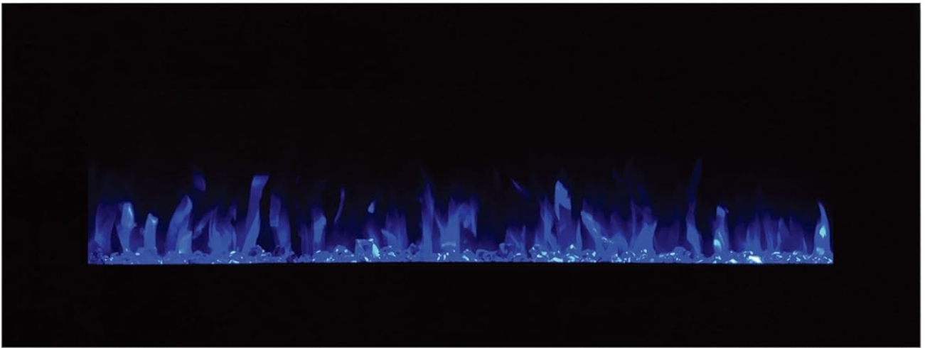
Figure 4: Examples of the adjustable LED flame colors, including amber, blue, and a combination of both.