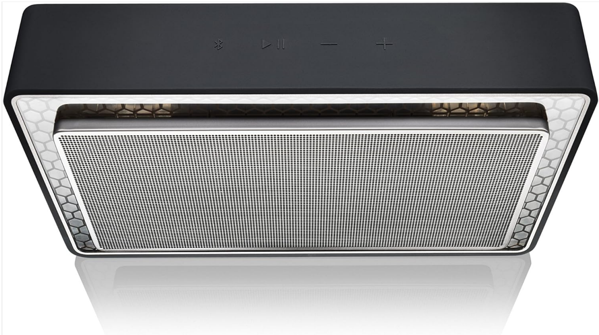
Image: Front view of the Bowers & Wilkins T7 Portable Bluetooth Speaker, showcasing its compact design and speaker grille.

Thank you for choosing the Bowers & Wilkins T7 Portable Bluetooth Speaker. This manual provides essential information for setting up, operating, and maintaining your speaker to ensure optimal performance and longevity. Please read these instructions carefully before use.