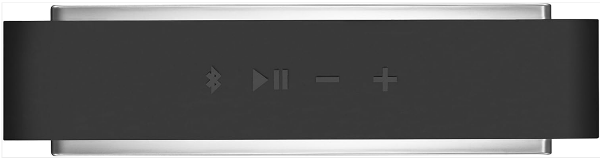
Image: Top view of the T7 speaker, showing the control buttons for Bluetooth, Play/Pause, Volume Down, and Volume Up.