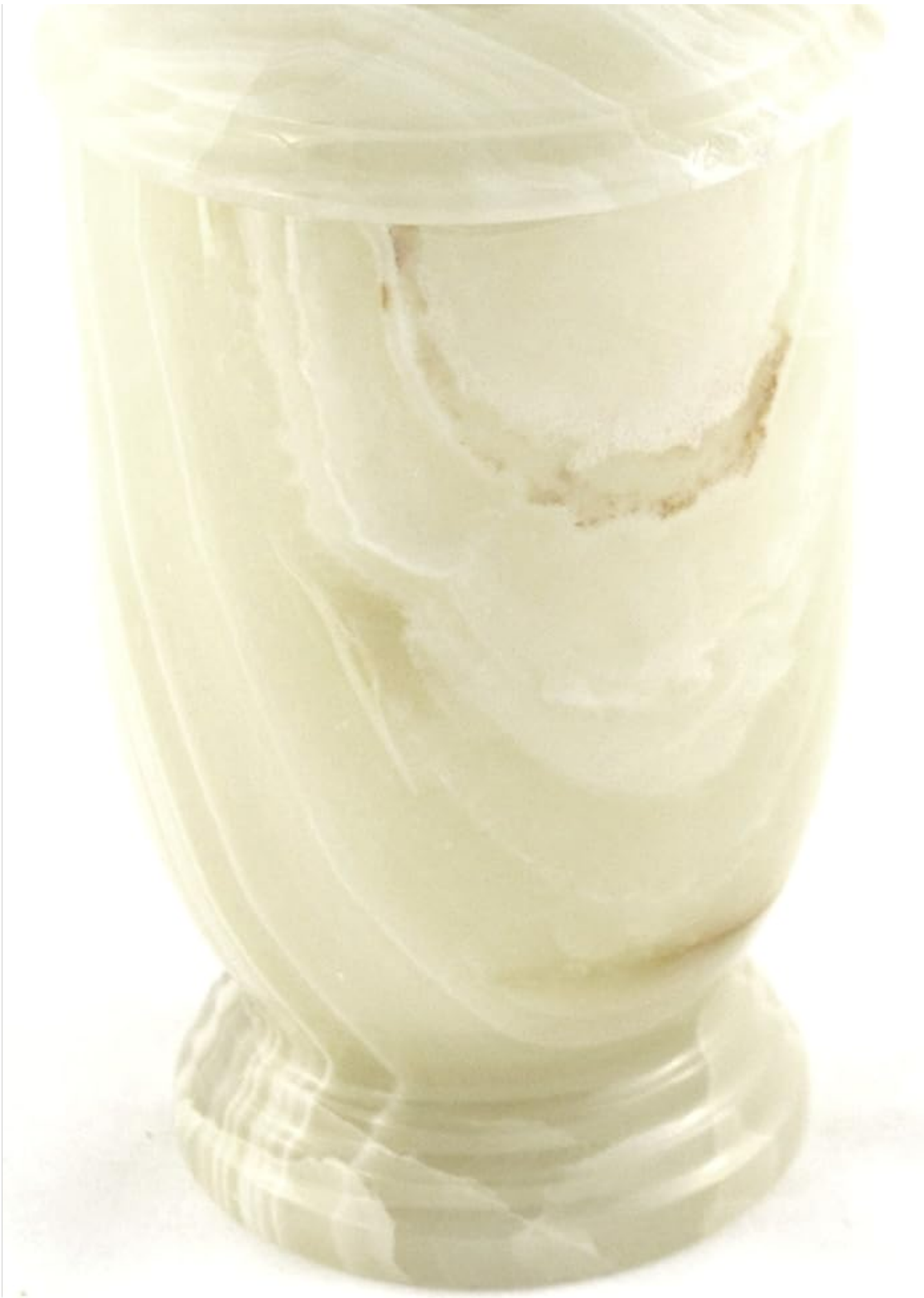
Figure 1: The Nature Home Decor White Onyx Lotion Dispenser, showcasing its natural white onyx body and stainless steel pump mechanism.

The Nature Home Decor White Onyx Lotion Dispenser is designed for dispensing liquid soaps, lotions, or hand sanitizers. It features a robust body crafted from natural white onyx and is equipped with a high-quality, tarnish-resistant stainless steel pump. An internal removable plastic bottle facilitates easy filling and cleaning.