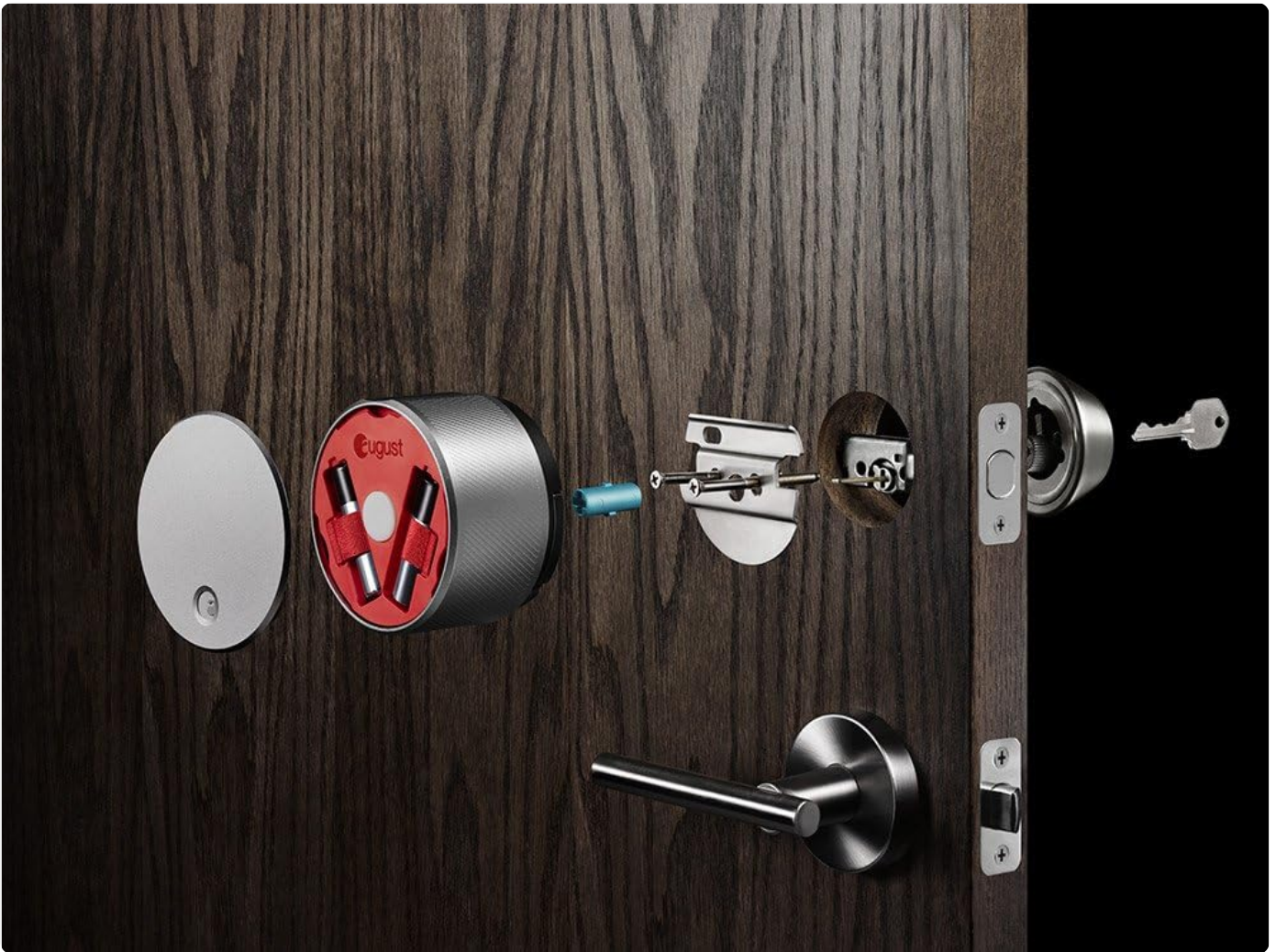
Figure 2: Exploded view demonstrating the components of the August Smart Lock and how it integrates with an existing deadbolt on a wooden door.