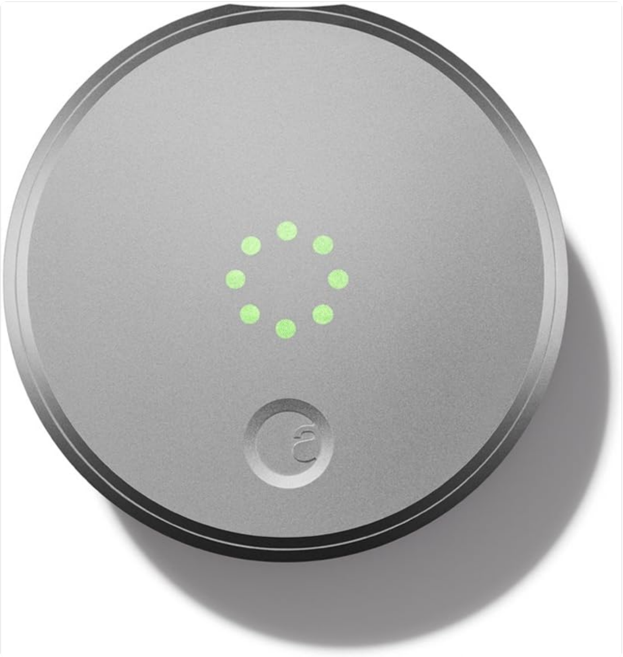
Figure 1: August Home 1st Generation Smart Lock, a sleek silver circular device designed to attach to the interior side of your door's deadbolt.