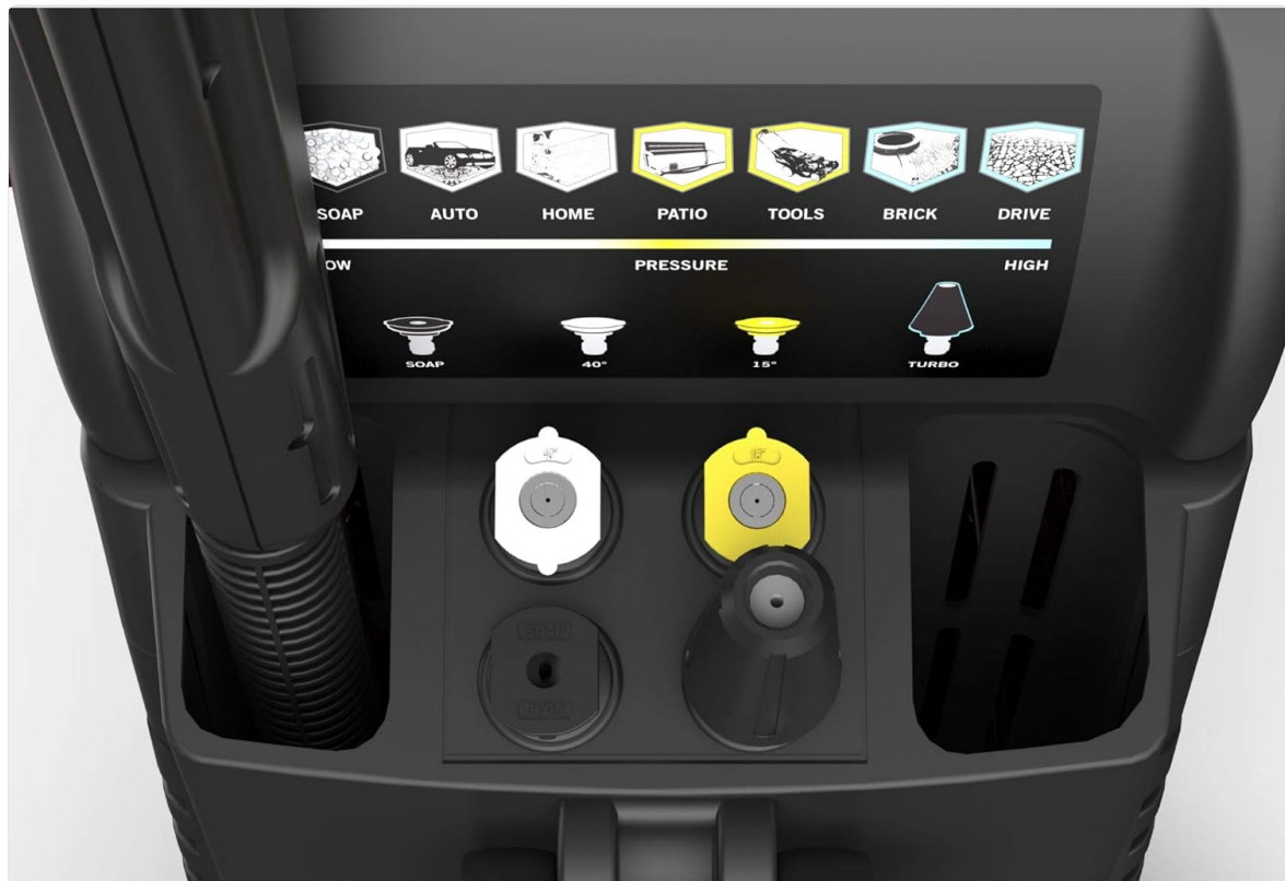
Figure 4.1: Integrated storage for quick-connect nozzles, allowing for easy selection and organization.

To change nozzles, pull back the collar on the spray gun wand, insert the desired nozzle, and release the collar to lock it in place. Always ensure the nozzle is securely attached before operating.