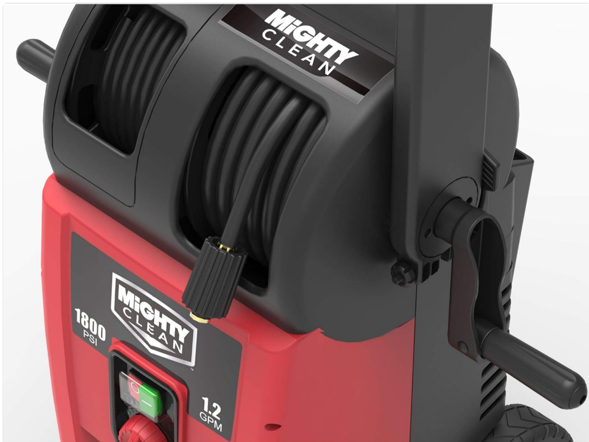
Figure 5.1: Close-up view of the live hose reel, designed for convenient hose management during and after use.

Utilize the live hose reel to neatly store the high-pressure hose and the easy-wind power cord reel for the electrical cord. This prevents tangles and extends the life of the components.