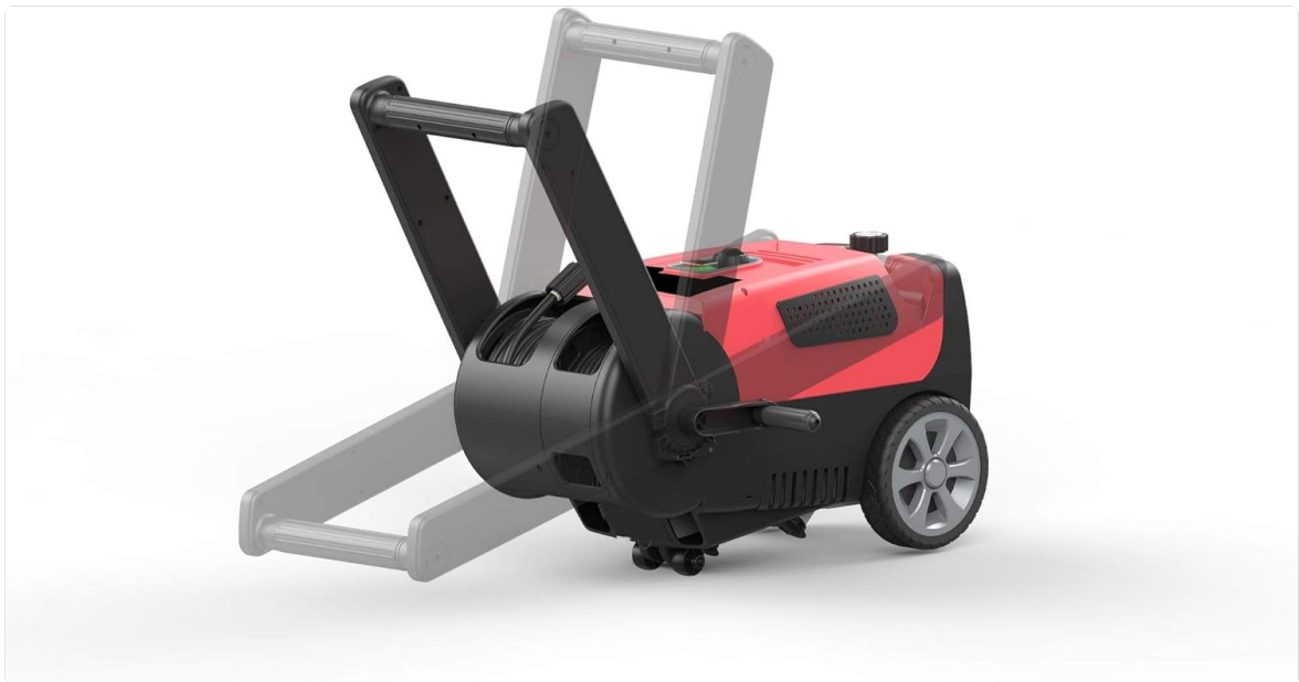
Figure 3.1: The MC1800's convertible cart design, allowing for flexible positioning during use and compact storage.