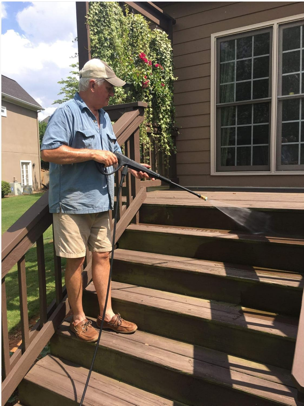
Figure 4.3: A user demonstrating the effective use of the pressure washer for cleaning outdoor surfaces.