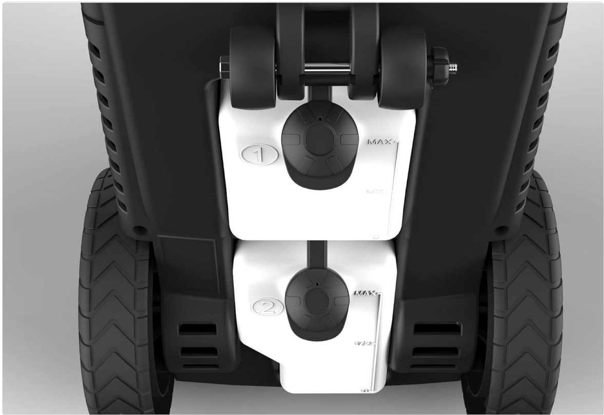
Figure 4.2: The dual soap tanks located at the base of the unit, with a selector switch for convenience.