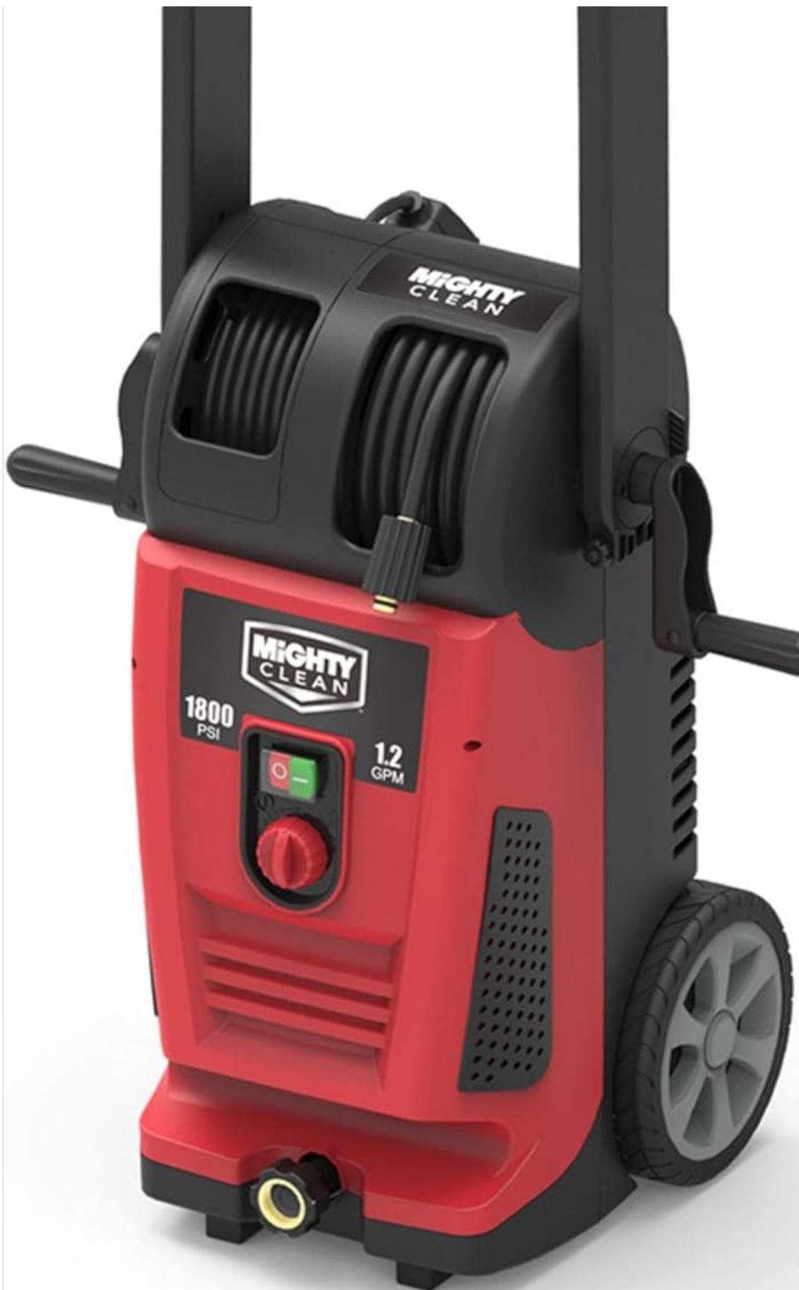
Figure 1.1: The Yard Force Mighty Clean MC1800 Electric Pressure Washer, showcasing its compact design and integrated hose reel.