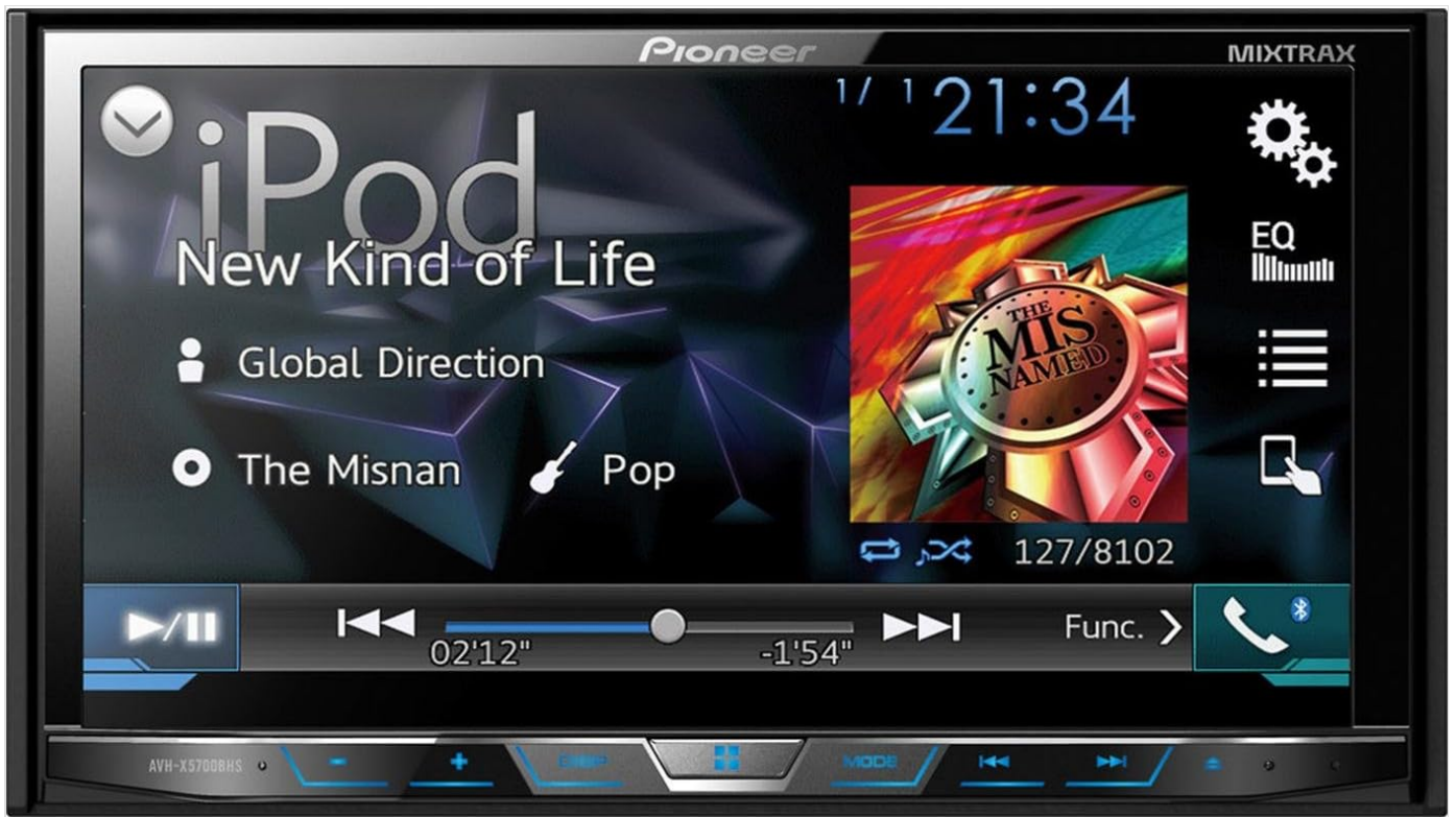
Figure 3.1: Main display showing media playback interface, including iPod source, track information, and playback controls.