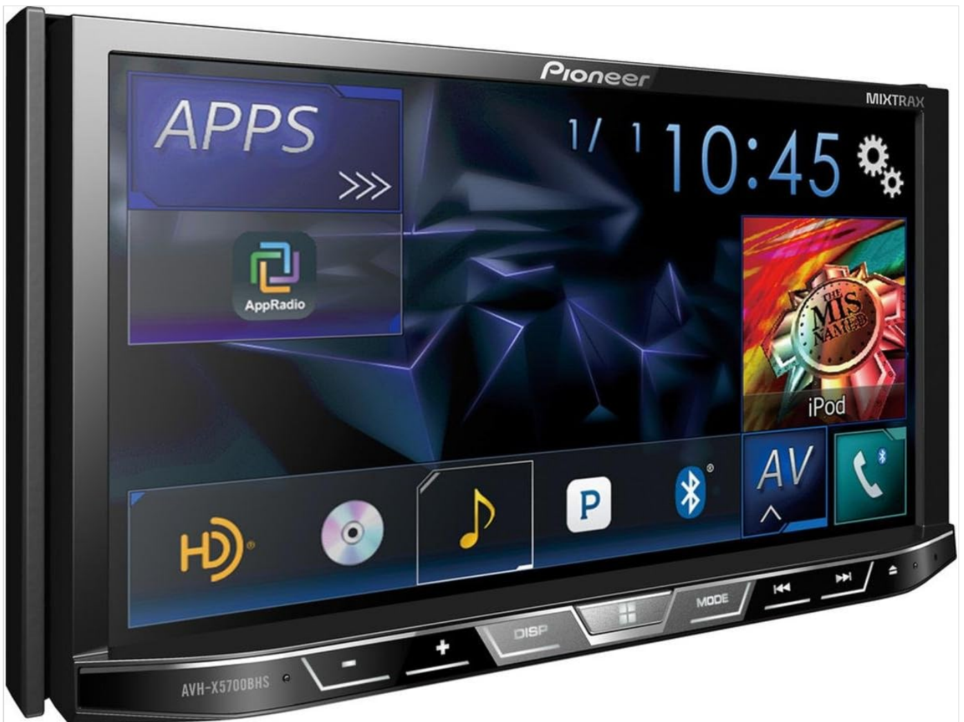
Figure 3.2: App selection screen, providing access to various integrated applications like AppRadio.