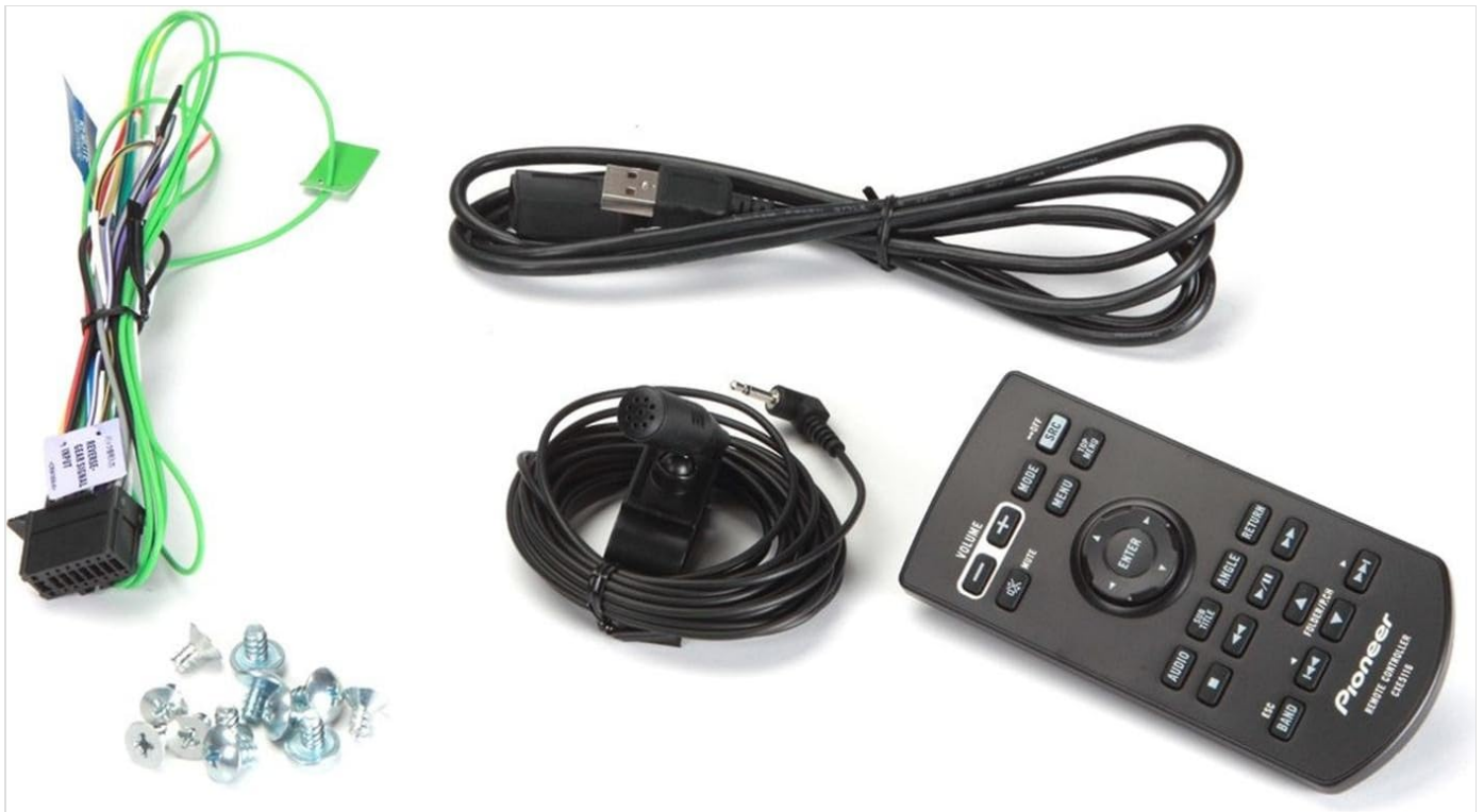
Figure 2.1: Included wiring harness and external microphone for hands-free calling.