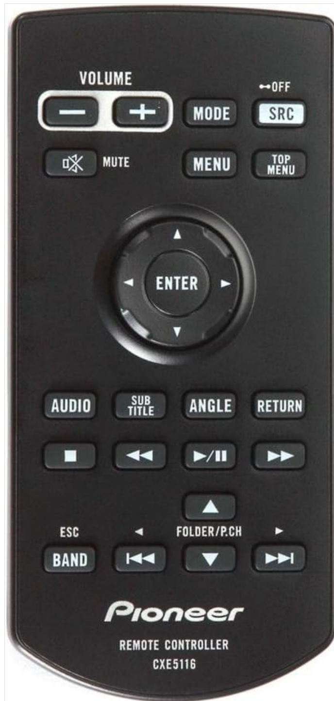
Figure 2.2: Remote control (CXE5116) and USB extension cable.