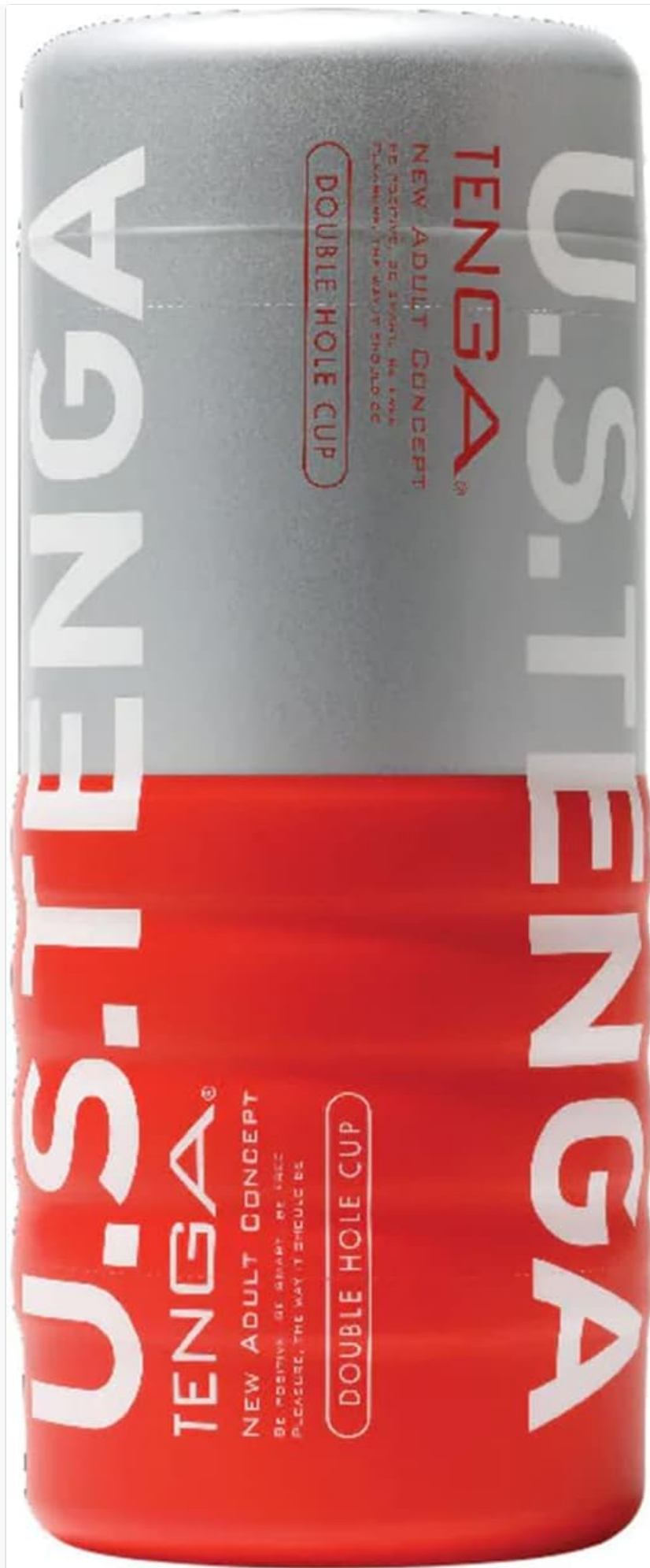
Figure 2.1: TENGA TOC-004US Ultra-Size Double-Hole Cup. This image displays the product in its packaging, highlighting the "U.S. TENGA" and "DOUBLE HOLE CUP" branding.