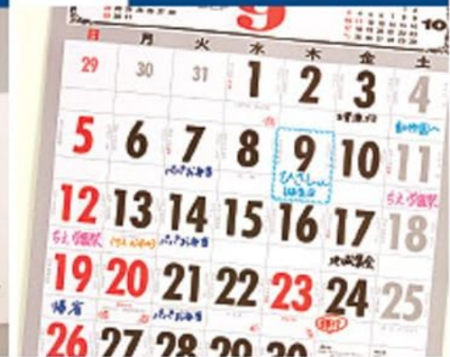
Image: Examples of Procky pens being used for creating colorful charts and marking dates on a calendar, illustrating their utility for organization and creative tasks.