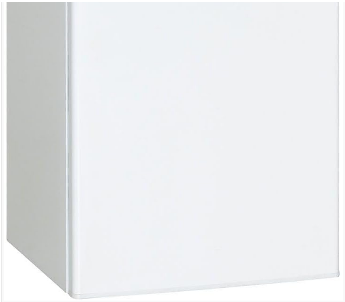
Image: A front view of the Danby DAR110A1WDD 11 Cu.Ft. Apartment Refrigerator in white, showcasing its compact design.