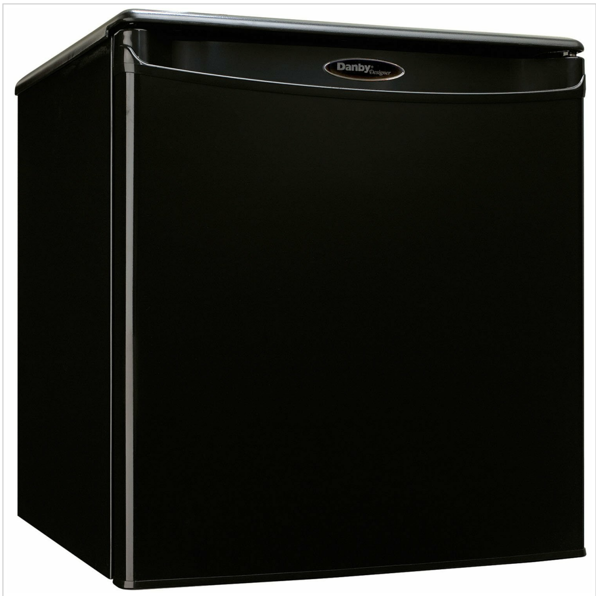
Figure 1: Front view of the Danby Designer 1.7 cu. ft. Compact Refrigerator.