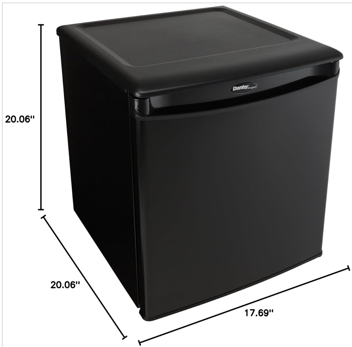
Figure 2: Dimensions of the compact refrigerator for proper placement.